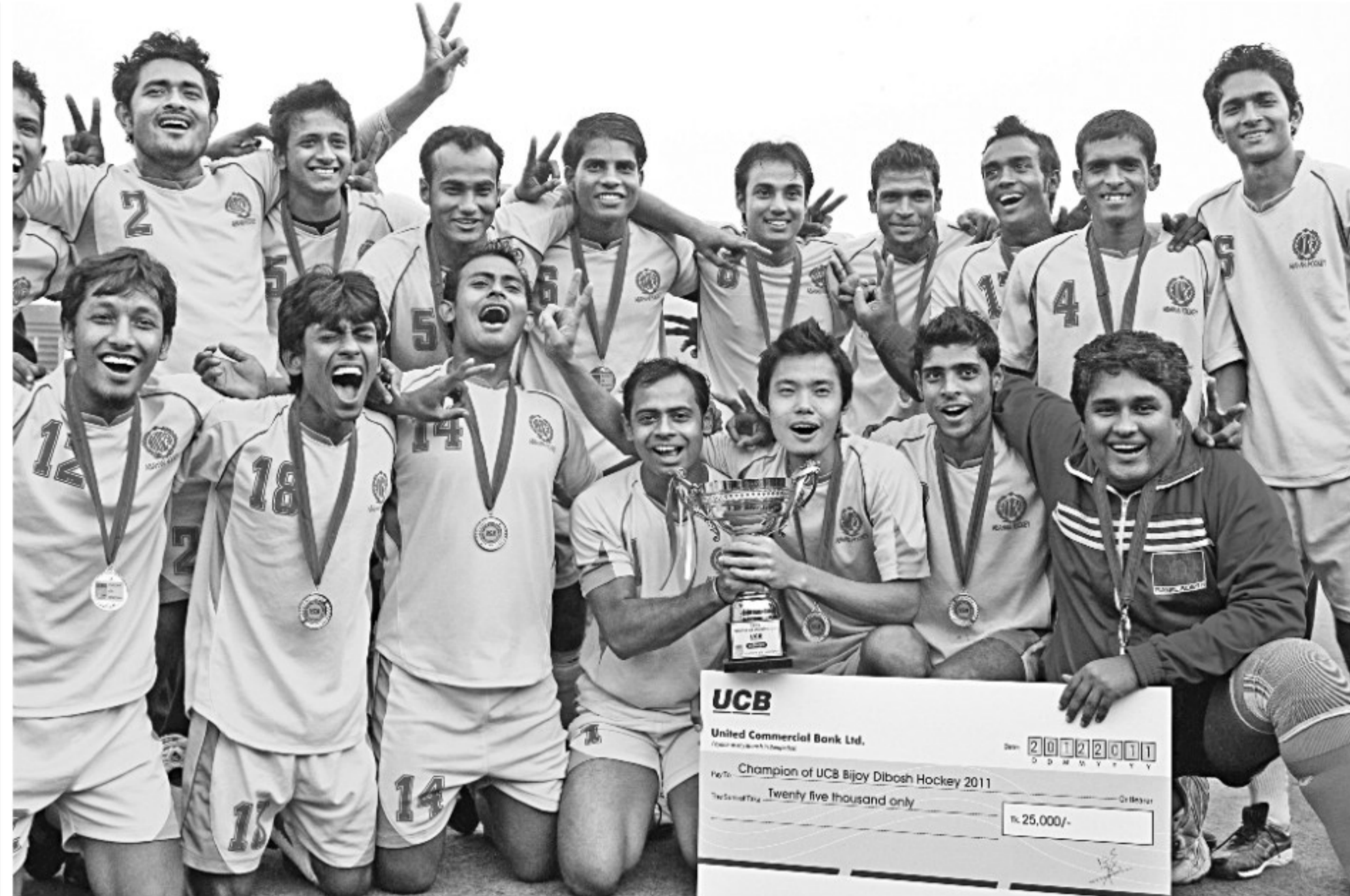
Abahani players celebrate with the UCB Victory Day Hockey Tournament trophy after defeating Bangladesh Army 4-2 in the final at the Maulana Bhasani Hockey Stadium yesterday.