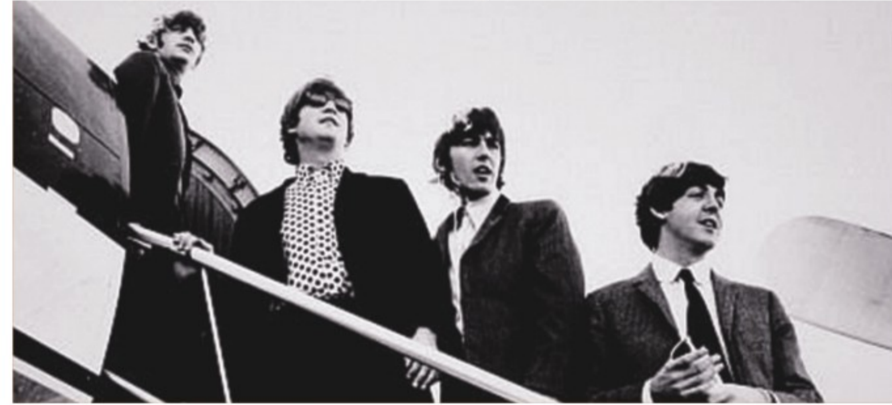
McCartney (R) with the rest of the Beatles boarding a plane, c. 1965.