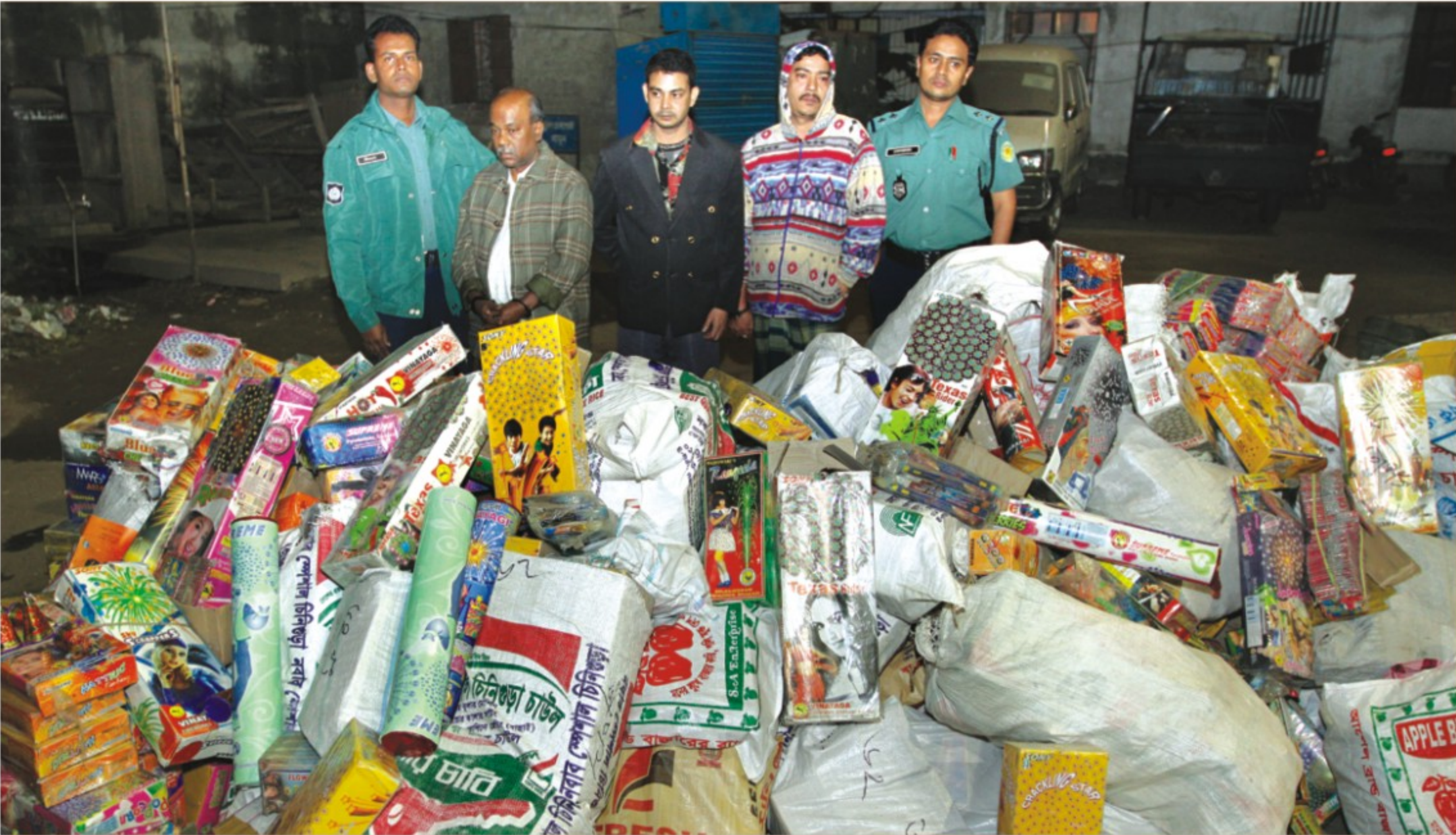
Three arrested persons along with explosive materials seized from Shakhribazar area in the city yesterday.