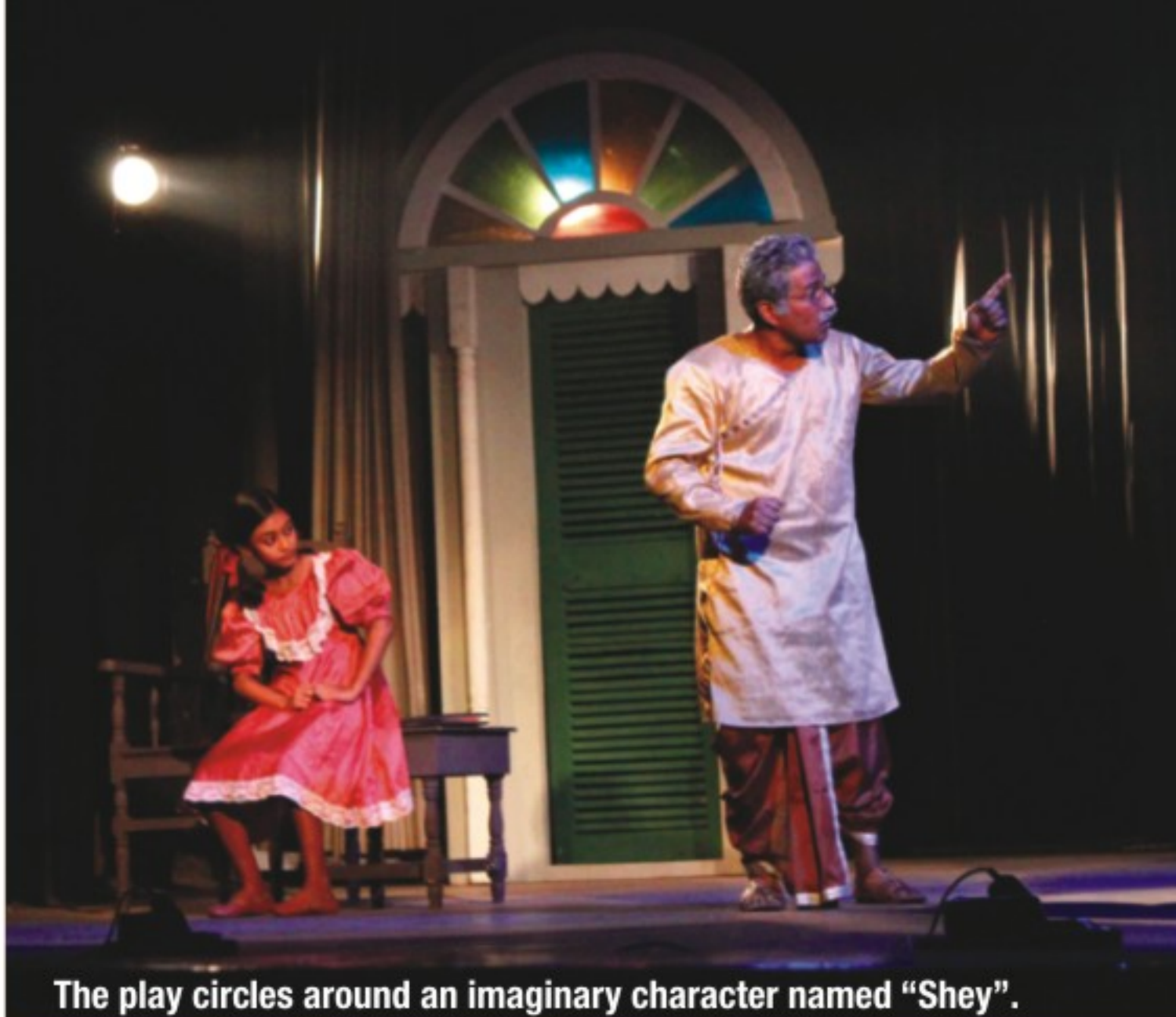
The play circles around an imaginary character named "Shey".