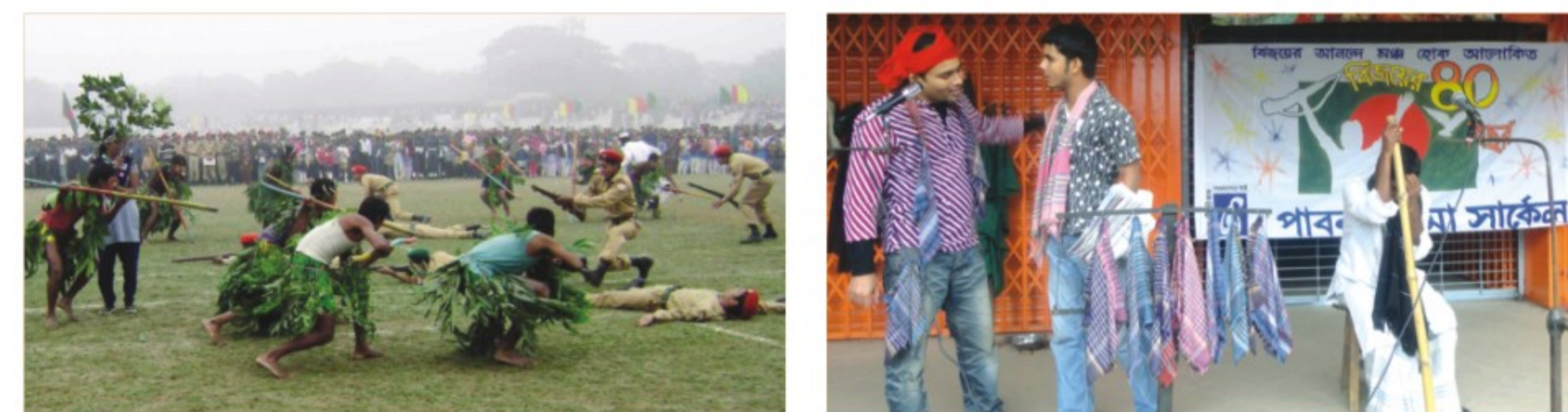
Educational institutions and the district administration chalked out elaborate programmes marking the day.

War are the highlights of the fair. To celebrate Victory Day, residents of Bartha and Baliabil village of Manikganj Sadar upazila arranged a traditional horse race on the river banks on Friday afternoon.