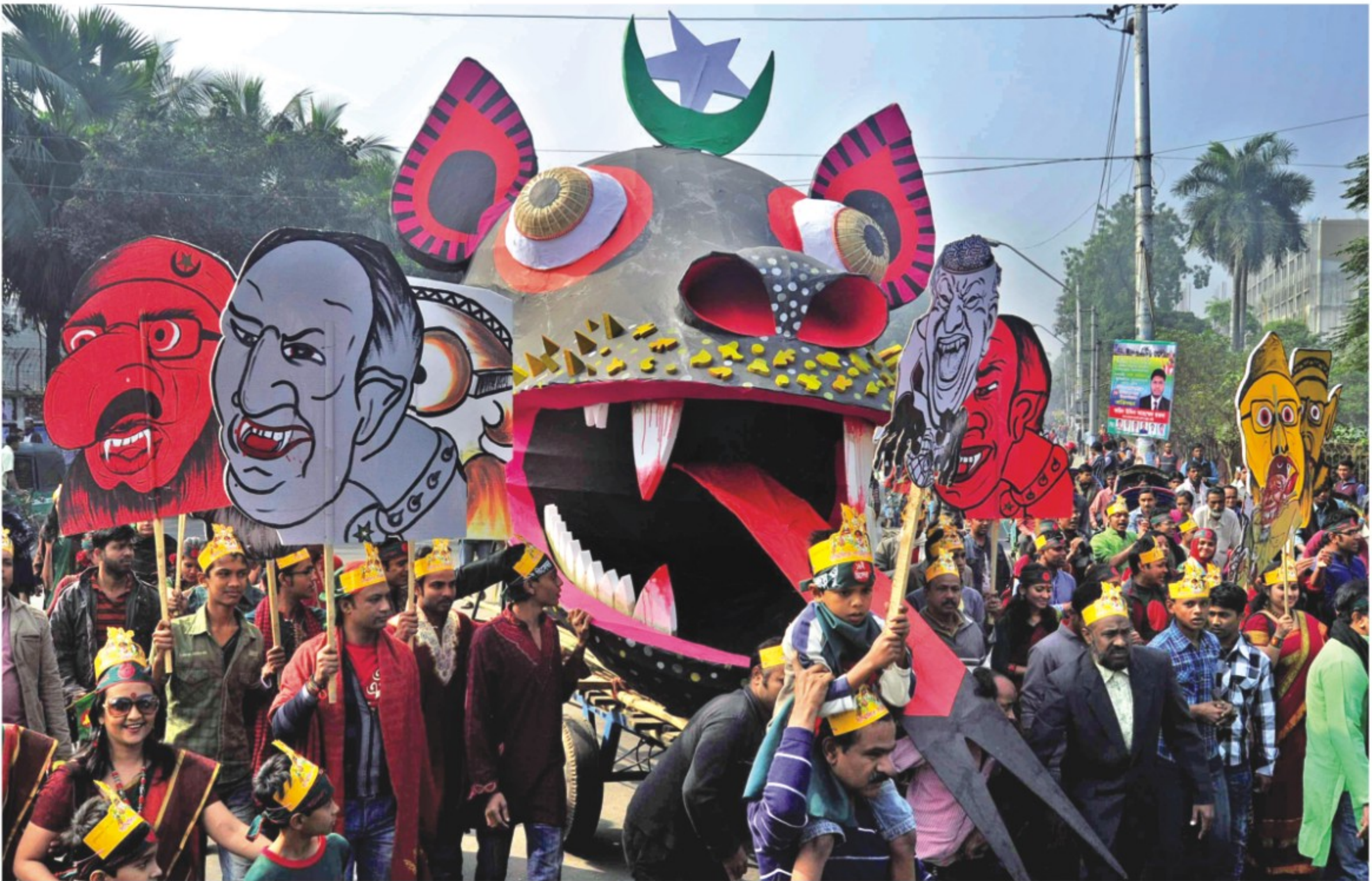
Sammilito Sangskritik Jote brings out their colourful Bijoy procession on Dhaka University campus yesterday celebrating the Victory Day. Their slogan for this year was "We demand trial of war criminals".