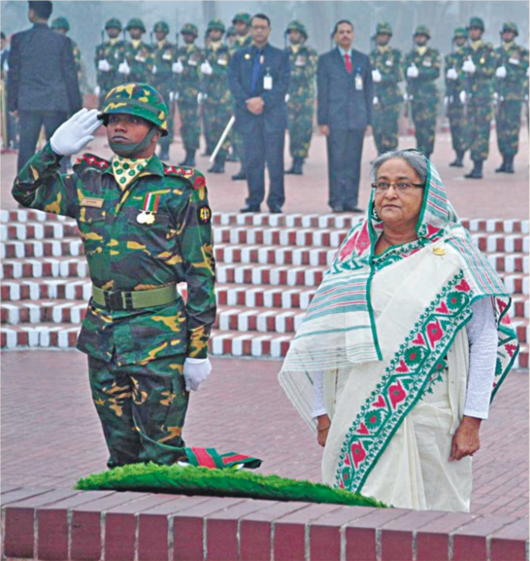
Prime Minister Sheikh Hasina stands in silence for a few moments to pay homage to the martyrs of the liberation war at National Memorial in Savar yesterday.