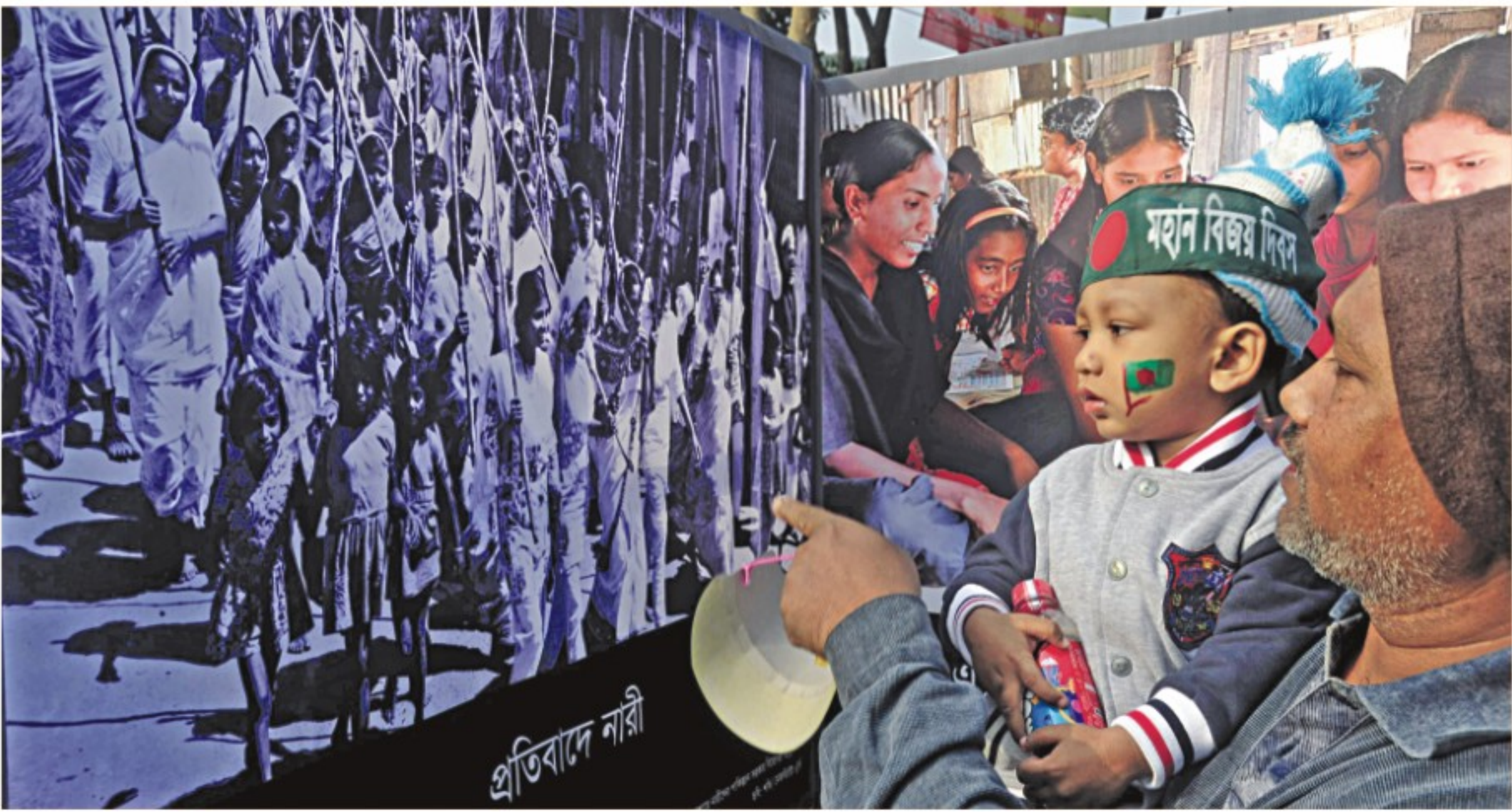
A man shows a child a photo taken during the War of Liberation in 1971 of women staging protests on the streets. The photo is a part of a 'mobile photo exhibition' organised by Brac before Central Shaheed Minar premises in the city yesterday marking the 40th anniversary of Victory Day.

Brac, an NGO, yesterday launched a two-day long mobile photo exhibition in the city to uphold the spirit of liberation war and to inject vigour among the people to work for development of the society and the nation. The exhibition that displayed dozens of large photos mainly focused on the resilience power of the Bangladeshi people who fought against Pakistani occupation forces in 1971 and have been struggling against poverty, natural disaster and many other adversities since the independence. The organisation arranged the function styled "Glorious past, prosperous future" marking the 40th anniversary of Victory Day of the country. On the first day, two rickshaw-vans carrying photographs visited different spots, including Bangabandhu National Stadium, Dhaka University campus, Dhanmondi lake, martyred intellectuals' graveyard, National Parade Square and parliament. Today, these will visit Nilkhet, Tejgoan, Gulshan, Airport and old Dhaka. Brac also organised day-long programmes, including film show, cultural programme and photo exhibition in Chittagong, Rajshahi, Khulna, Barisal, Sylhet and Rangpur yesterday.