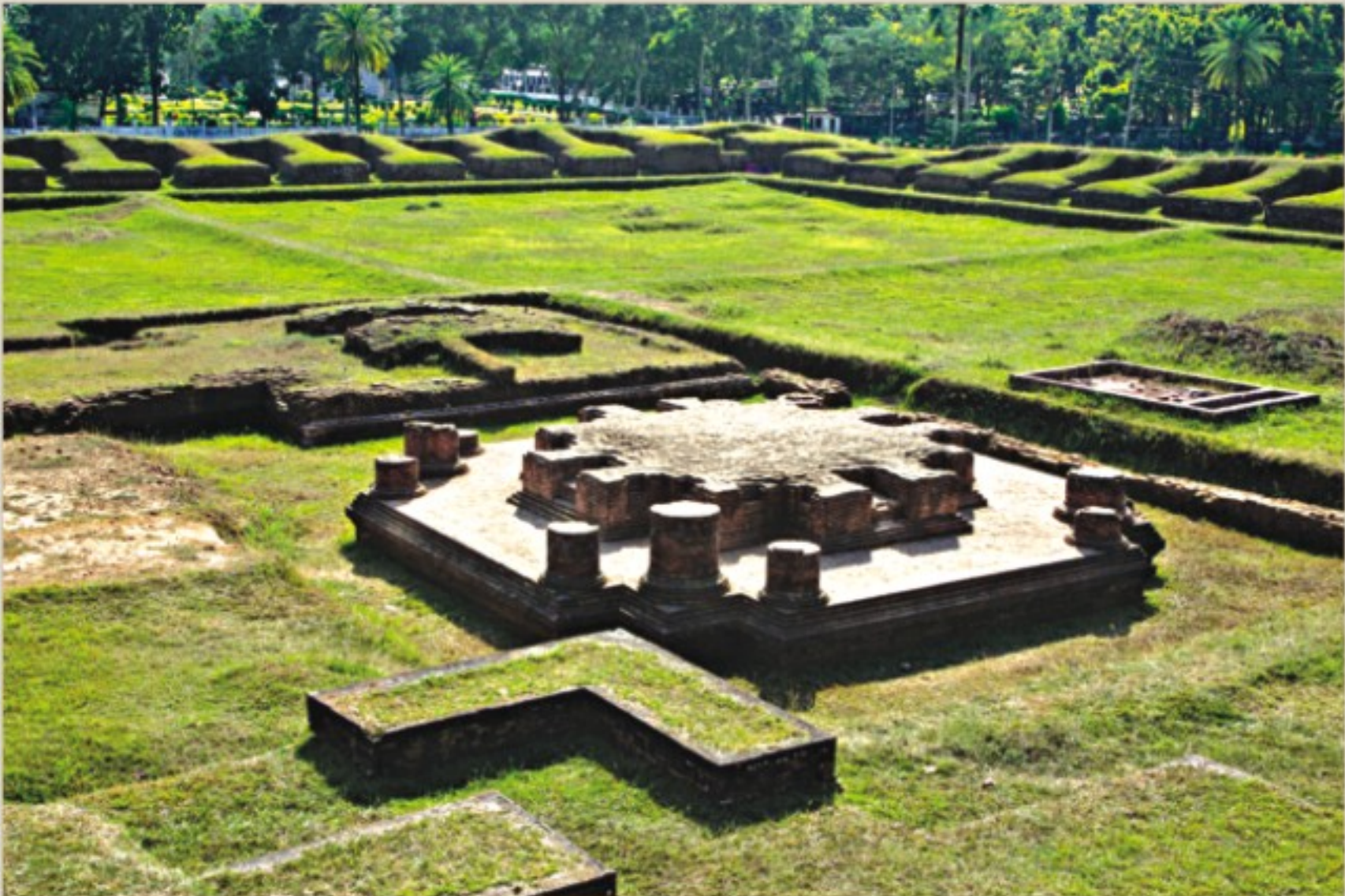
Shalban Bihar.