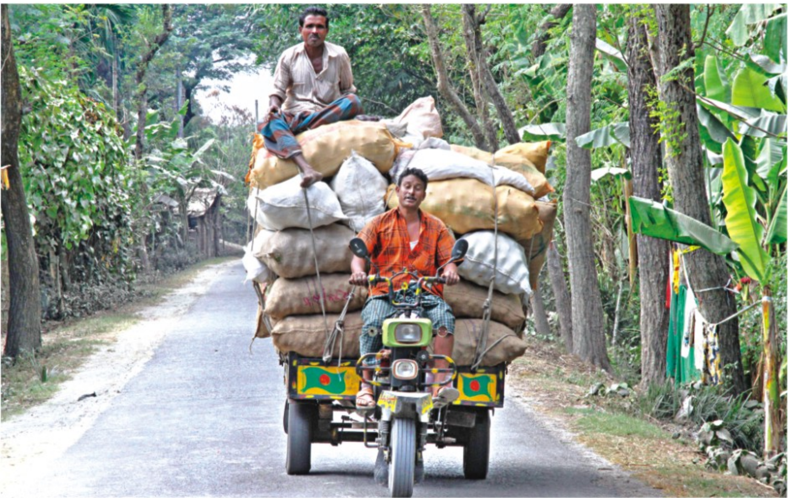
Locally made vehicles like this one, built with a water pump engine, ply the roads of Bangladesh without any papers. Though illegal, the menace of these unsafe vehicles has not been stopped. The photo was taken from Manirampur of Jessore.