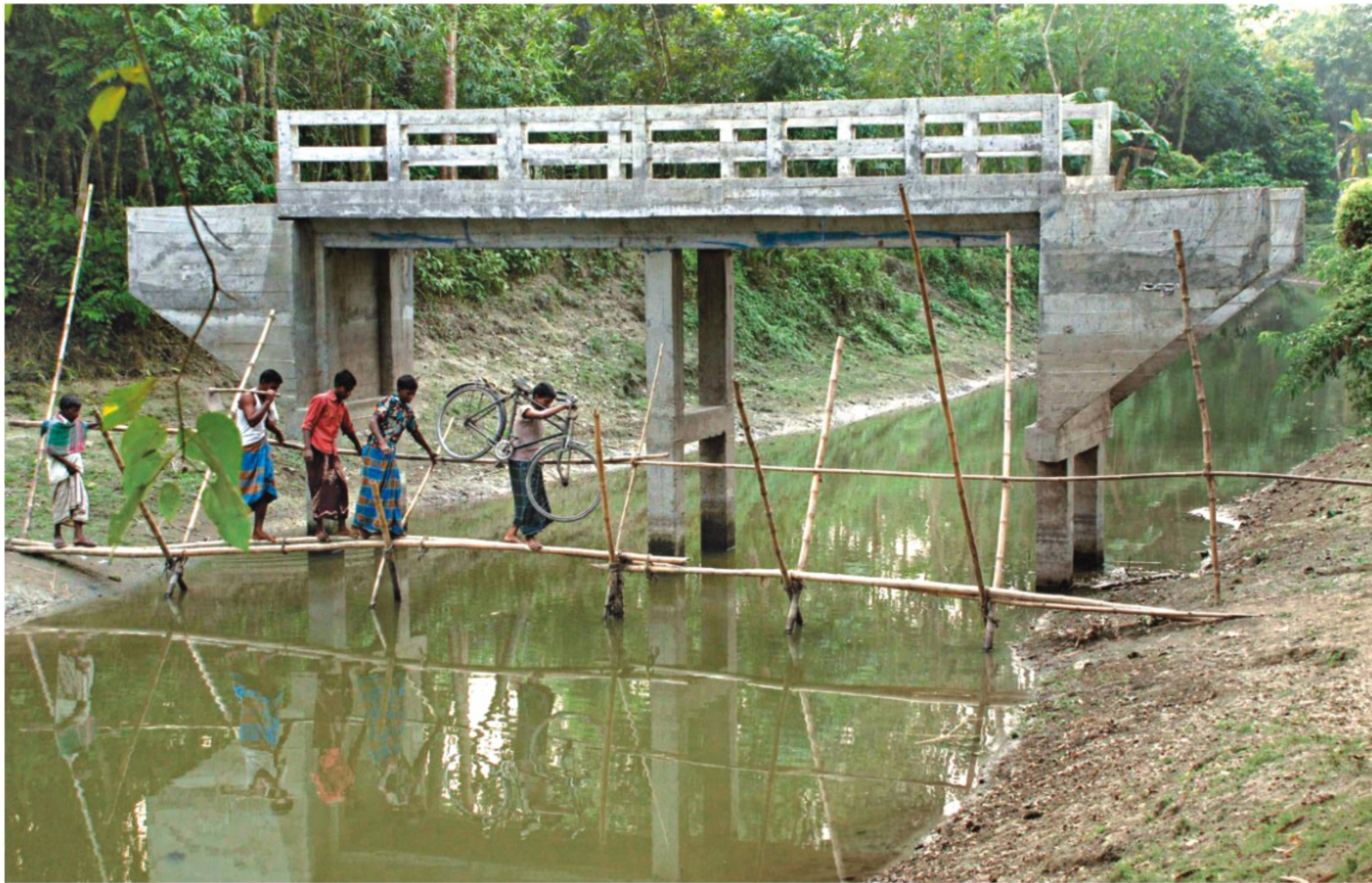
People still cross the Singrirpara canal in Sonatala of Bogra using a bamboo bridge since the bridge next to it, built eight months ago at a cost of Tk 5 lakh, does not have approach roads.