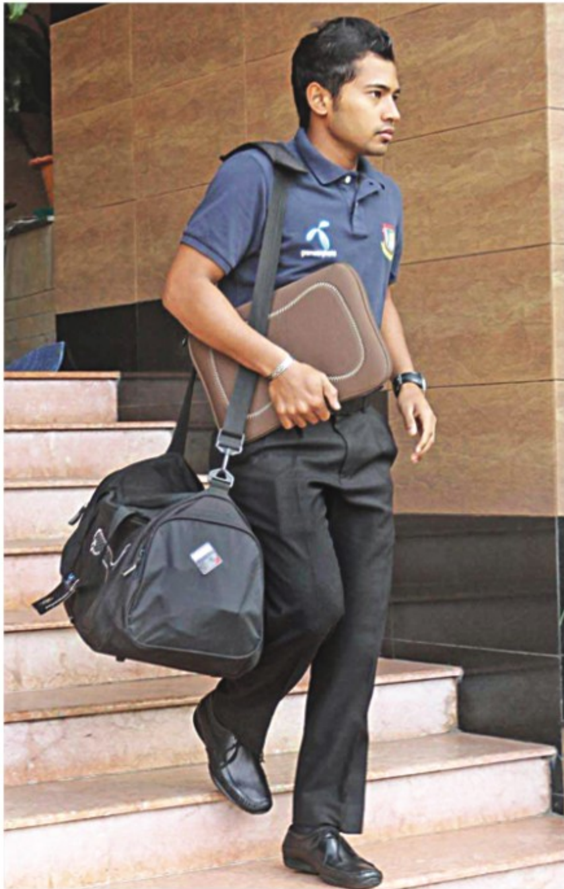
Bangladesh skipper Mushfiqur Rahim leaves the hotel in Chittagong as the team left the port city for Dhaka yesterday ahead of the second Test against Pakistan due to start in Mirpur on Saturday.