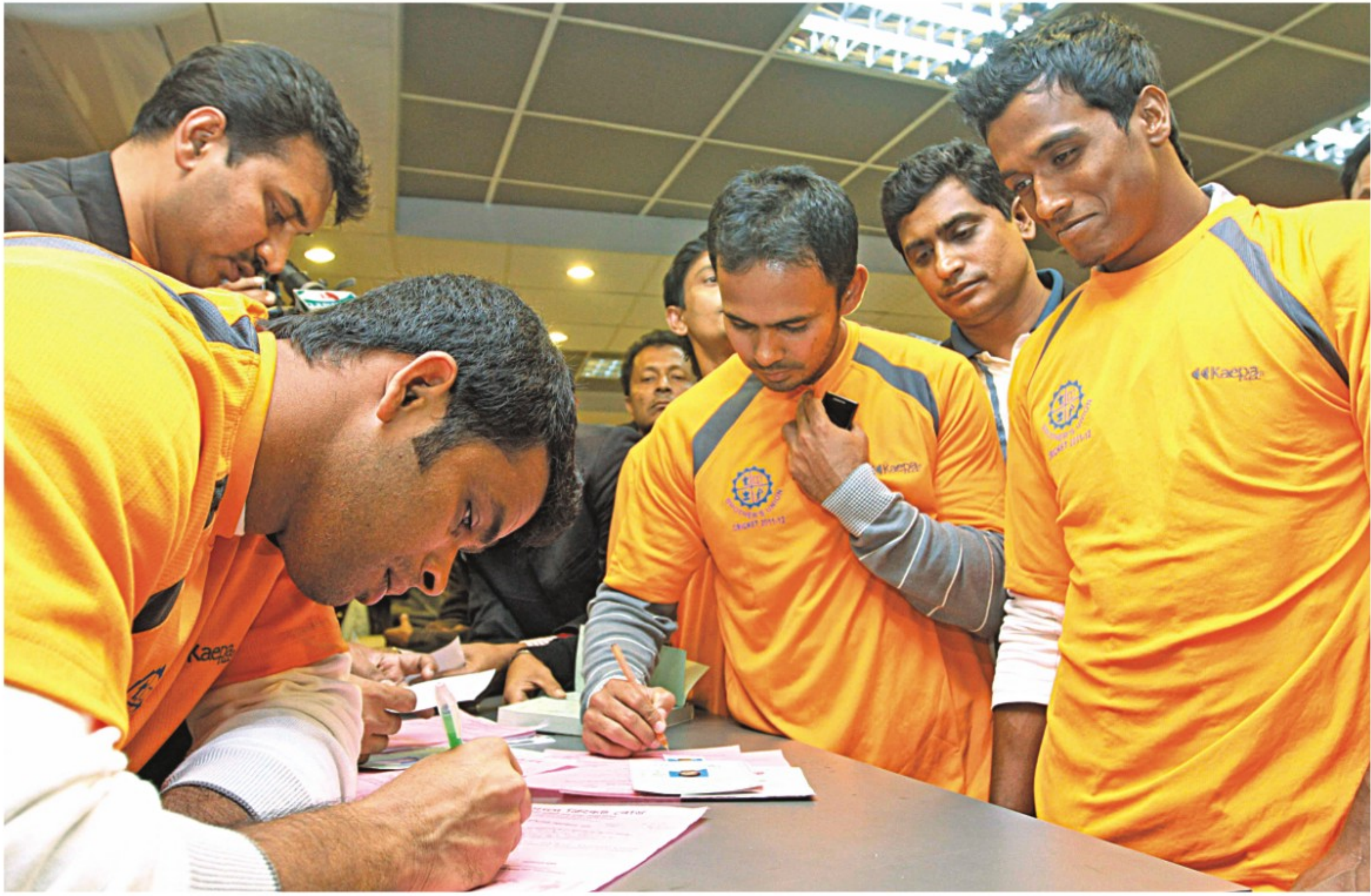
National team players Abdur Razzak (L), Nazimuddin (C) and Rubel Hossain (R) are in the process of signing contracts to join new clubs during the inter-club players' transfer for the 2011-2012 edition of the Dhaka Premier Division Cricket League at the Bangabandhu National Stadium yesterday.

Mushfiqur Rahim (captain), Mahmudullah (vice-captain), Tamim Iqbal, Shahriar Nafees, Shakib Al Hasan, Naeem Islam, Nasir Hossain, Shafiul Islam, Nazmul Hossain, Elias Sunny, Shahadat Hossain, Sohrawardi Shuvo, Robiul Islam, Nazimuddin.