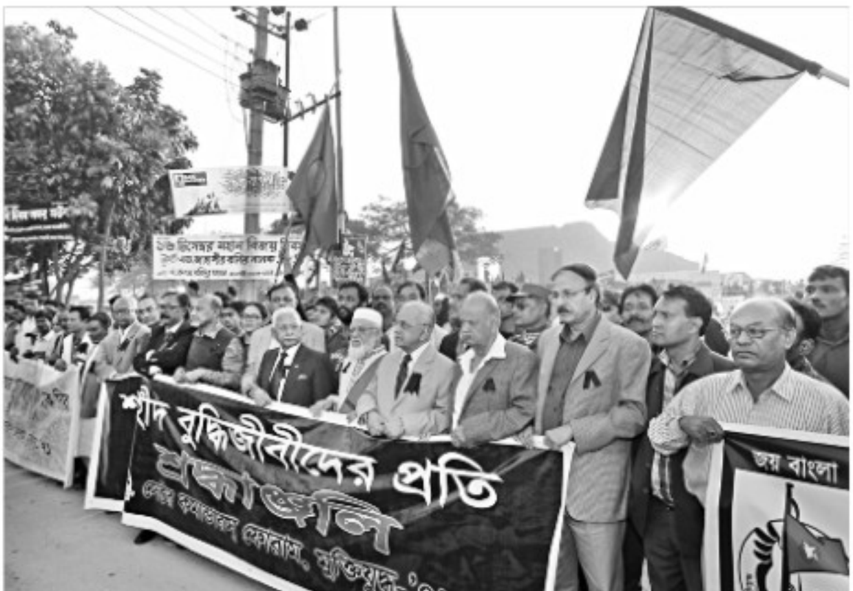
Sector Commanders Forum at Rayer Bazar mass grave