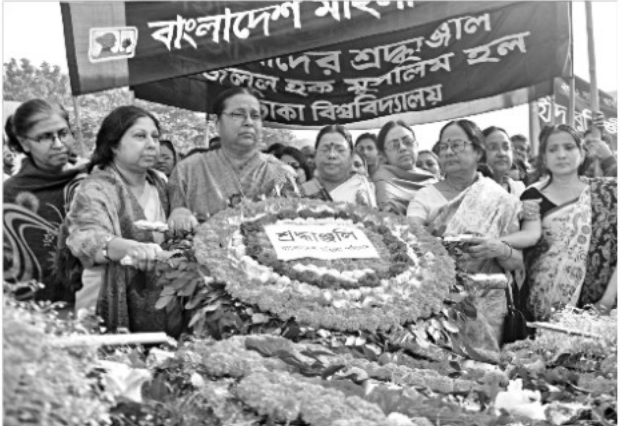
Bangladesh Mahila Parishad