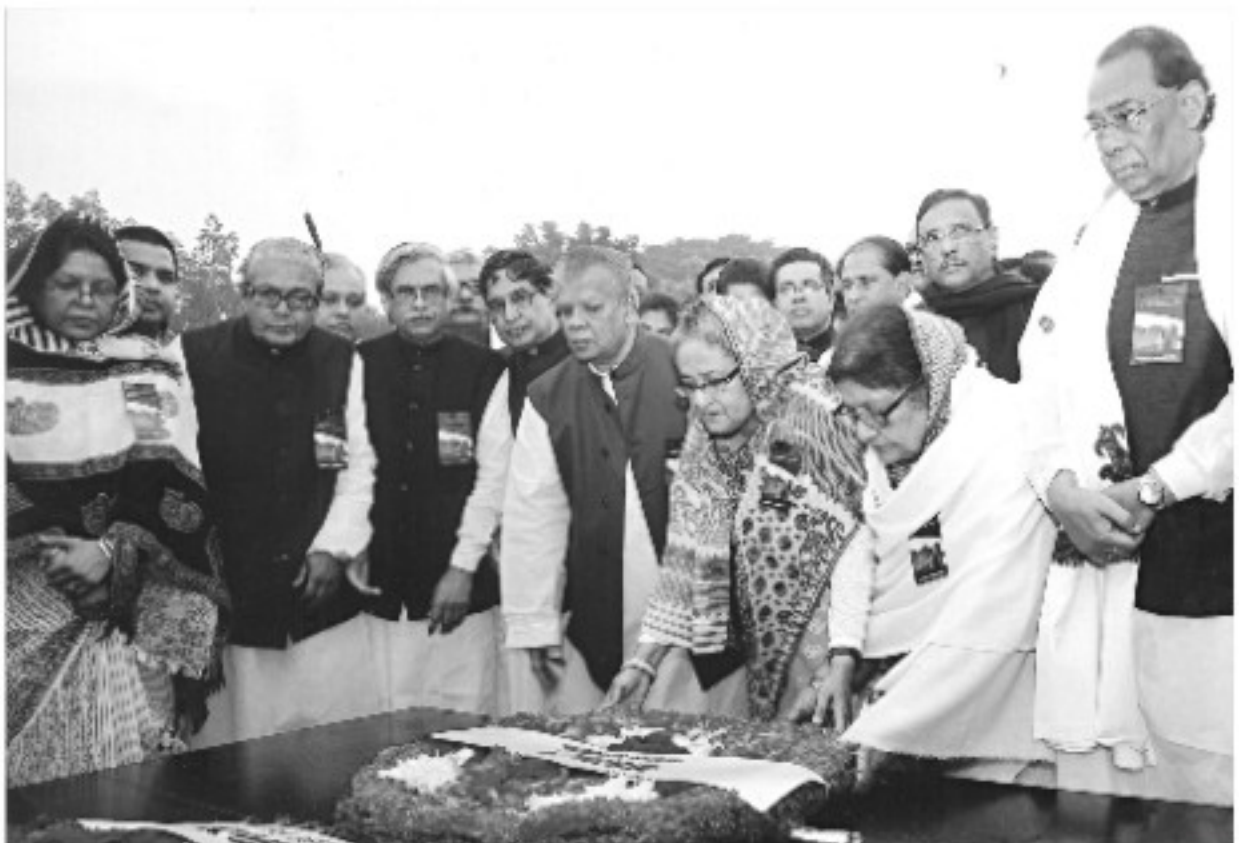
Prime Minister Sheikh Hasina along with party leaders