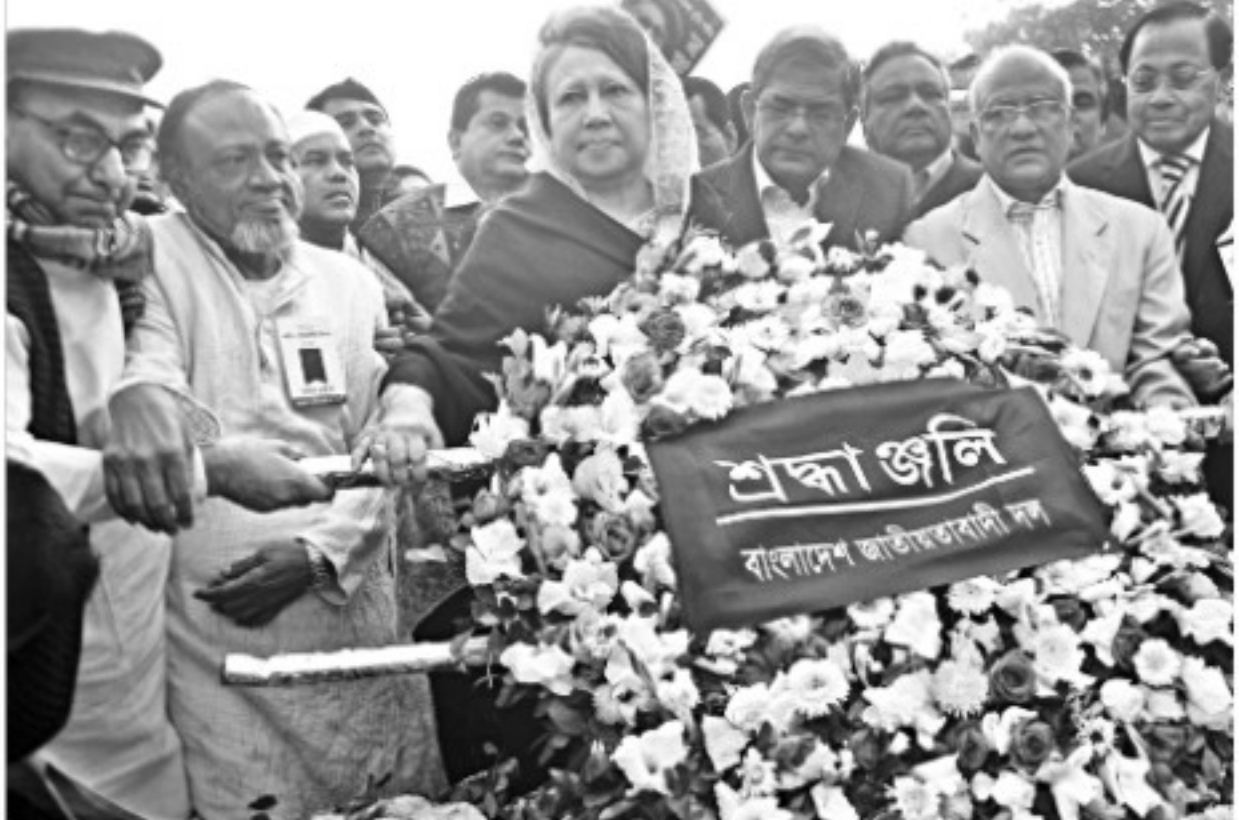
BNP Chairperson Khaleda Zia along with her party leaders