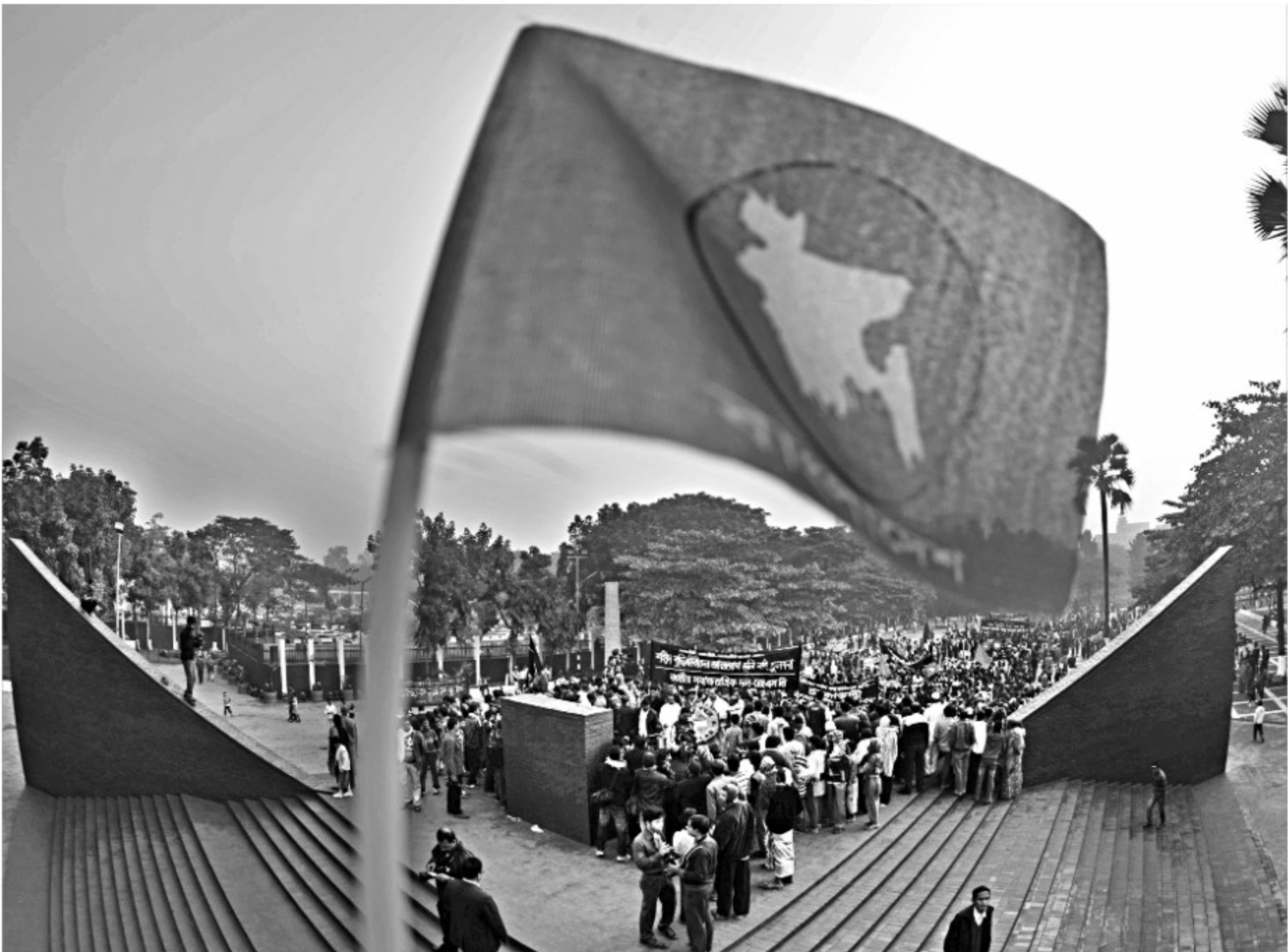
People from all walks of life at Mirpur Martyred Intellectuals Memorial