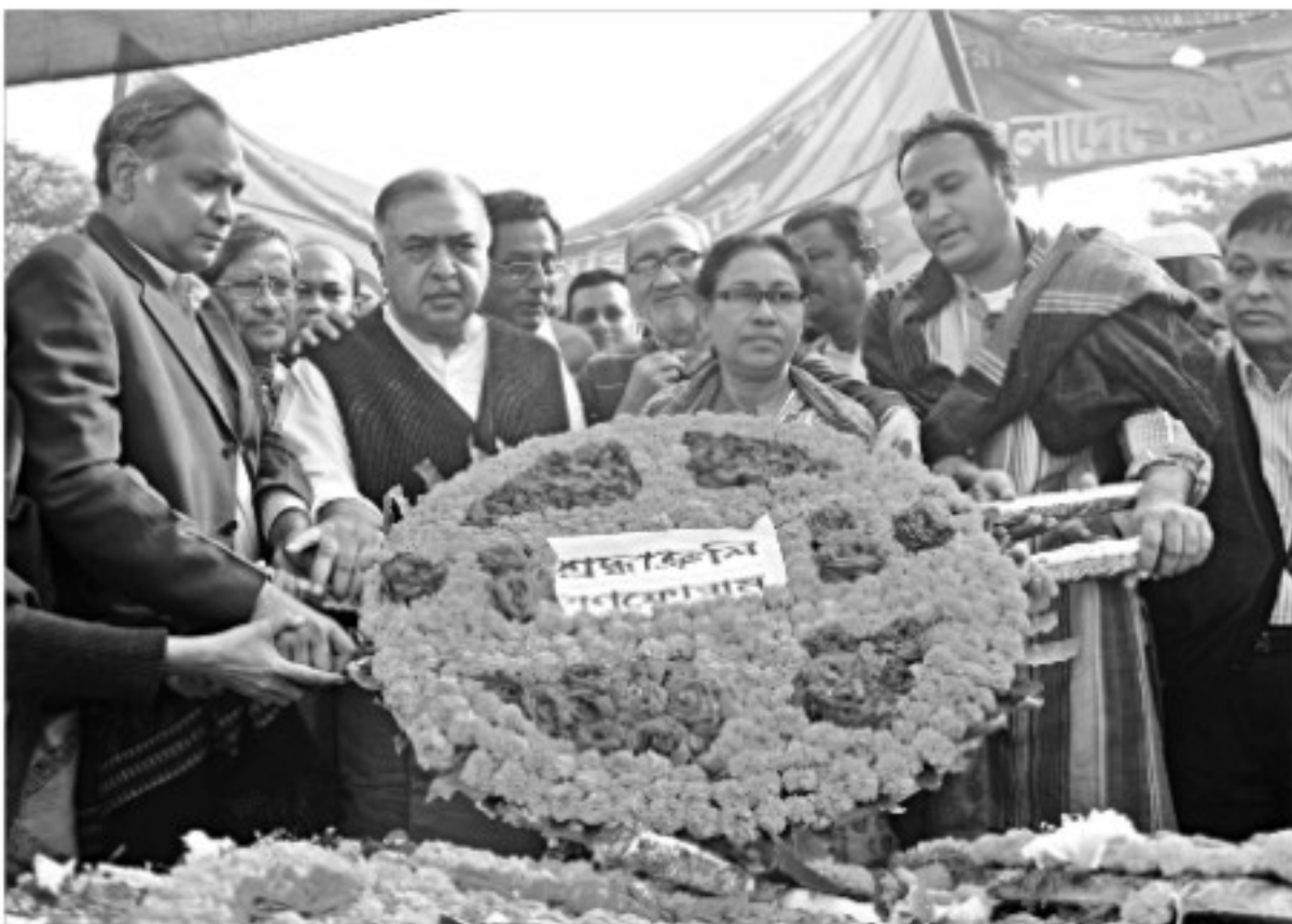
Gono Forum President Dr Kamal Hossain