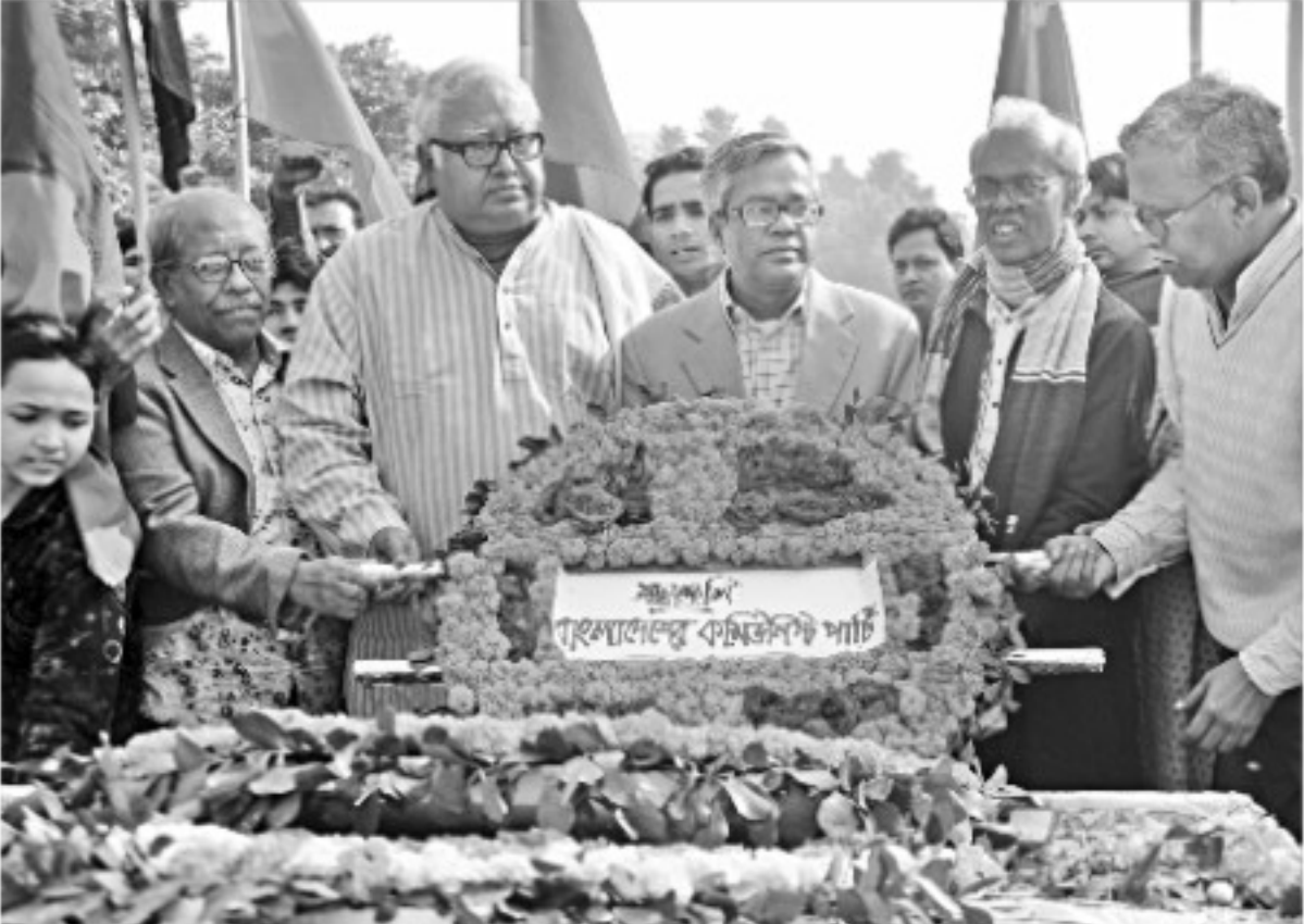
Communist Party of Bangladesh