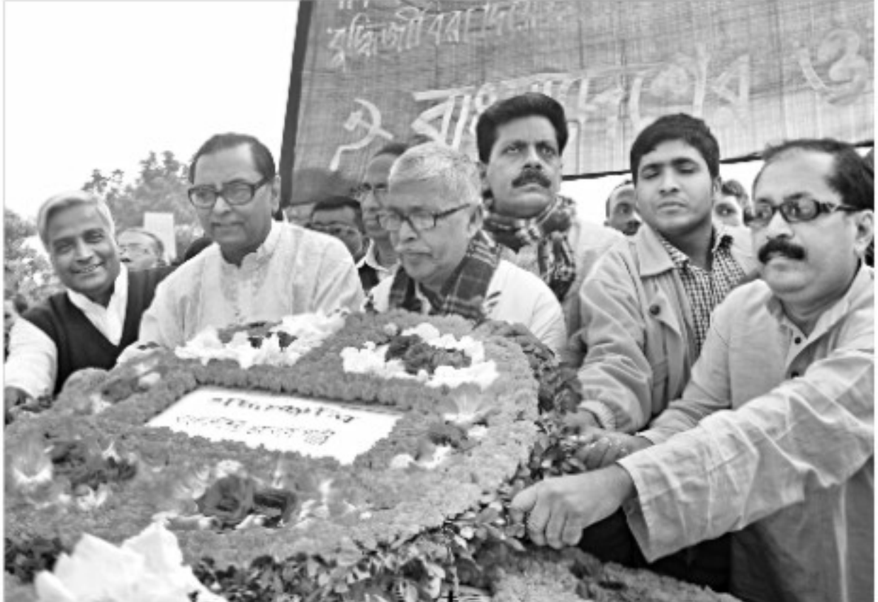
Workers Party of Bangladesh