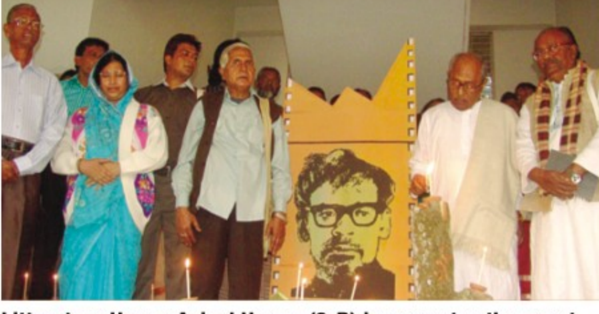
Litterateur Hasan Azizul Haque (2-R) inaugurates the event.