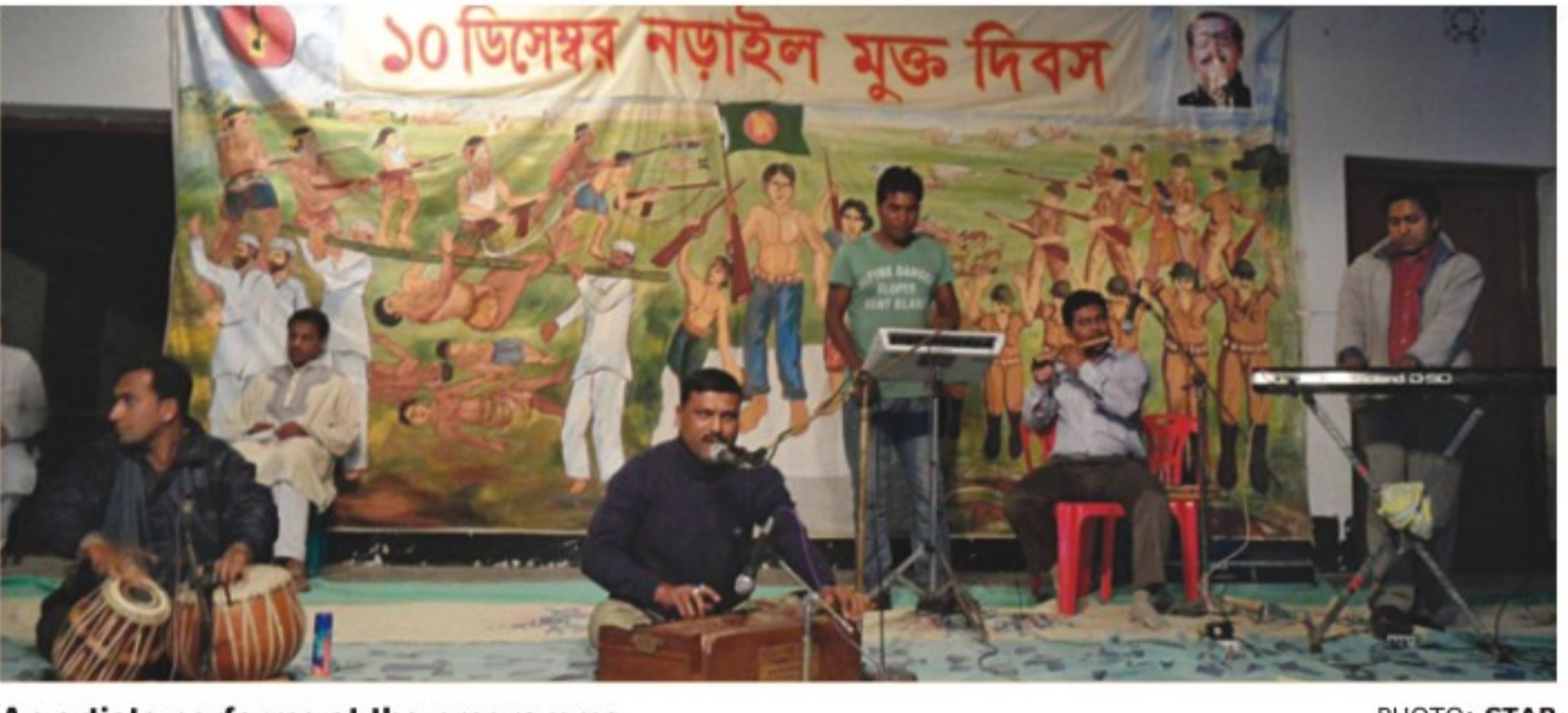
An artiste performs at the programme.

A cultural programme marking December 10 as 'Narail Mukto Dibosh' (Narail Free Day) was held at Narail Shilpakala Academy premises. Organised by Mukti Joddha Command Council's Sadar upazila unit, the programme included lathi khela, art competition and live performances. The soiree at Narail District Shilpakala Academy premises saw a large turnout. In remembrance of the Liberation War, Narail Chitra Theatre depicted the battle scenes with the freedom fighters and Pakistan occupation forces. Earlier in the morning Bangladesh Mukti Joddha Sangsad's Sadar Upazila unit, in association with the District Mukti Joddha Command Unit and other socio-cultural organisations, held special programmes. The programmes included hoisting of the National Flag, placing wreaths on the portrait of Bangabandhu and at the Shaheed Minar, bringing out a colourful rally and offering special prayers.