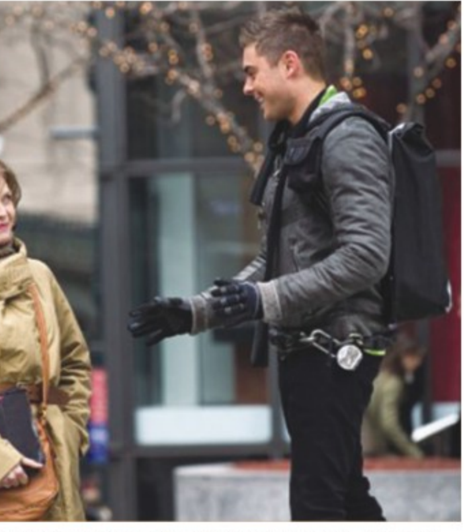
The ensemble cast of New Year's Eve includes Jon Bon Jovi, Michelle Pfeiffer and Zac Efron.

Time magazine added: "Neither nicely written, nor nicely acted nor nicely made." The Twilight Saga: Breaking Dawn, Part 1 found itself in its third place with takings of $7.9m (£5.1m). The fourth film in the vampire franchise has made around $260m (£167m) in the US so far. Disney's The Muppets took fourth place for the weekend with $7.1m (£4.5m) and British comedy animation Arthur Christmas took the fifth spot with $6.6m (£4.2m). Its total earnings in the US now stand at $33.5m (£21.5m). Next weekend sees the release of Hollywood's end-of-year blockbusters with Robert Downey Jr returning in Sherlock Holmes: A Game of Shadows and the family film Alvin and the Chipmunks: Chipwrecked. Also on the horizon are Tom Cruise's Mission Impossible: Ghost Protocol and David Fincher's adaptation of The Girl With The Dragon Tattoo.