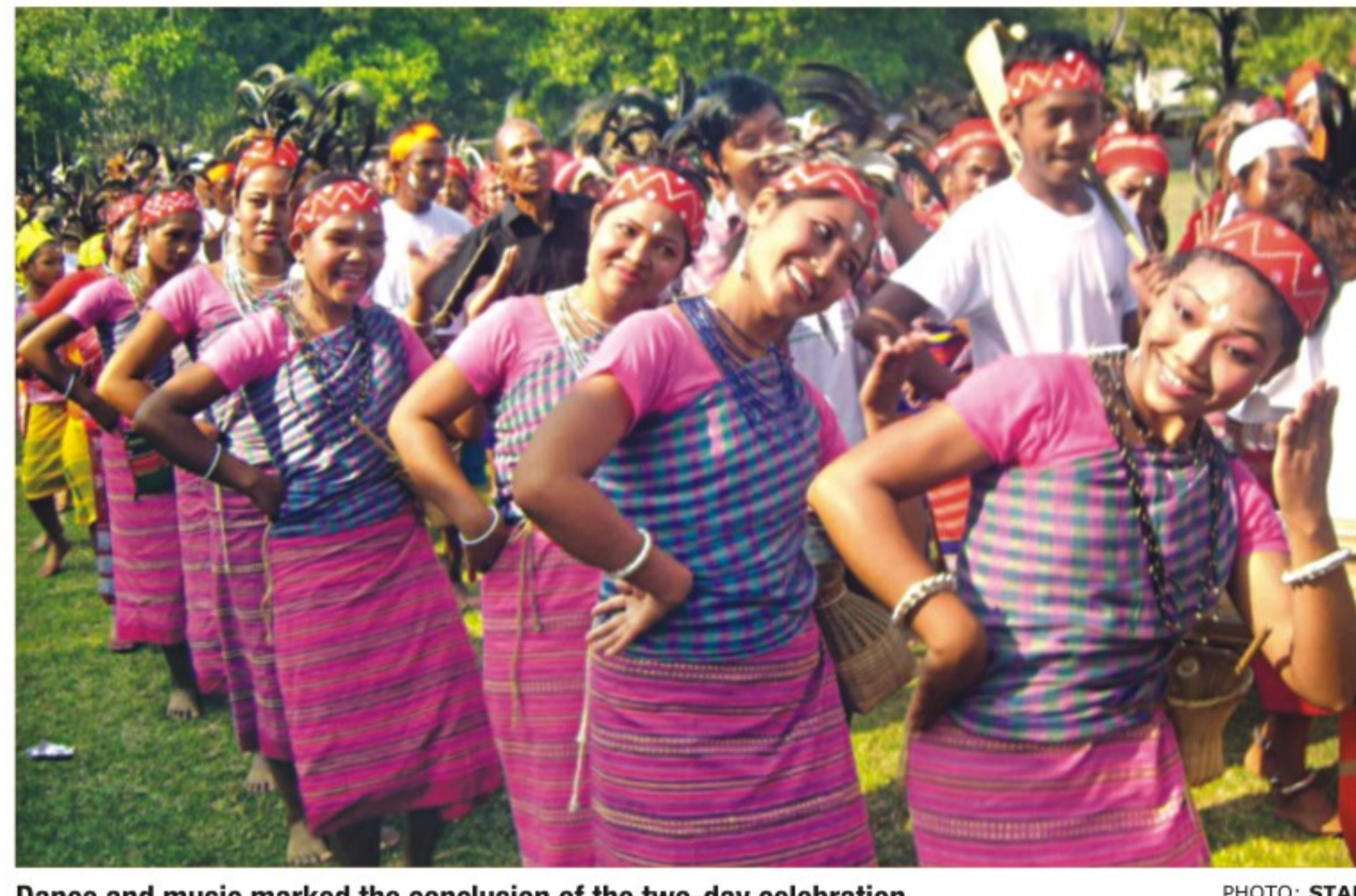
Dance and music marked the conclusion of the two-day celebration.

People of the Garo community, one of the major ethnic groups of the country, celebrated their biggest festival 'Wanna' (harvest) at Askipara, under Haluaghat upazila. On December 9, Askipara took on a very festive look as Garos of different age groups attired themselves in traditional clothes. Dance and music marked the conclusion of the two-day celebration, starting from last Thursday evening. Garo women wear traditional clothes and adorn themselves with daksharee , dakmanda , thami , taps , rekmachu , kannachil and more. Local artists performed at the cultural programmes, the most enjoyable part of the celebration featuring traditional musical instruments -- kakawa , nanglist , rangkilding , rangbong -- in choruses and dances. Cultural teams from Haluaghat and Dhubaura of Mymensingh and Madhupur of Tangail took part at the last