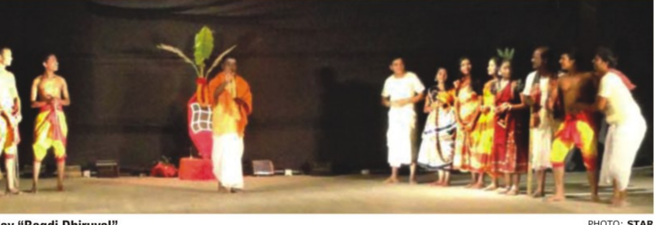
A scene from the play "Bagdi Dhuruyal".