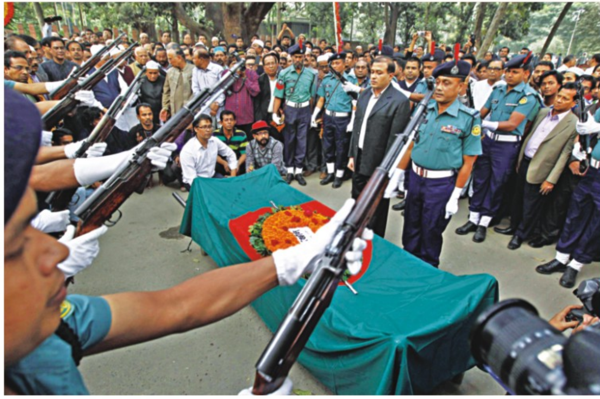
A state honour is being given to National Professor Kabir Chowdhury at Dhaka University mosque. Right, Prime Minister Sheikh Hasina offers prayer standing beside the coffin of the eminent educationist at his Naya Paltan residence yesterday. (More stories on Pages 1, 10)