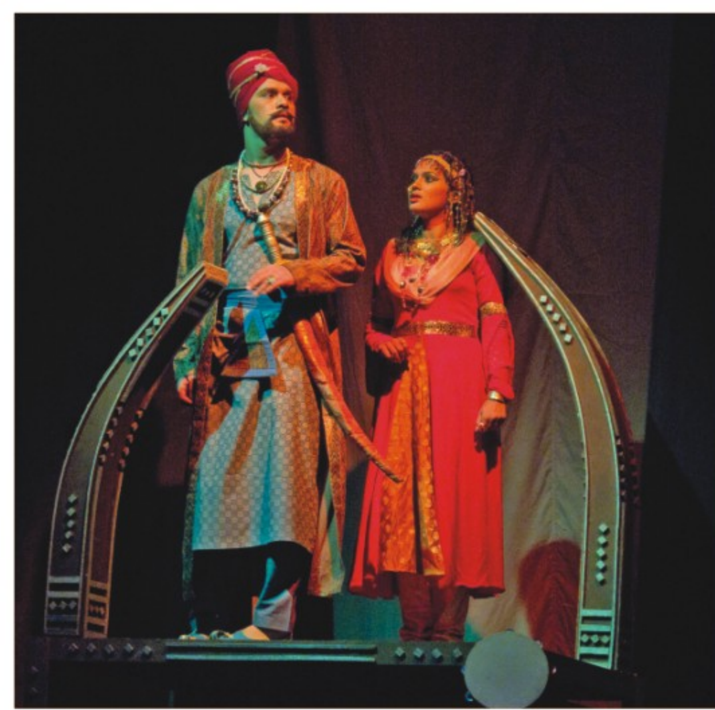
A scene from "Shesh Sanglap".

Though BGTFF has elaborate plans for developing theatre at grassroots level, it fails to execute them -- often because of lack of funds. The budget allocated by the Government is not sufficient, according to him. Sometimes local authorities' hostile attitude to theatre