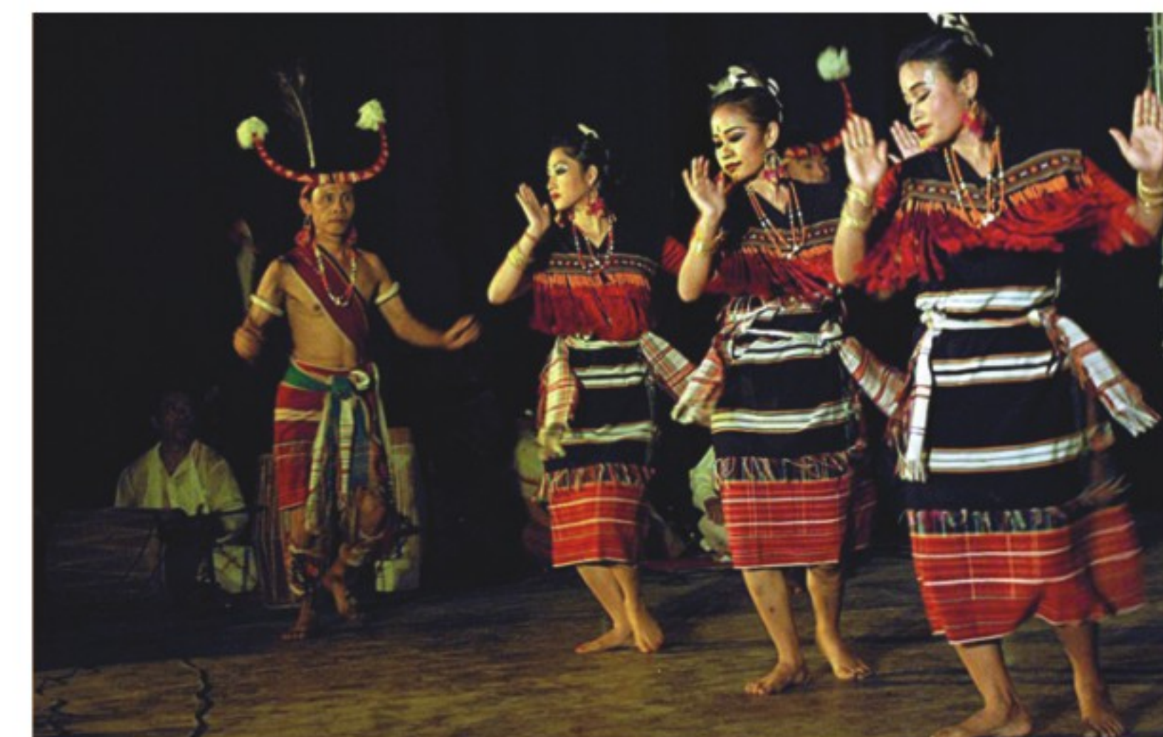
Artistes dance at the programme.