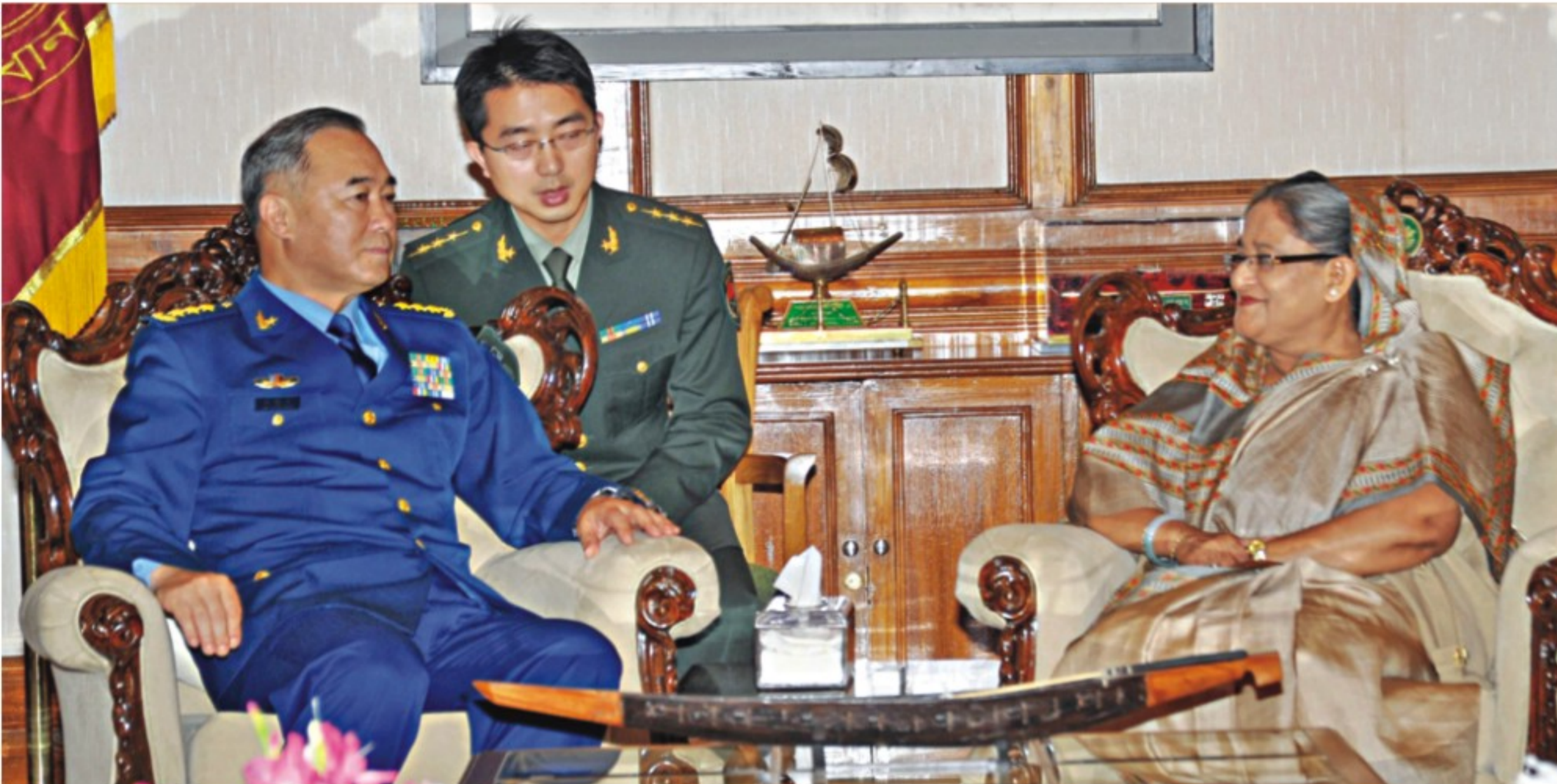
Deputy Chief of the General Staff of China Ma Xiaotian calls on Prime Minister Sheikh Hasina at her official residence Gono Bhaban in the city yesterday.

Prothoma, Dhaka : Aziz Supper Market, Shahbagh, Dhaka 1000, Ph: (02) 9664825 Prothoma, Chittagong : Sanmar Spring Garden, Cheraghi Pahar Mor, Chittagong 4000 Ph: (031) 616165. E-mail : prothoma@prothoma-alo.info The Bookworm : 'Twin Peaks' Complex, Old Airport, Tejgaon, Dhaka, Tel: 9120387 Omni Books : Genetic Plaza (Level 3), H 16, Rd 16 (new), Dhanmondi, Dhaka, Tel: 8121472 Words 'n Pages : House: S W (B) 7, Road: 7, Gulshan-1, Dhaka 1212, Tel: 9890832 Distributors : Ajkal, Uttaran, Suchayani, Banglabazar, Dhaka