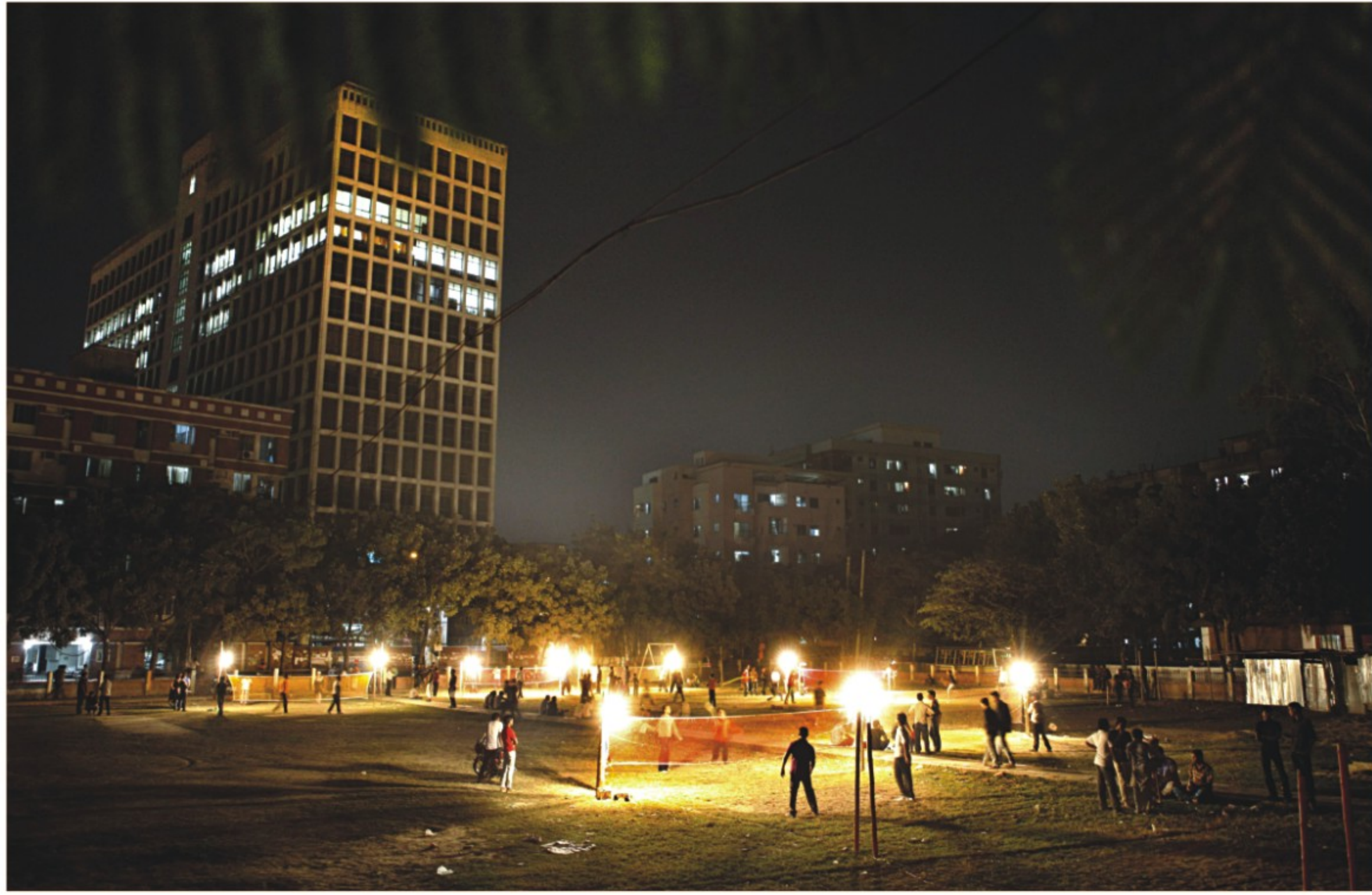
People, mostly youths, play badminton on Shyamoli Shishu Park ground in the evening, lighting up at least 12 badminton courts. Most of the lights are, however, connected to power lines illegally; thus the taxpayers are actually paying for their sporting activities.