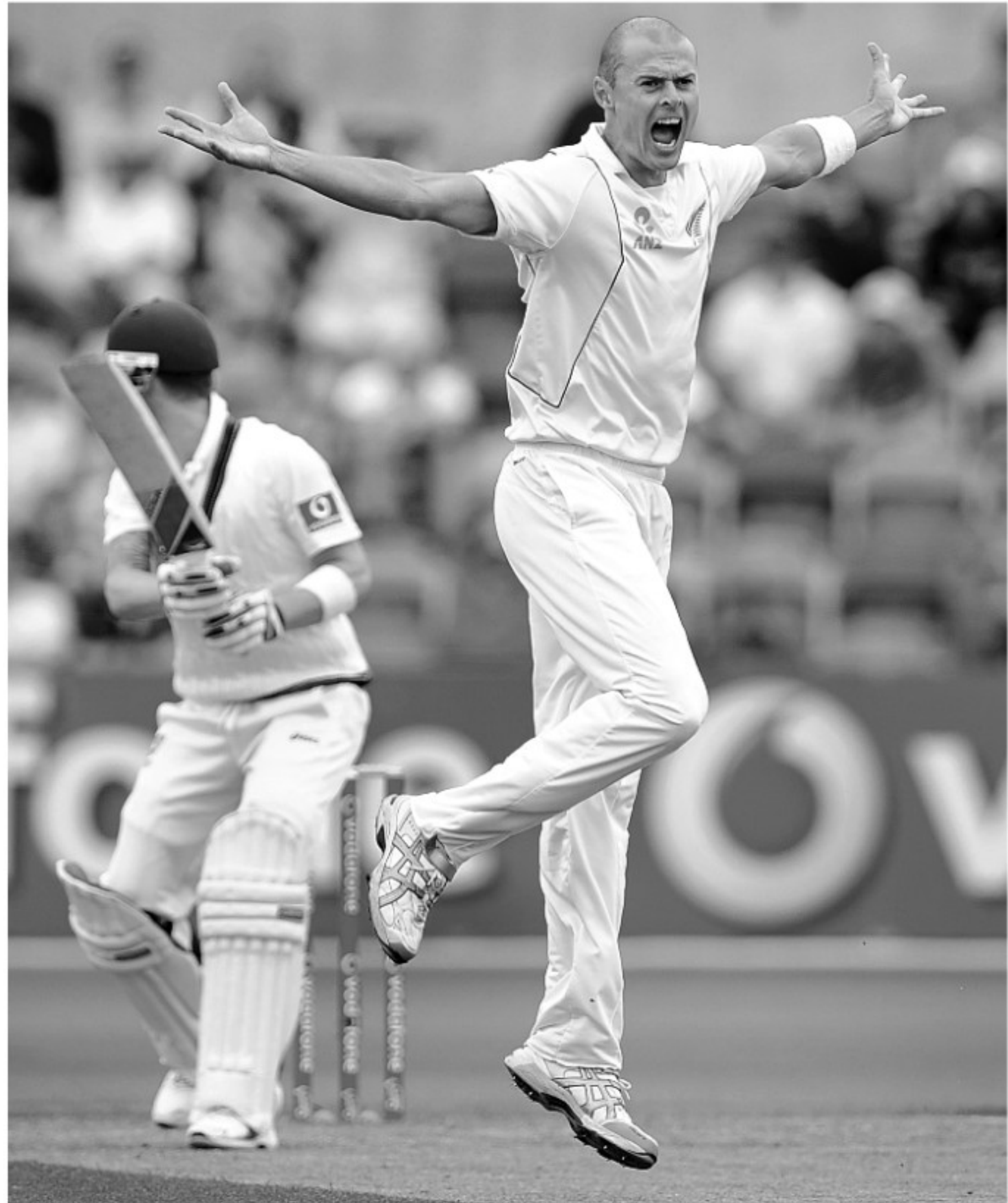
New Zealand paceman Chris Martin appeals for a leg-before decision against Australia captain Michael Clarke during the second Test at the Bellerive Oval in Hobart yesterday. Martin took three wickets on his birthday.