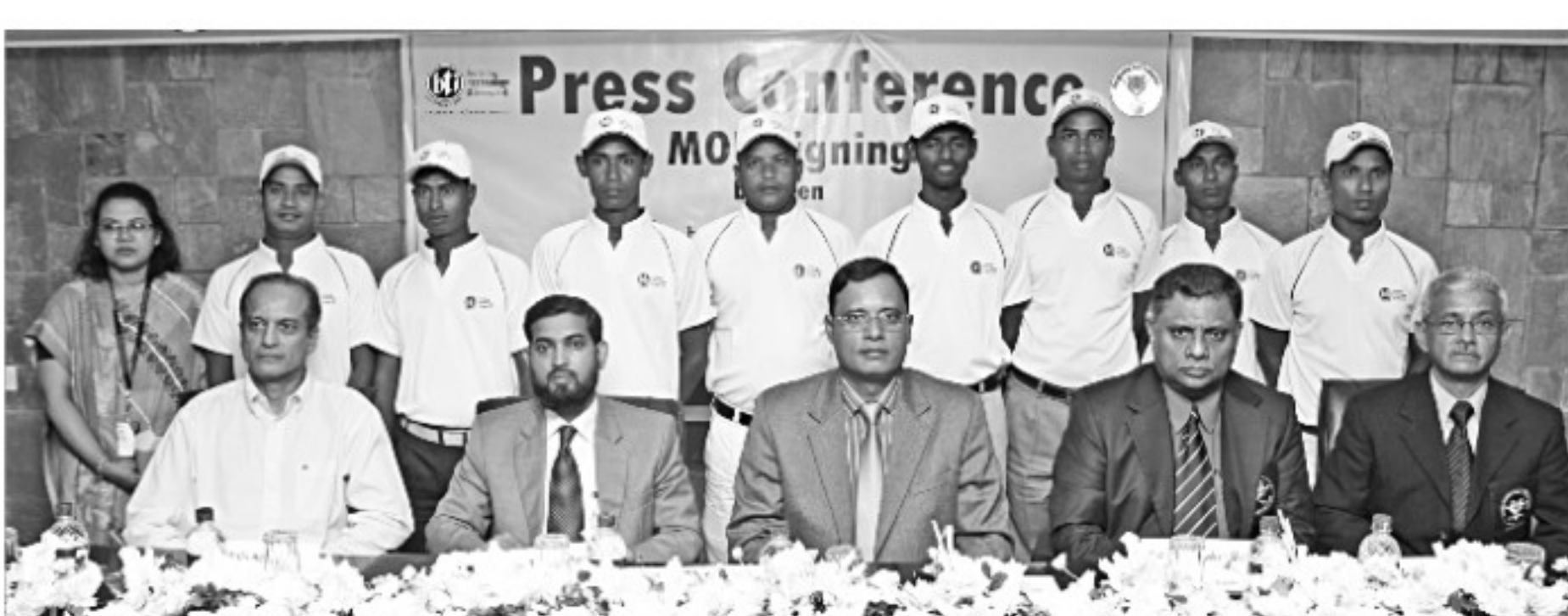
Officials of Building Technology and Ideas Limited (BTI) pose for a photo after signing a Memorandum of Understanding with the Bangladesh Golf Federation under which it will work closely with the BGF to develop the country's golfers.