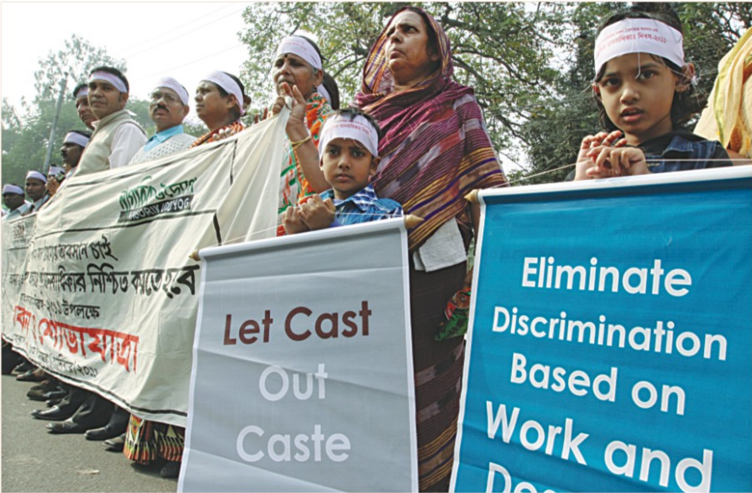
Bangladesh Dalit and Banchito Jonogosthi Odhikar Andolon forms a human chain in front of National Museum in the city yesterday demanding an end to social discrimination.

They are asked to send filled-up Preference and SIF forms through online at www.univdhaka.edu .