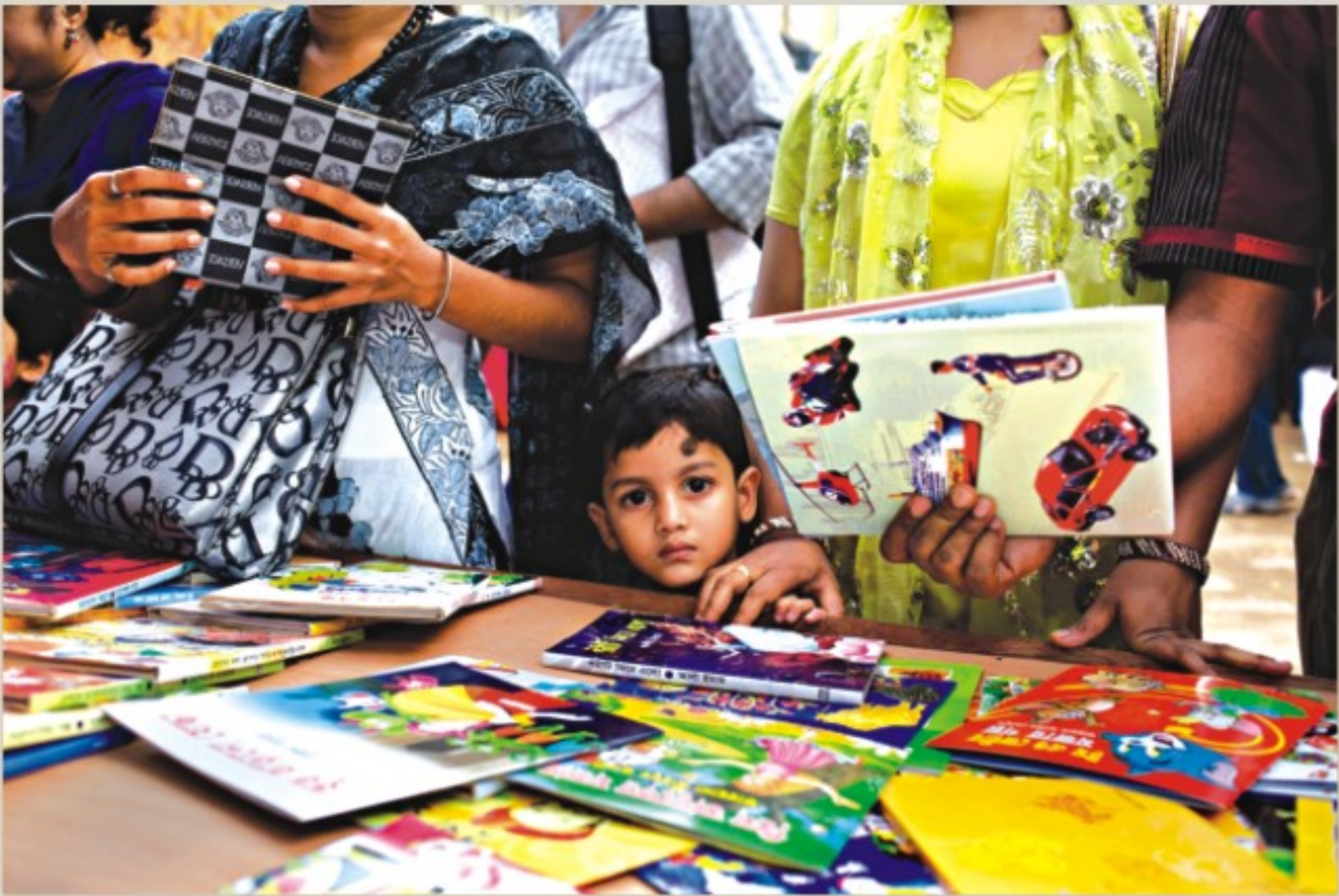
End of Paper Books?