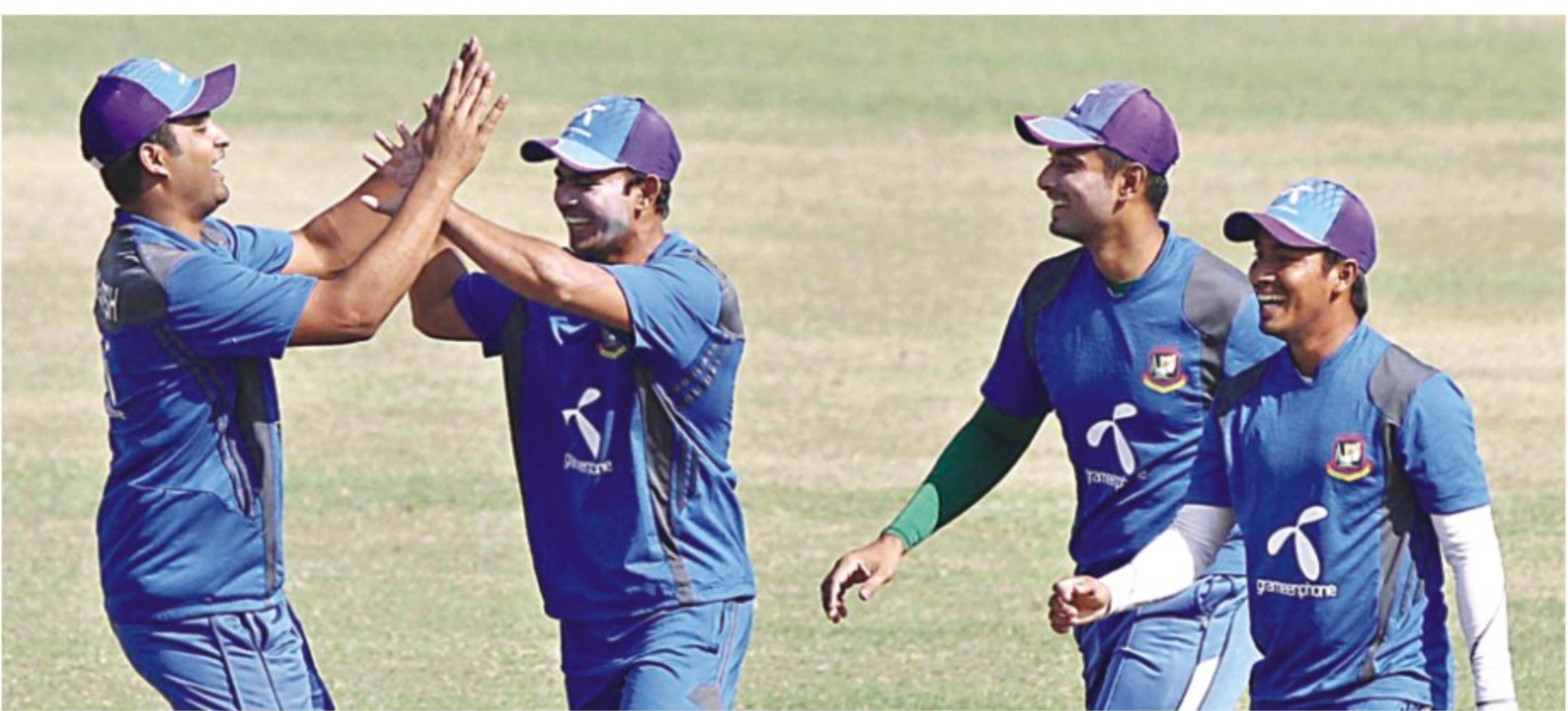
WILL THE SMILE LAST LONG? Members of the Bangladesh cricket team train happily at the Zohur Ahmed Chowdhury Stadium in Chittagong yesterday ahead of the first Test against Pakistan that starts here today.