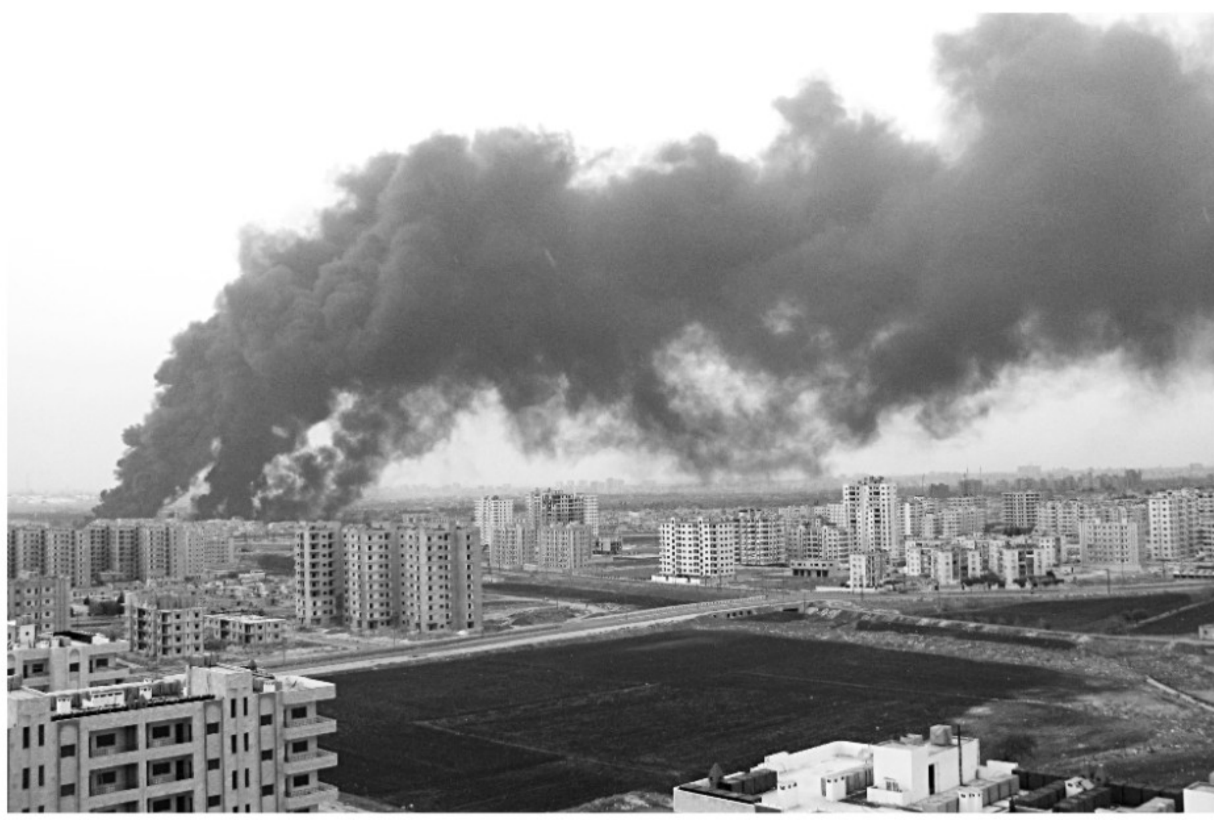
A picture released by the official Syrian Arab News Agency shows a thick plume of smoke rising above an oil refinery, situated to the west of the flashpoint city of Homs yesterday. Armed "terrorists" have blown up an oil pipeline west of the flashpoint Syrian city of Homs, state media reported, but an anti-regime group said the government was behind the blast.

The LCC, which organises anti-regime protests on the ground in Syria, urged citizens to begin the action on Sunday -- the first day of the working week in Syria -- starting with sit-ins at work and the closure of shops and universities, before the shutdown of transportation networks and a general public sector strike.