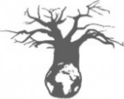
COP17/CMP7 UNITED NATIONS CLIMATE CHANGE CONFERENCE 2011 DURBAN, SOUTH AFRICA

The EU is pushing for a global deal in 2015