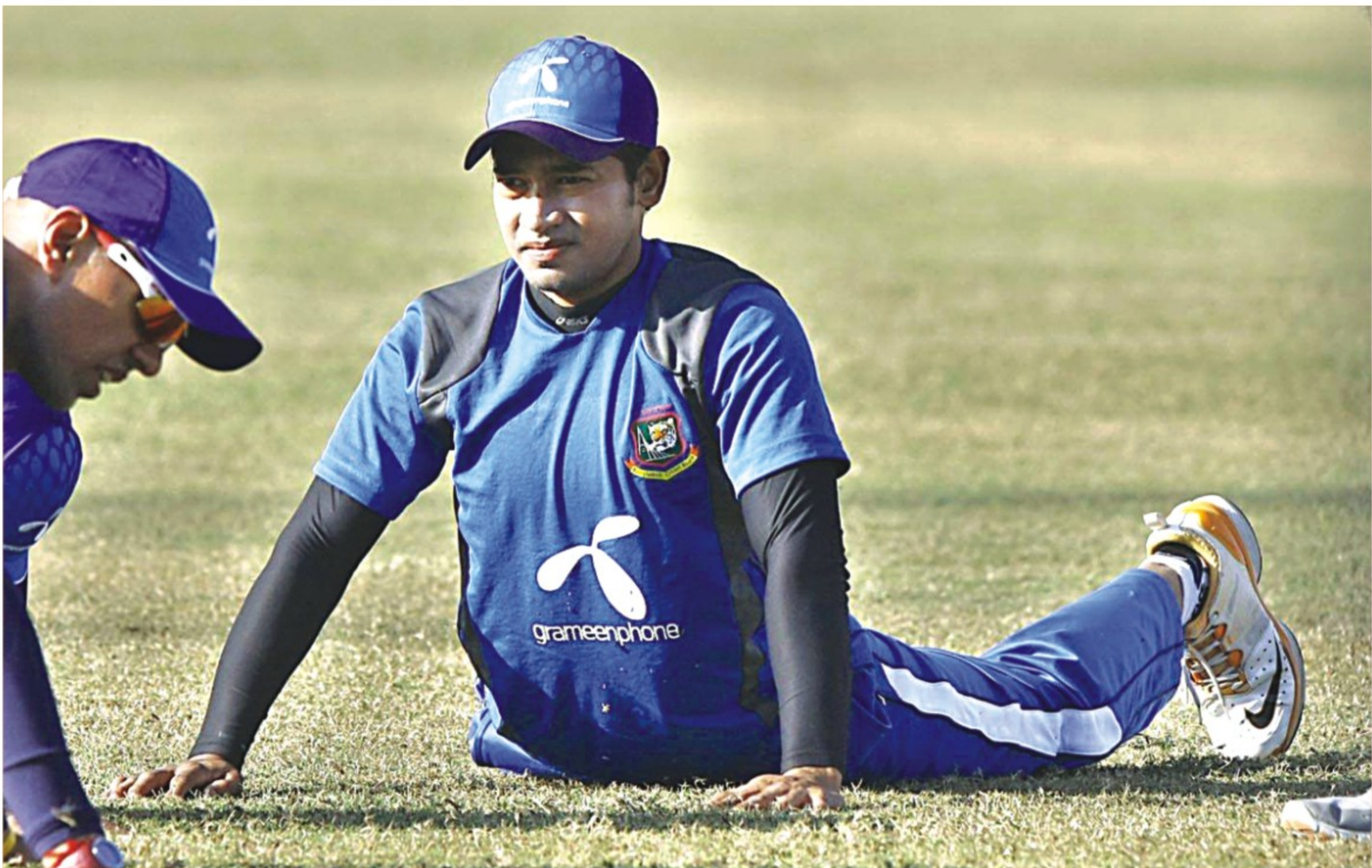
NEED TO PRACTISE HARDER: Bangladesh skipper Mushfiqur Rahim stretches during practice at the Zohur Ahmed Chowdhury Stadium in Chittagong yesterday.