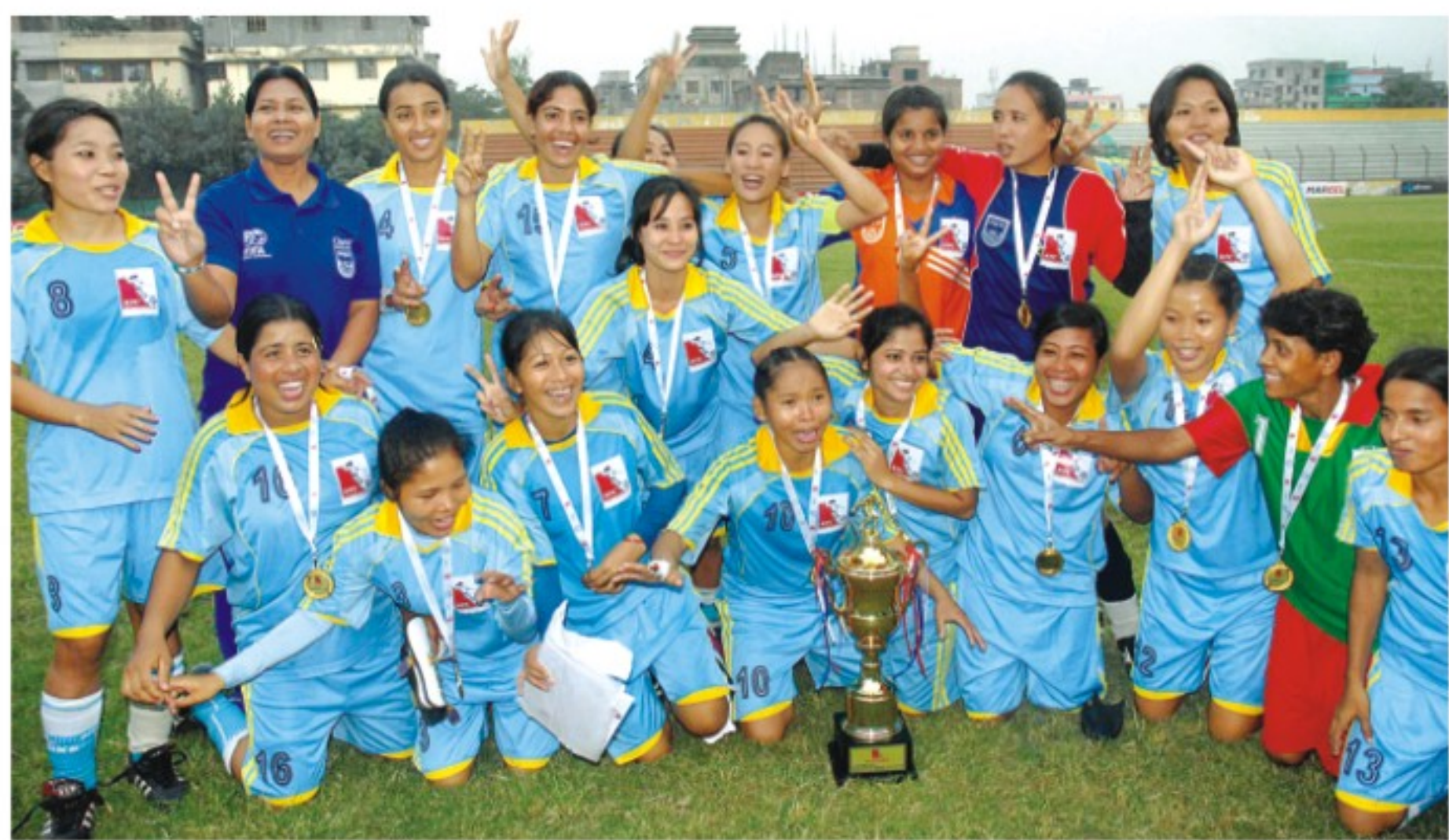
Bangladesh Ansar and VDP players celebrate with the winners' trophy of the KFC Women's Super League after defeating Sathkhira 2-0 in the final at the Birshreshtha Shaheed Mostafa Kamal Stadium in Kamalapur yesterday.