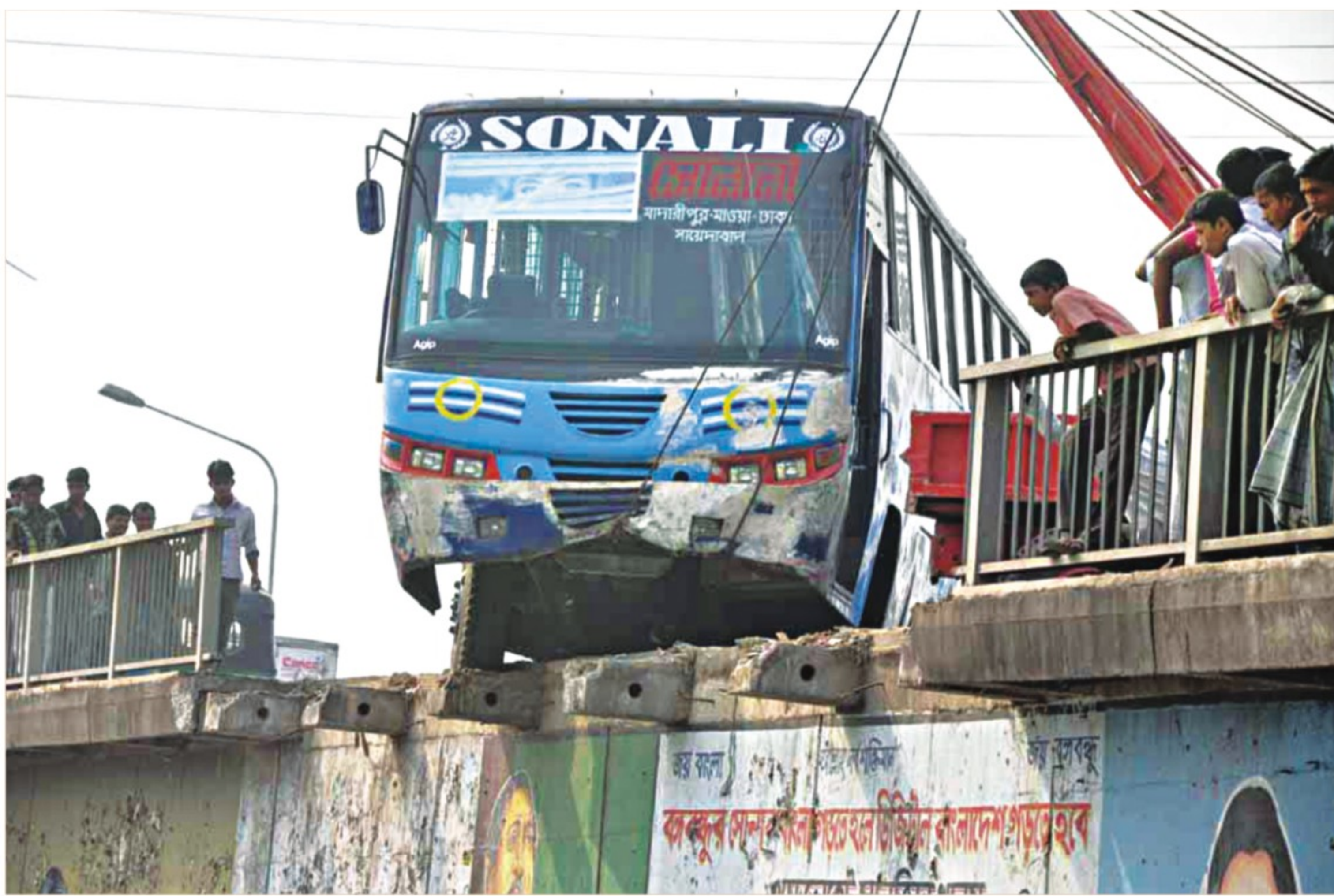
This bus plying on Dhaka-Madaripur route miraculously managed to come to a stop right on the edge of an extended part of Buriganga Bridge-1 after ramming and dislodging a portion of the bridge railing yesterday.

Cultural Programme Transparency International Bangladesh will hold a cultural programme.