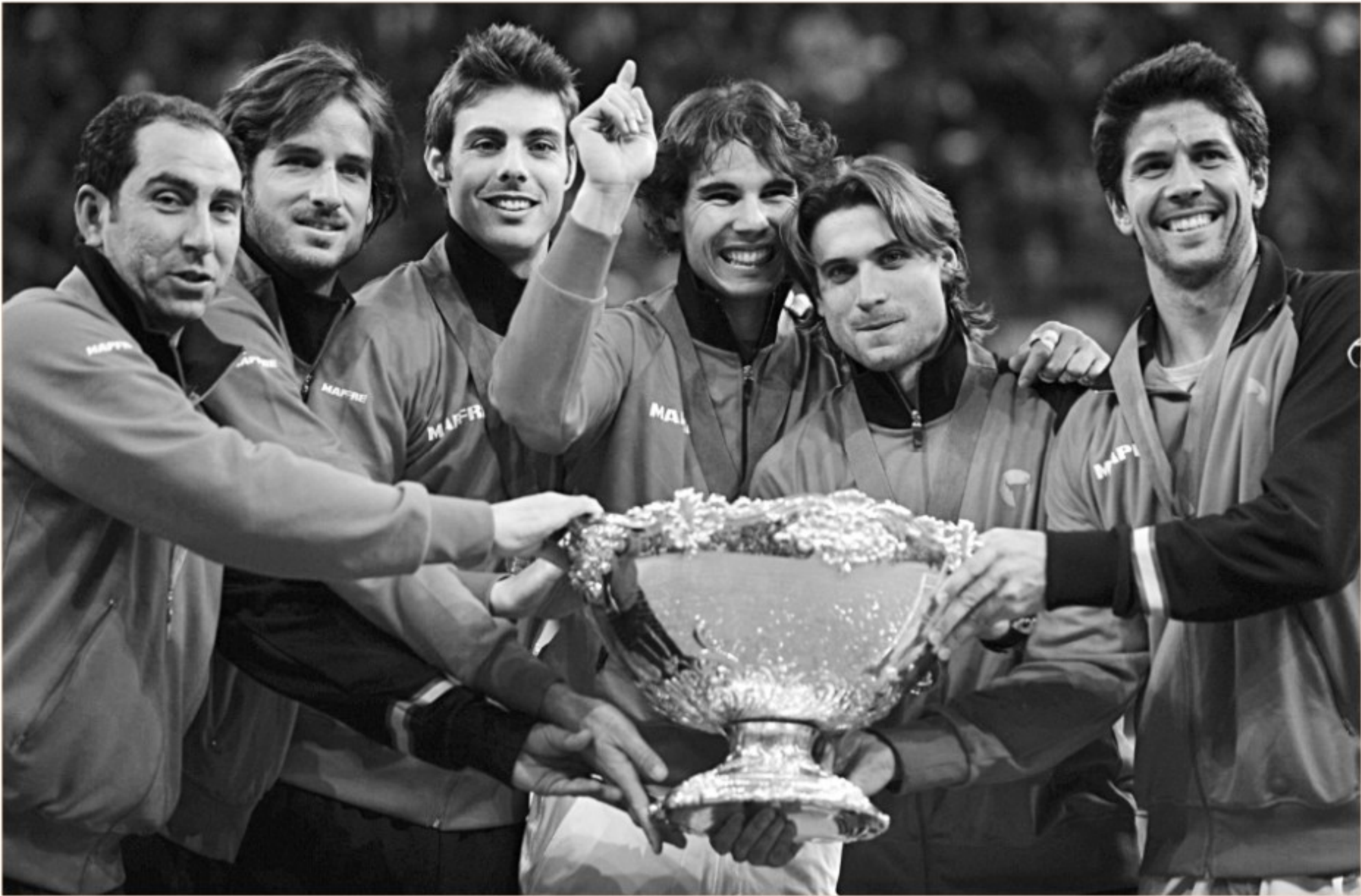
Rafael Nadal (C) and his Spain teammates celebrate with the Davis Cup after beating Argentina at La Cartuja Olympic Stadium in Sevilla on Sunday.