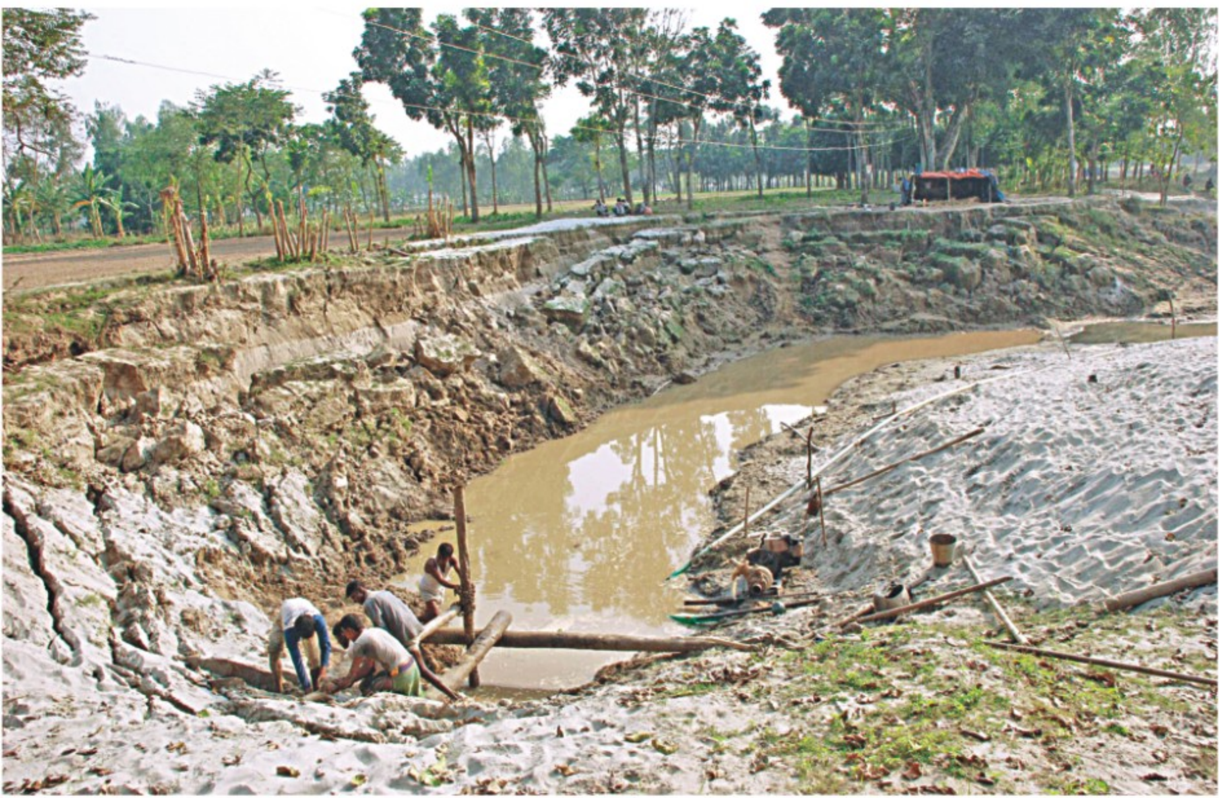
Widespread sand lifting with the help of shallow power pump machines causes subsidence of agricultural land at Amtali in Fulbari Uttarpara on the outskirts of Bogra town, like several other places in the area. Occasional action against the perpetrators has proved too ineffective to check the unscrupulous act.