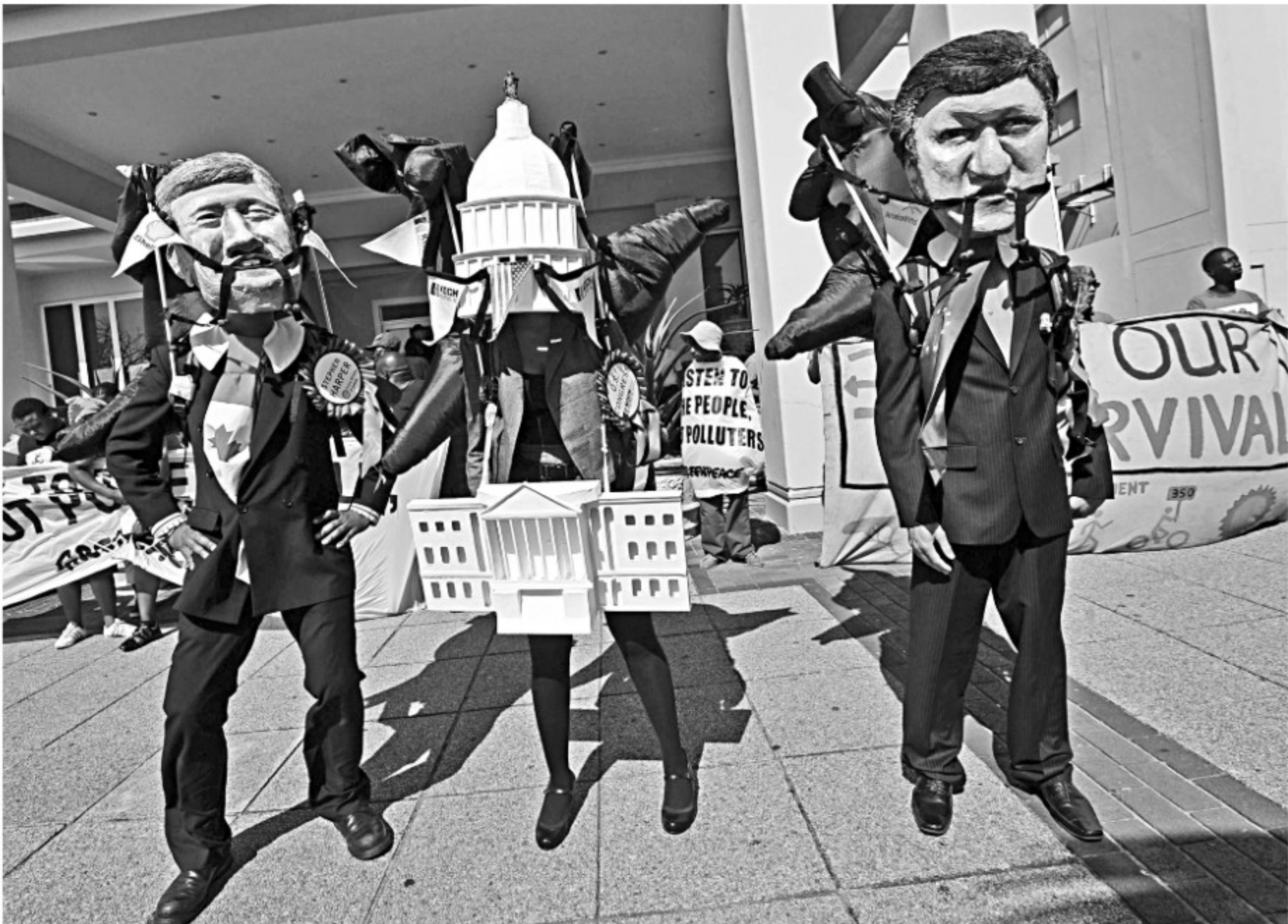
Greenpeace activists and supporters along with other non-governmental organizations protest at the Global Business Day conference in Durban yesterday. Six activists were detained as they tried to hang a banner reading "Listen to the People, not the Polluters" at a Durban hotel.

US President Barack Obama called Pakistan's President Asif Ali Zardari Sunday to express his regrets over the "tragic loss", saying the casualties were not intentional, but Islamabad remained unmoved.