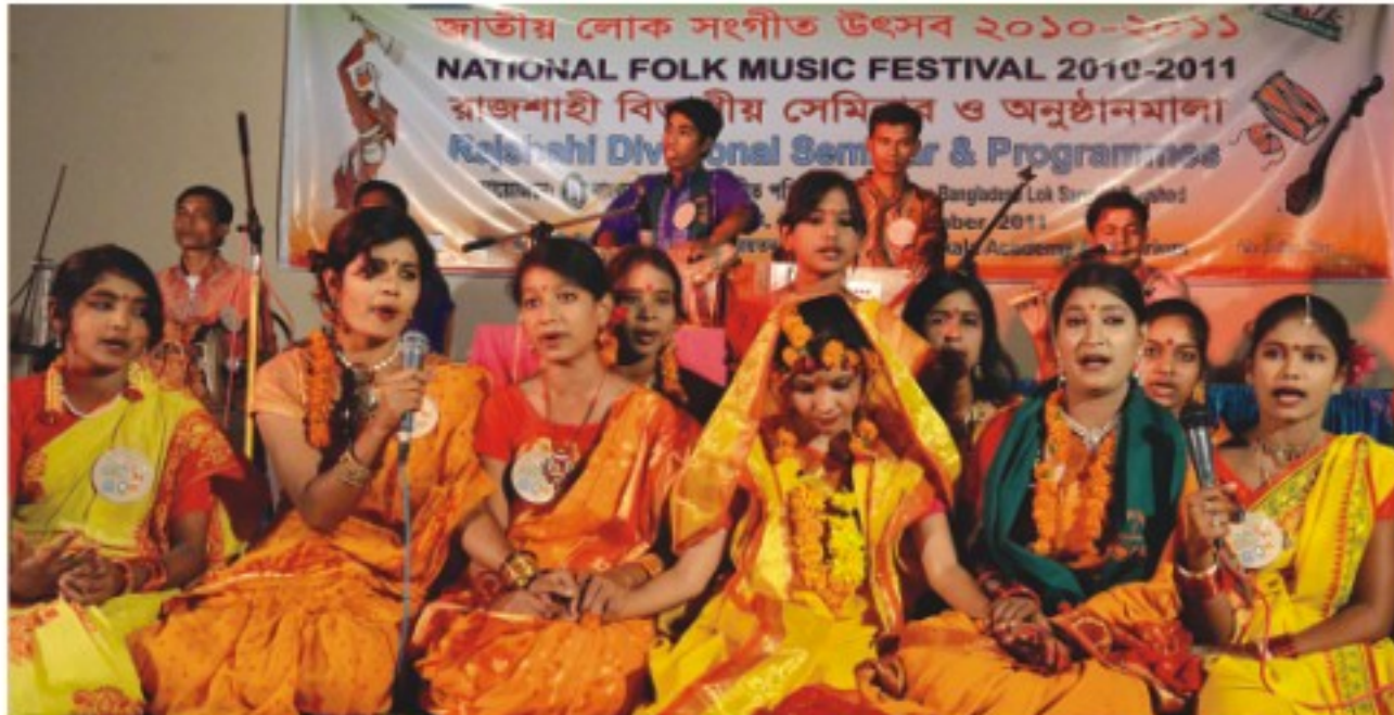
Artistes perform a wedding song at the festival.

Dev Anand was soon offered a break as a member of the Indian People's Theatre Association.