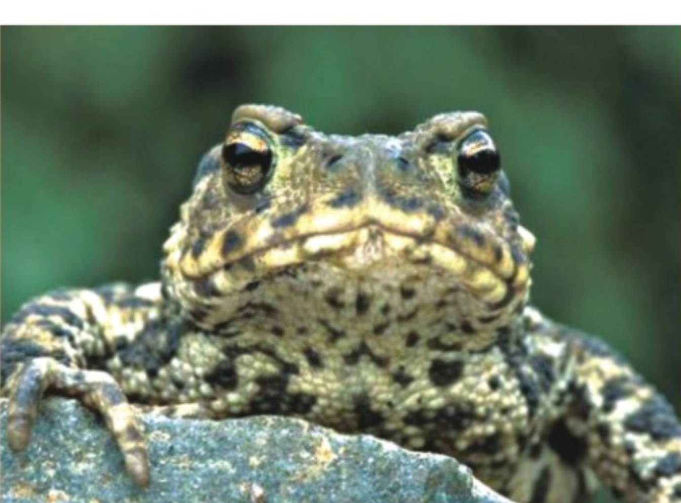
Toads appear to be able to sense impending earthquakes before any seismic activity strikes.

Animals may sense chemical changes in groundwater that occur when an earthquake is about to strike. This could be the cause of bizarre earthquake-associated animal behaviour, scientists say. Researchers began to