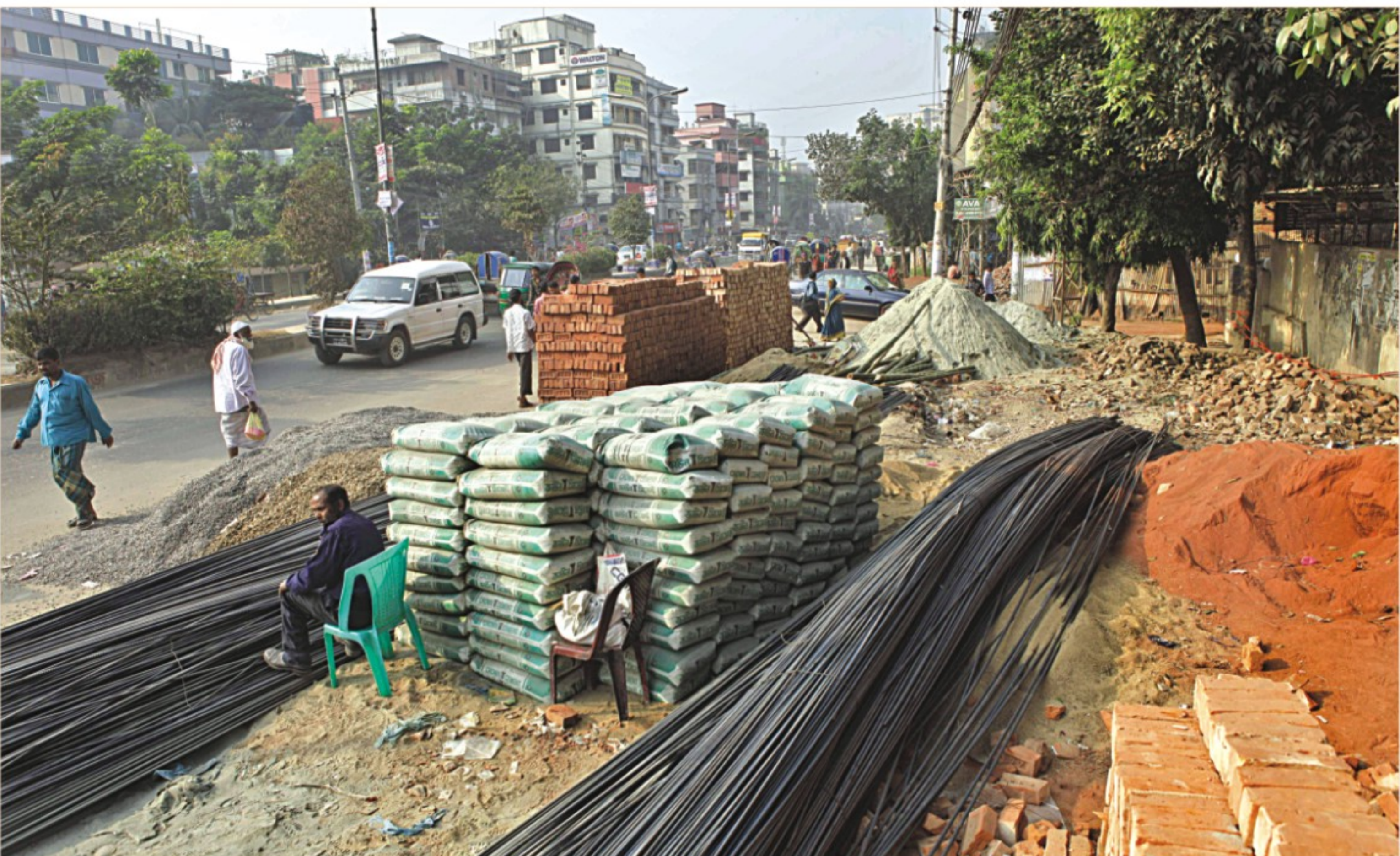
Over half the street is occupied by construction materials on Shyamoli-Mohammadpur Link Road in the capital. The area suffers from frequent traffic jams because of this and local residents claim that road mishaps have become very common here.

SHANTIMOY CHAKMA, Rangamati Fourteen years after the signing of THE Chittagong Hill Tracts (CHT) peace accord, the main clauses of the landmark treaty still remain unfulfilled. The then Awami League government and Parbattya Chattagram Jana Sanghati Samity (PCJSS) signed the deal on December 2, 1997. A total of 1,947 PCJSS members surrendered and handed over their arms and ammunition to the government in four phases as per the treaty. According to a book published by the PCJSS on the eve of the 14th anniversary of the accord, the government is yet to declare the CHT as a special region or Jumma land for Jumma people. It has not brought any amendment or any changes into the laws concerned, resolved land dispute in the hills and fixed non-indigenous (Bangalees) permanent residents. A voter list is yet to be prepared. Rules of business for preparing the voter list and holding elections to the CHT regional council and HDCs are yet to be enacted. The provision that the lone authority will be the three circle chiefs in issuing permanent resident certificates for hill