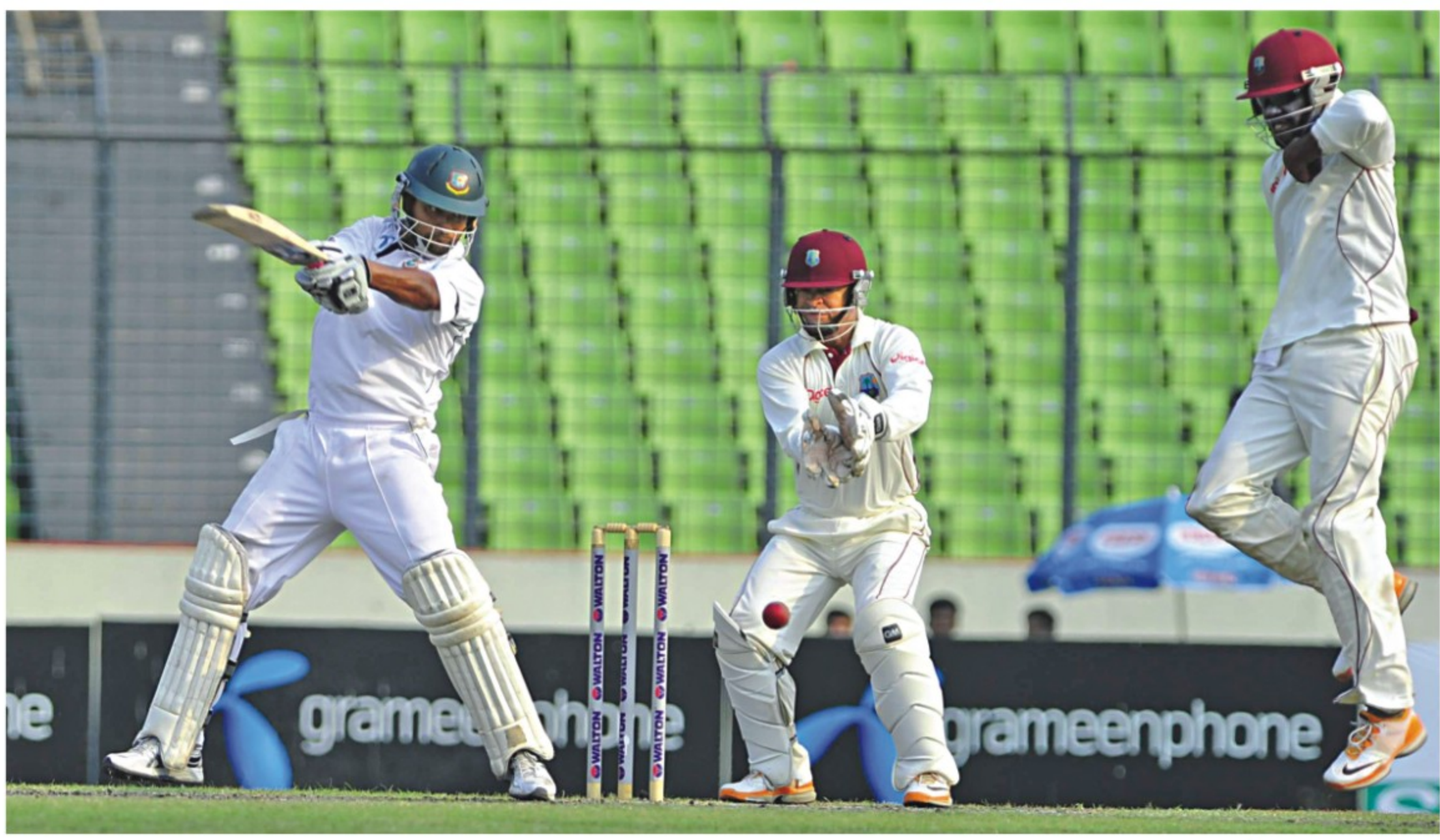
Bangladesh opener Tamim Iqbal cuts one off the back foot during the second Innings of the second Test against West Indies at the Sher-e-Bangla National Stadium in Mirpur yesterday. Tamim's unbeaten 82 helped Bangladesh end Day Four on 164 for 3, trailing by 343 runs with 7 wickets in hand. See story on page 16