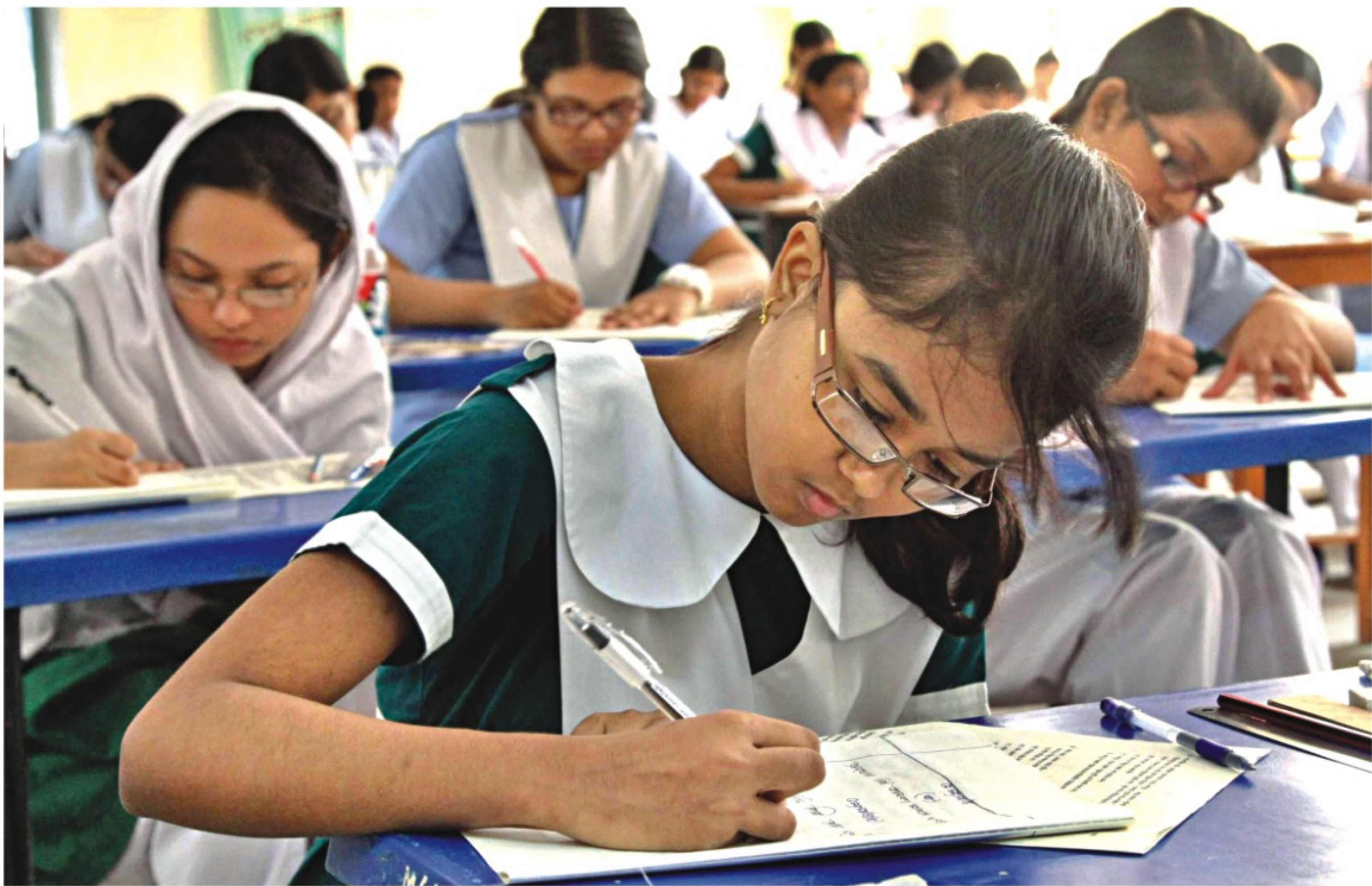
Class-VIII students taking the Junior School Certificate examinations at Motijheel Government Girls High School in the capital yesterday morning. Story on page 5