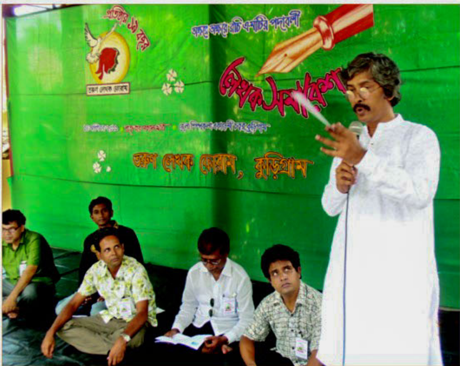
Poet Abu Hasan Shahriar speaks at the event.

The forum was formed on September 6, 1992 with 20 young writers. The aim of the forum is to groom and encourage emerging writers. Srijan (a half-yearly literature magazine) is being published regularly in Kurigram," said General Secretary of the forum, Ahsan Habib Nilu.