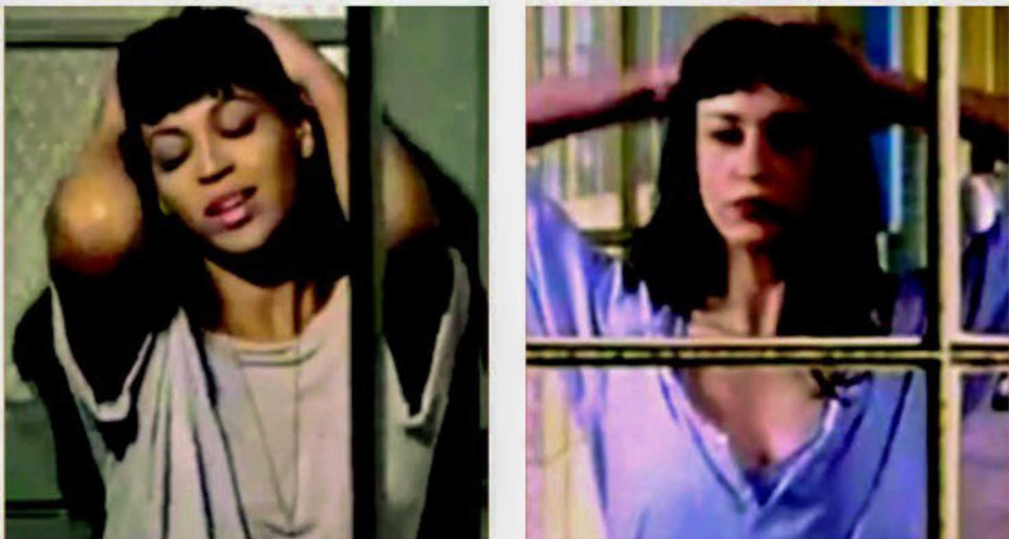
Side by side: Beyonce in "Countdown" (left) and a still from the "Rosas Danst Rosa" video.

"[The original ballet] was refreshing, interesting, timeless,"