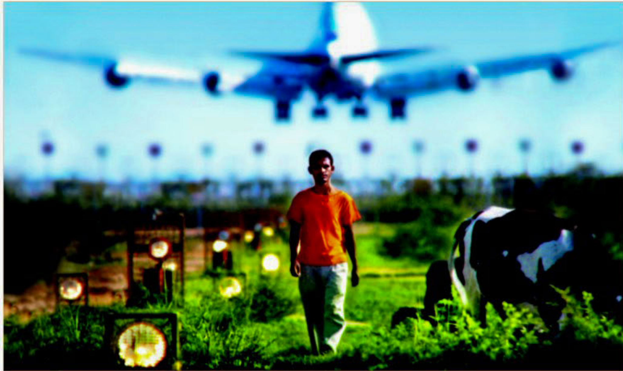
Tareque Masud's "Runway" will be screened in the Tribute section.

The 12th Dhaka International Film Festival (DIFF) will be held from January 12 to 20, 2012. The slogan of the festival is "Better Film, Better Audience, Better Society". The festival is organised by Rainbow Film Society, which is dedicated to the promotion of a healthy cine culture in Bangladesh, and celebrates global cinema. The organisers have asked for submissions from Bangladeshi filmmakers. The last date for submission is October 31, 2011. For details, enthusiastic filmmakers can visit the official website of the festival: www.dhakafilmfest.org. The organisers have decided to pay tribute to the recently deceased Bangladeshi filmmaker Tareque Masud through screening his films in the Tribute segment. The films include "Runway" (2010), "Ontorjatra" (2005), "Matir Moyna" (2002) and "Mukti Gaan" (1995). The highlight of the festival would be presence of one of the pioneering Iranian "New Wave" filmmakers -- Dariush Meherjui. "He will attend the festival as a delegate and seven of his films will be screened in the Retrospective segment," confirmed festival director Ahmed Muztaba Zamal. Meherjui's "Gaav" (The Cow, 1969) is widely considered as the pioneering film of