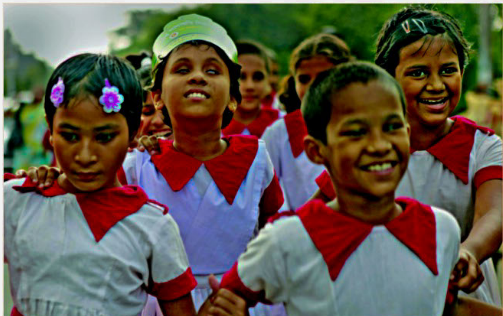
Visually impaired children take part in a procession at Agargaon in the city yesterday organised by Ministry of Social Welfare and some social organisations marking White Cane Safety Day.