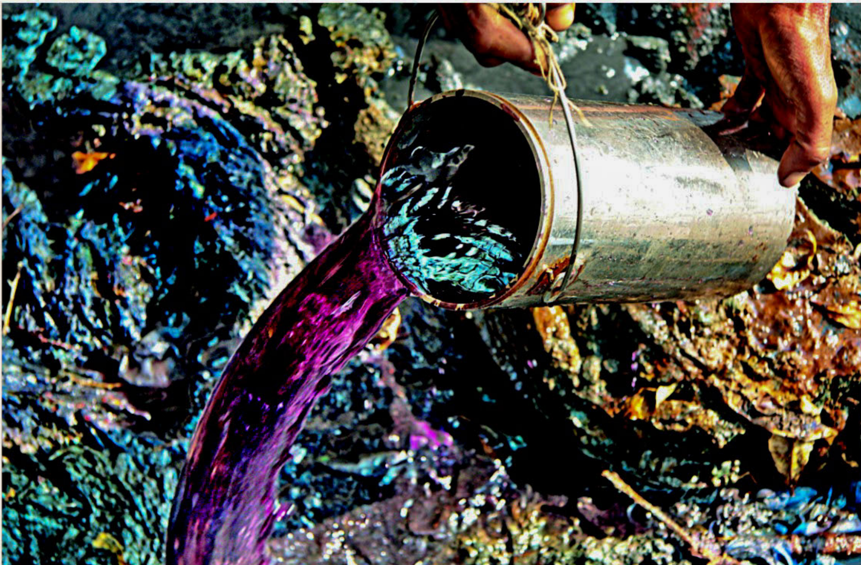
This dark substance from a can shows the kind of effluent released by Pakiza Dyeing and Printing Industries in Chhotoboli (Mehr) and ending up in rivers and wetlands of Savar. DoE fined the industry Tk 35 lakh. The photo was taken yesterday.