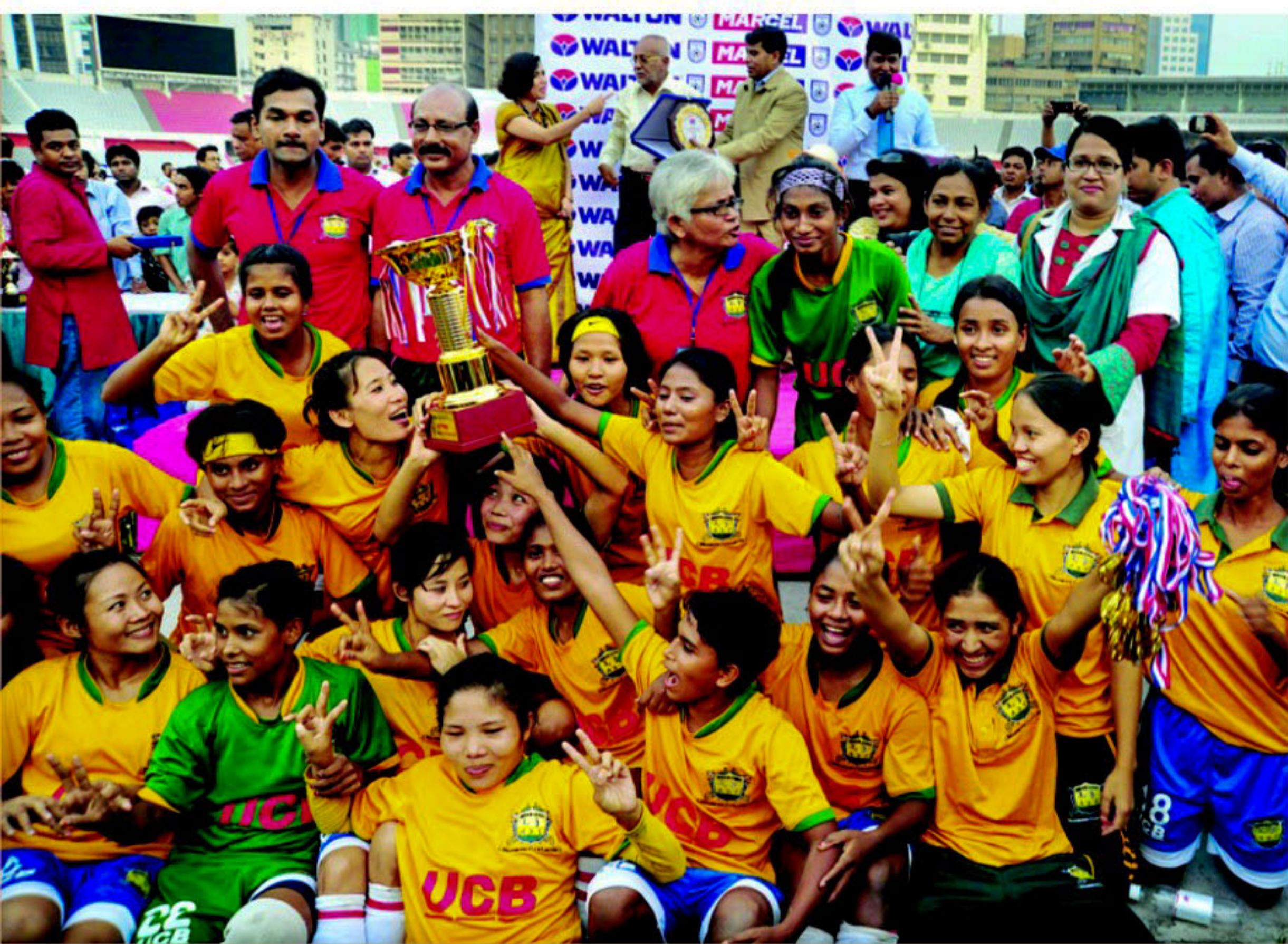
Members of the triumphant Sheikh Jamal Dhanmondi Club celebrate with the trophy of the Walton Women's Football League after beating Mohammedan Sporting Club 2-0 in the final at the Bangabandhu National Stadium yesterday.