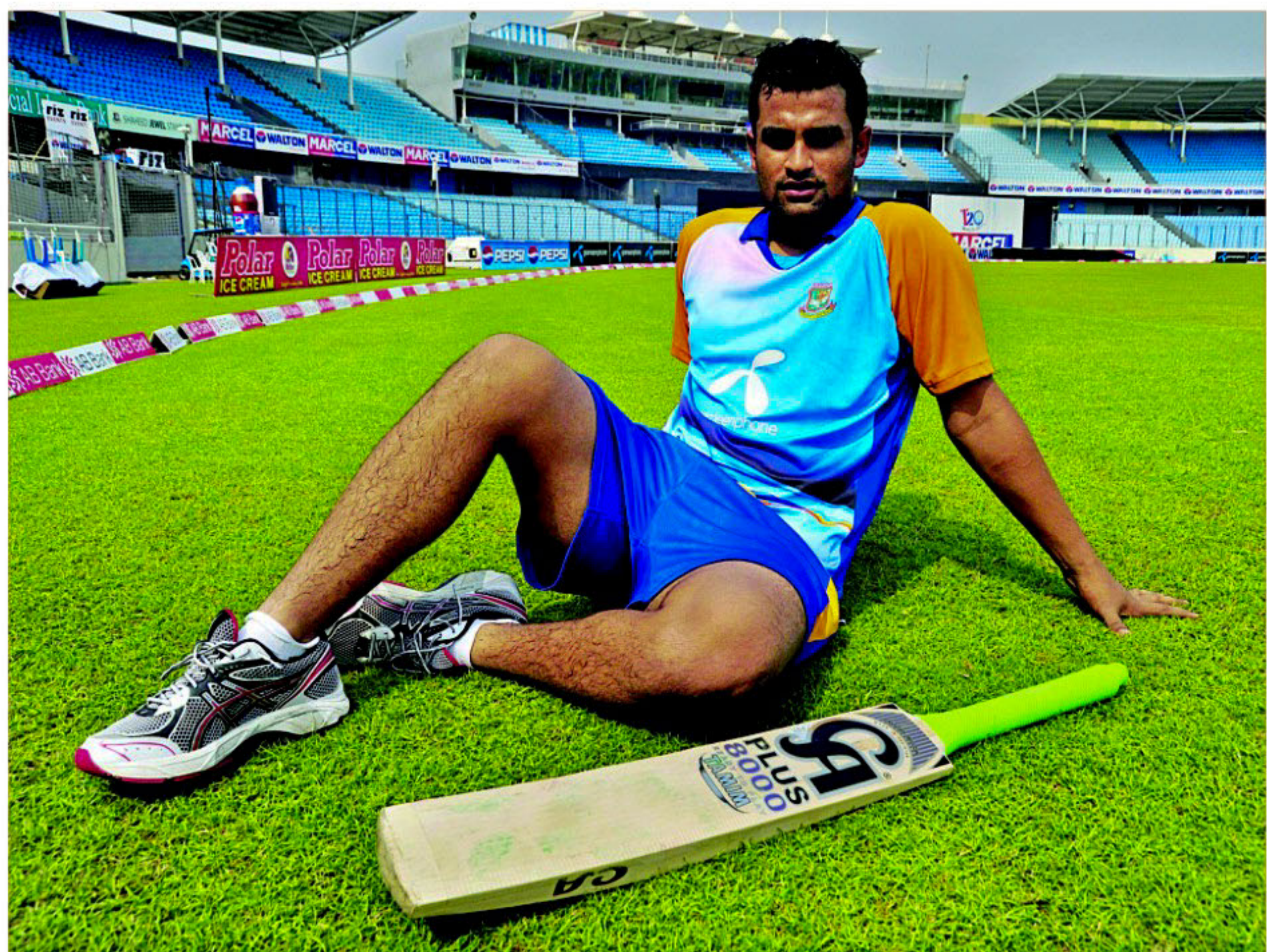
Tamim Iqbal relaxes at the Sher-e-Bangla National Stadium in Mirpur yesterday.

It's a crucial match for Mushfiqur to keep the series alive and nothing can be better for the wicketkeeper batsman if he can win his first one-day game as a captain in his 100th ODI match.