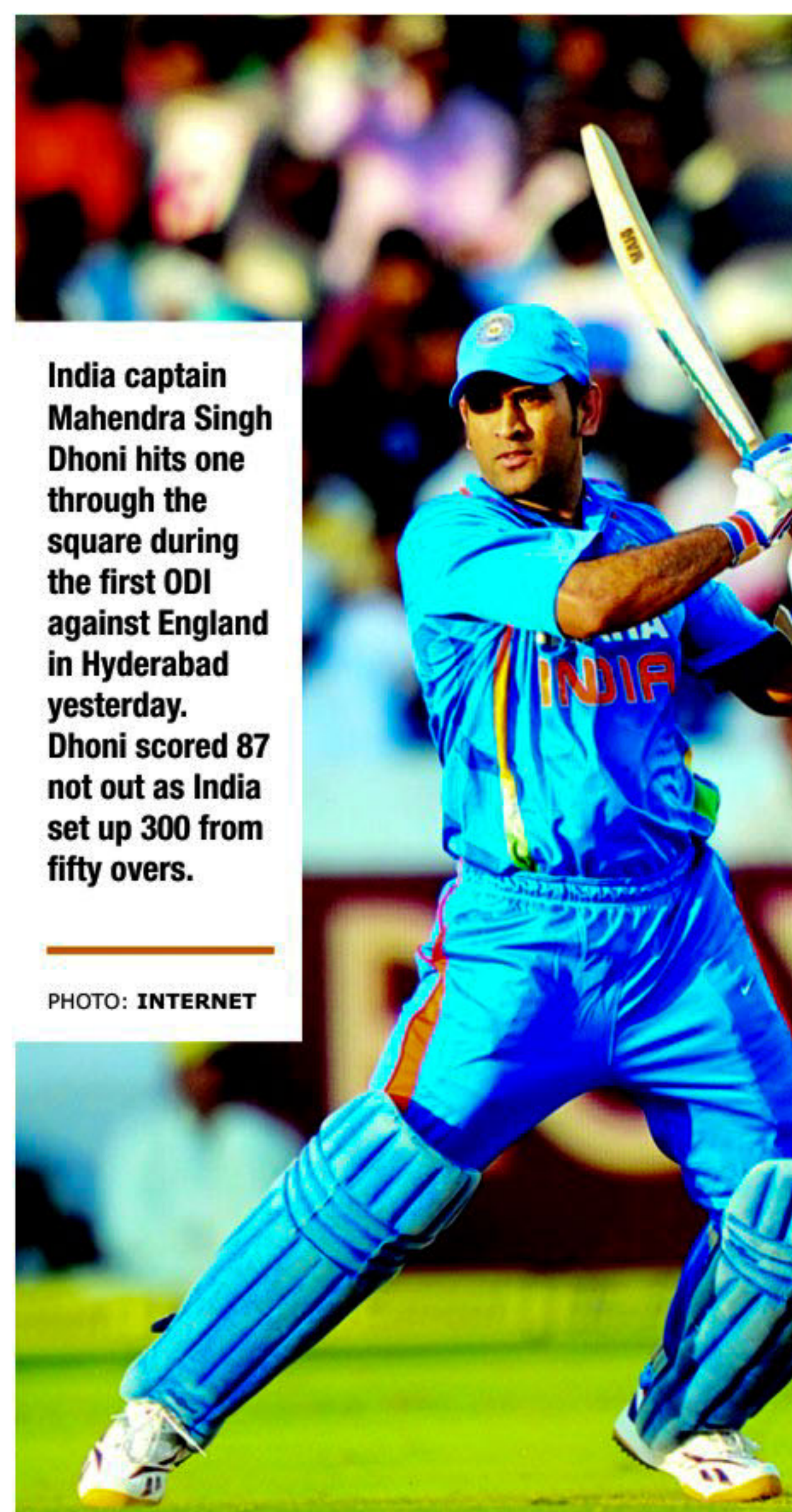
India captain Mahendra Singh Dhoni hits one through the square during the first ODI against England in Hyderabad yesterday. Dhoni scored 87 not out as India set up 300 from fifty overs.