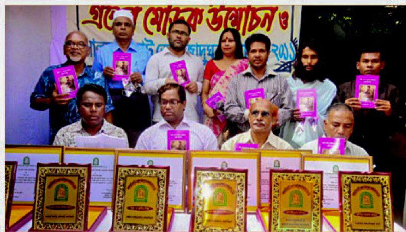
Dignitaries at the book launch.