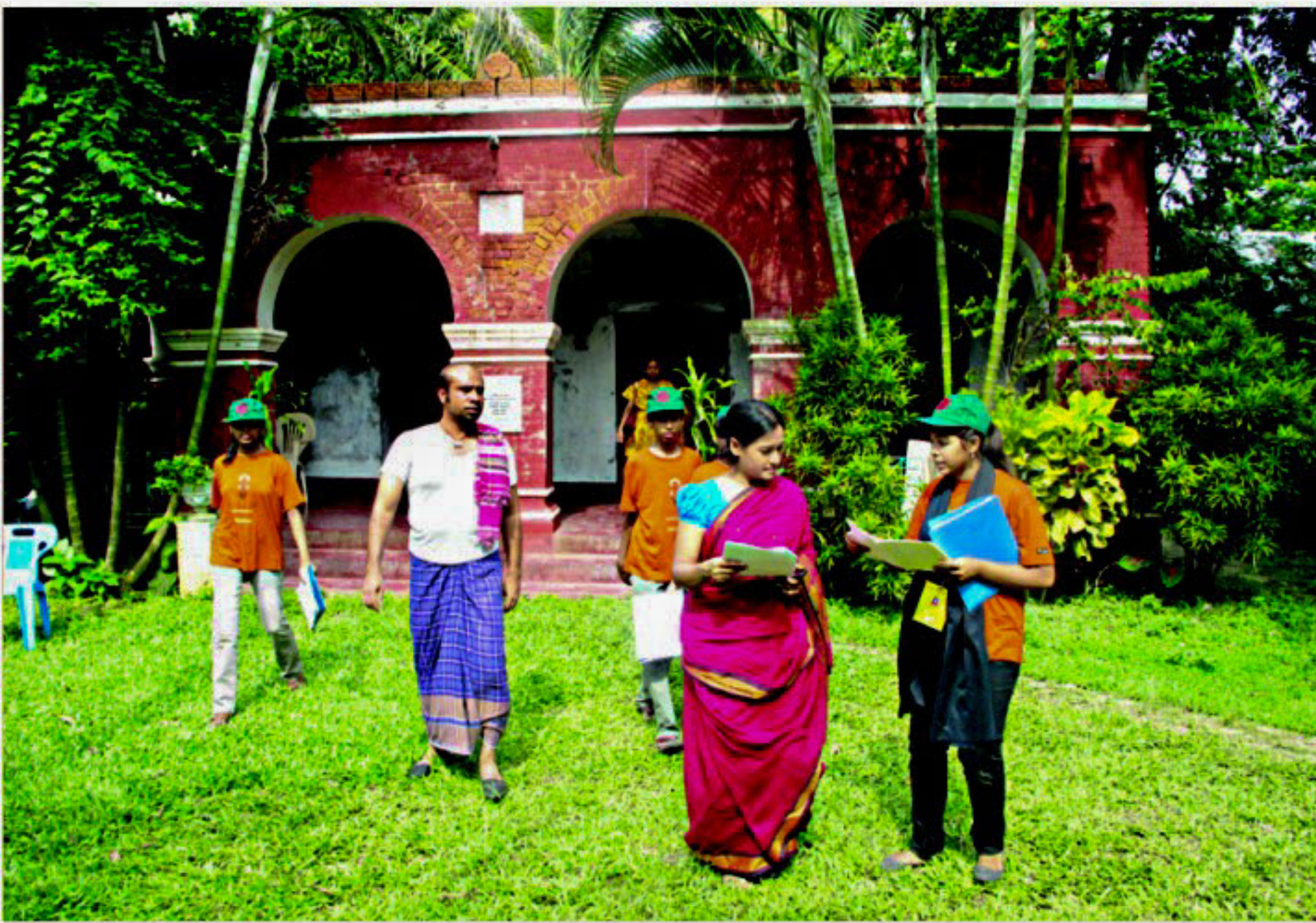
Young filmmakers busy at work at the third instalment of the workshop.