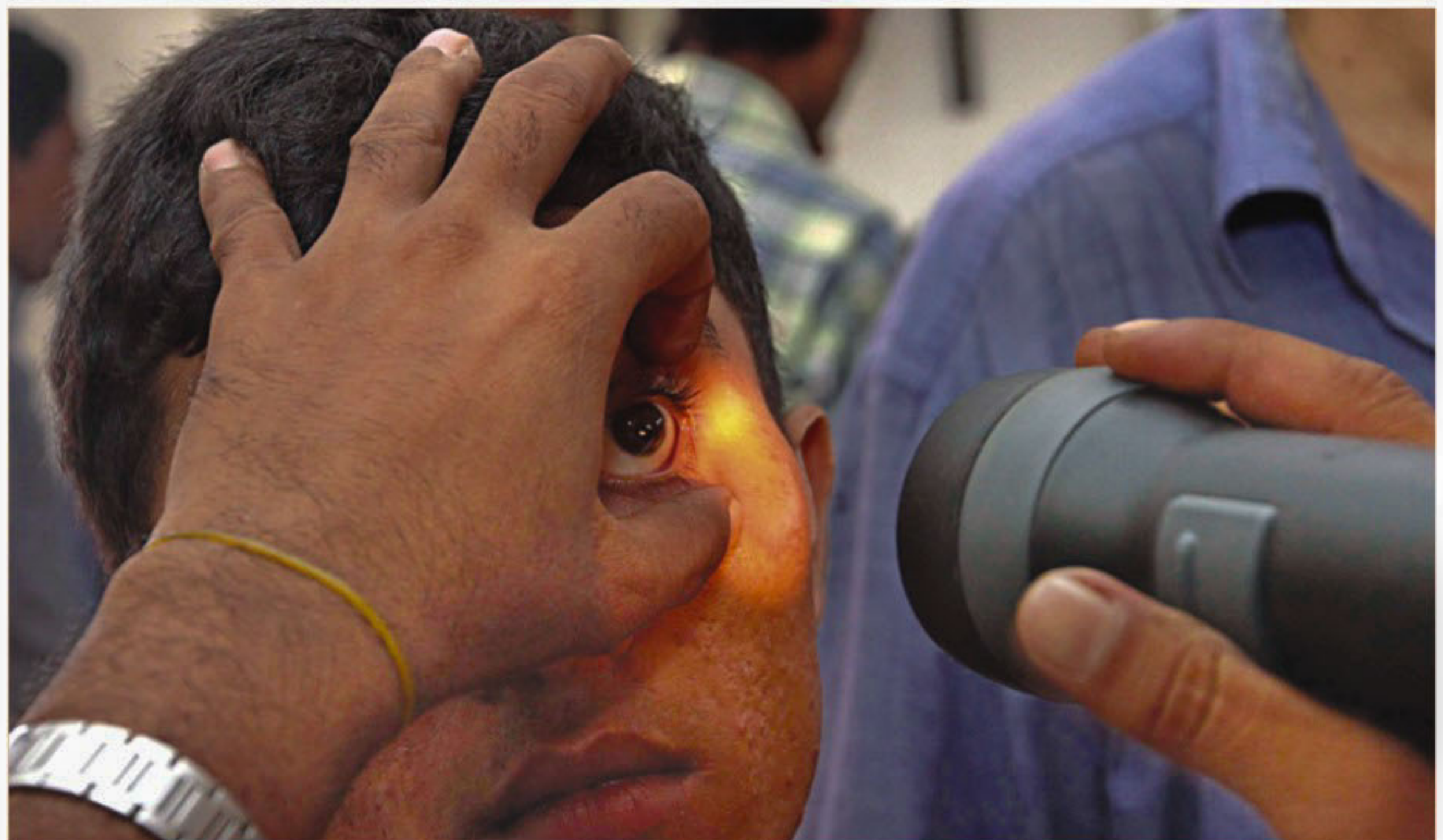
A bus driver has his eyes checked by doctors at a camp at Mohakhali bus terminal yesterday. Poor vision of drivers is blamed for many road mishaps in the country. Dhaka Urban Comprehensive Eye Care Project organised the free eye check-up to mark World Sight Day. Story on page 3.