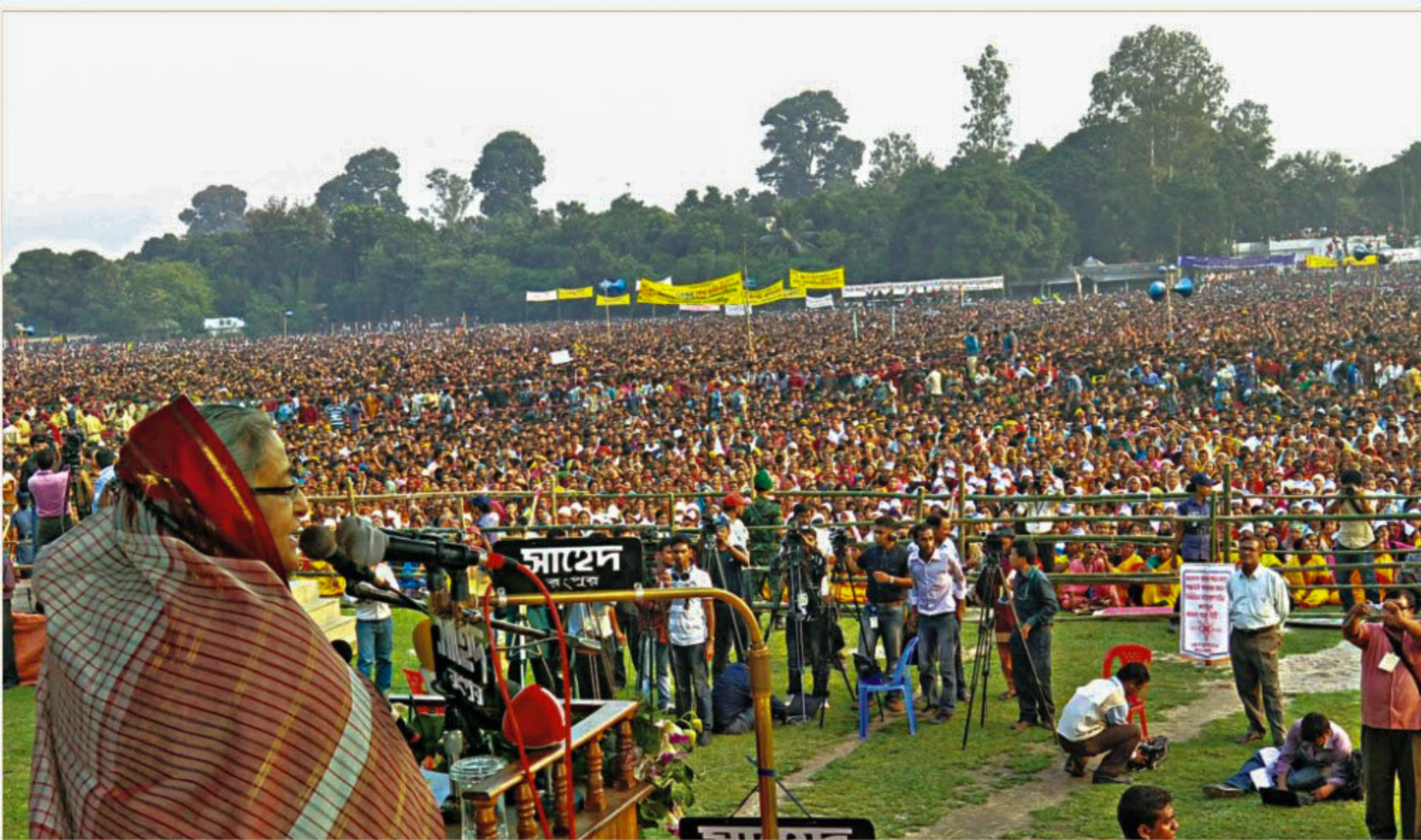
Awami League President Sheikh Hasina speaks before thousands who attended a rally on Nilphamari Govt High School ground yesterday. The programme has been seen as countering the opposition's anti-government agitation.