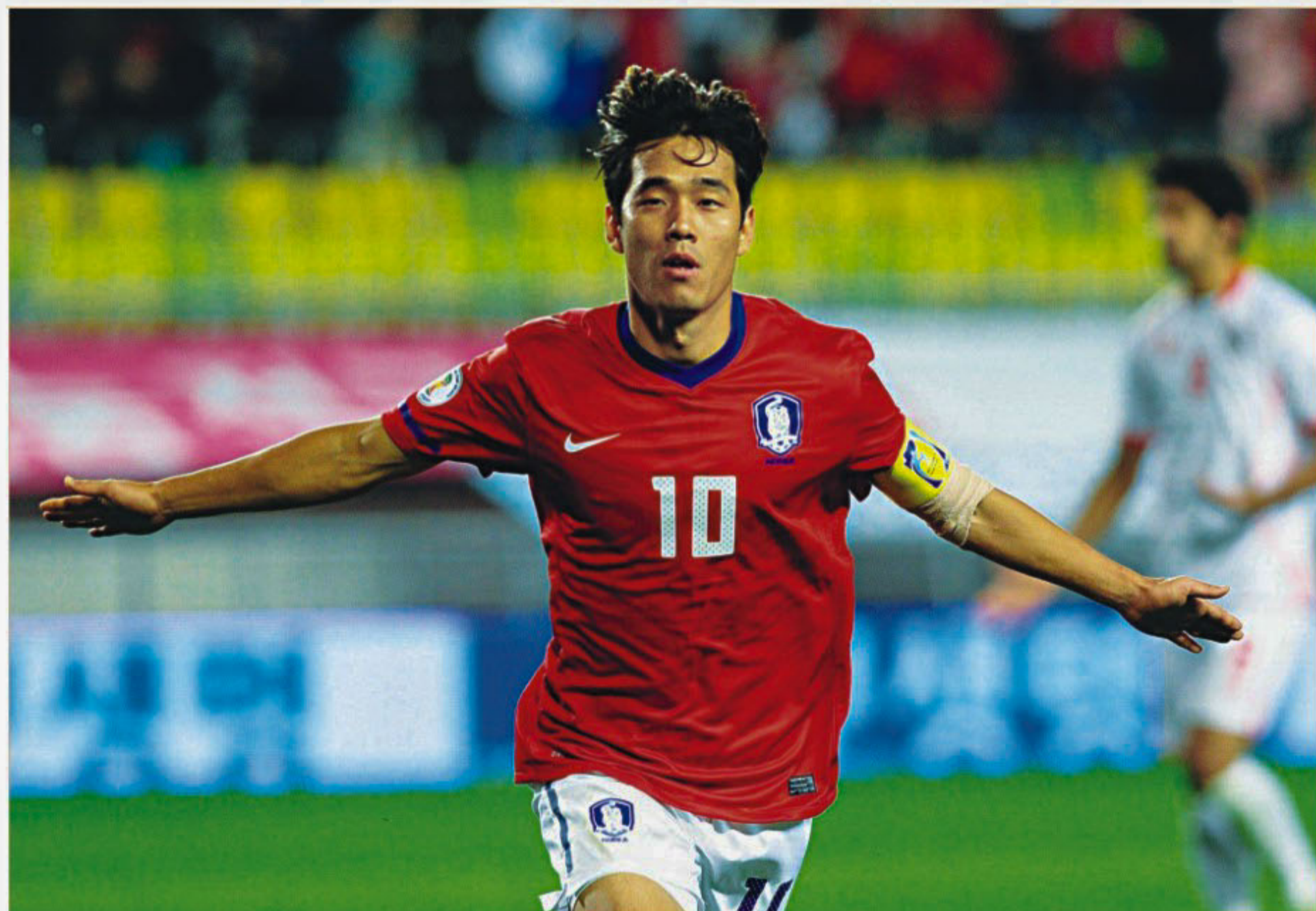
South Korea striker Park Chu Young celebrates his opening goal against the United Arab Emirates during a 2014 World Cup qualifier in Suwon yesterday.

The two third-placed teams will then face each other for the right to contest an intercontinental play-off.