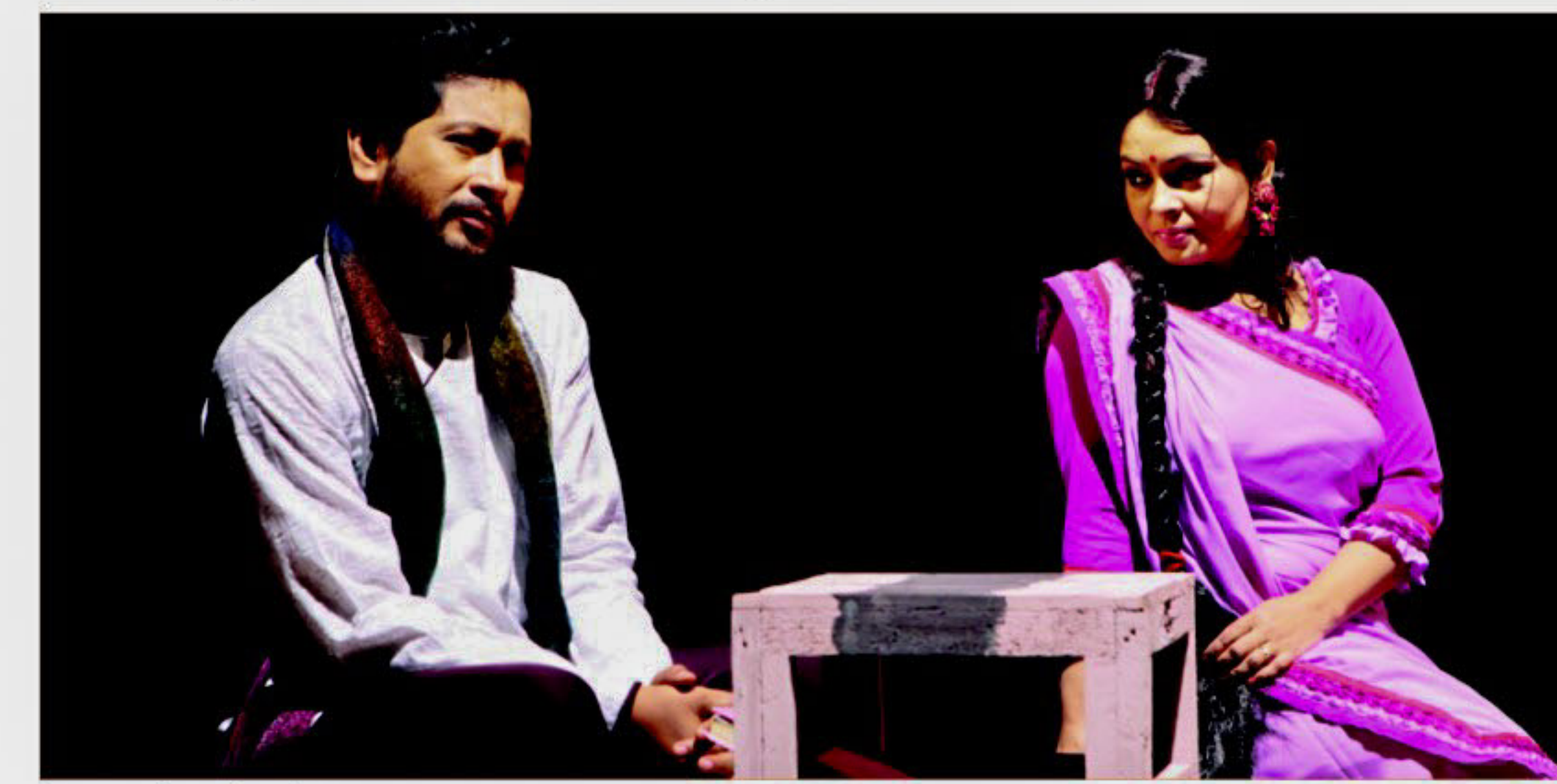
A scene from the play.