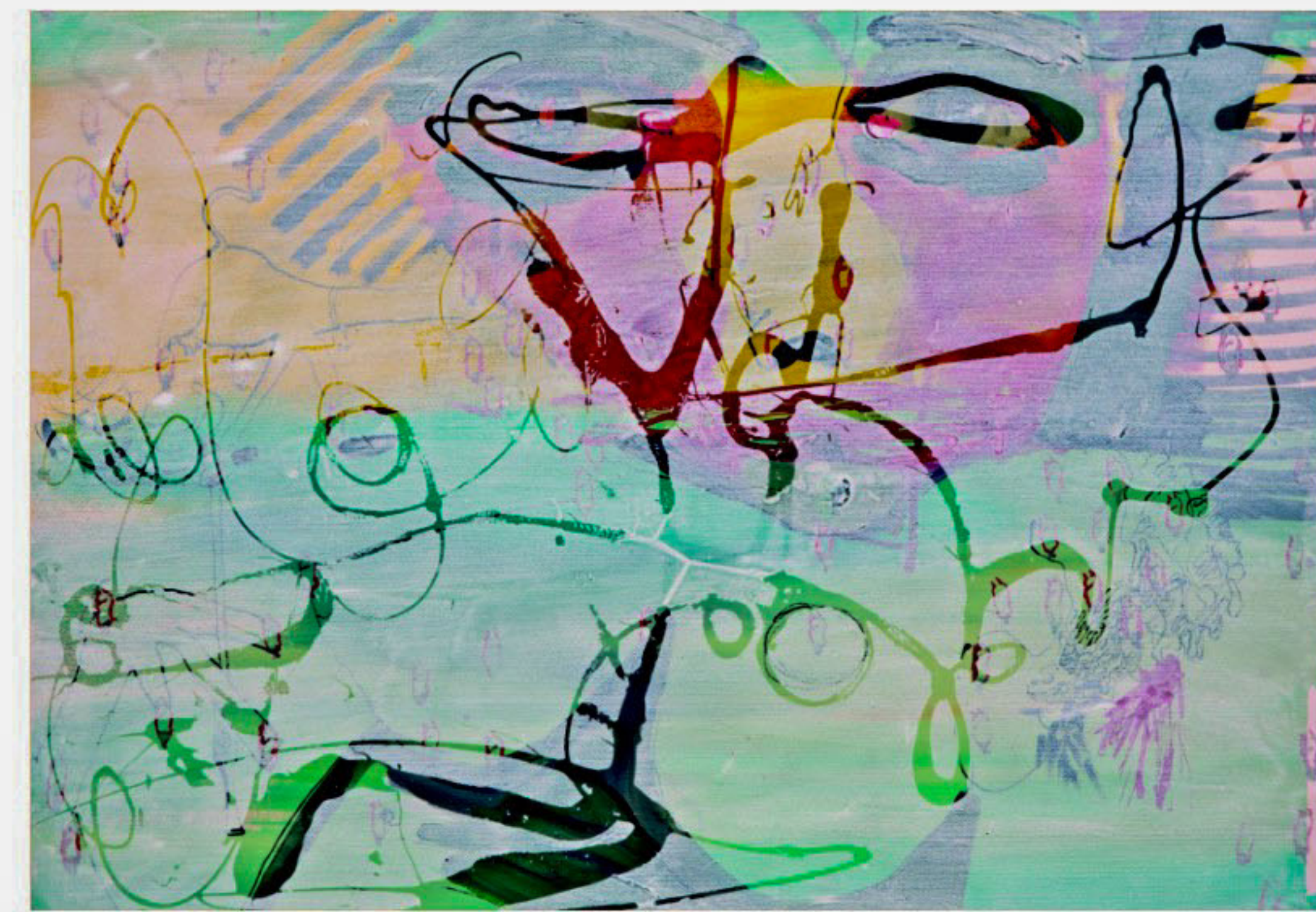
"Untitled" is replete with delightful images in colours of uncut gems flying on the pristine white canvas.