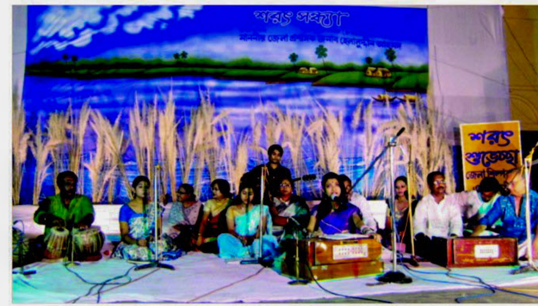
Artistes perform at the programme.