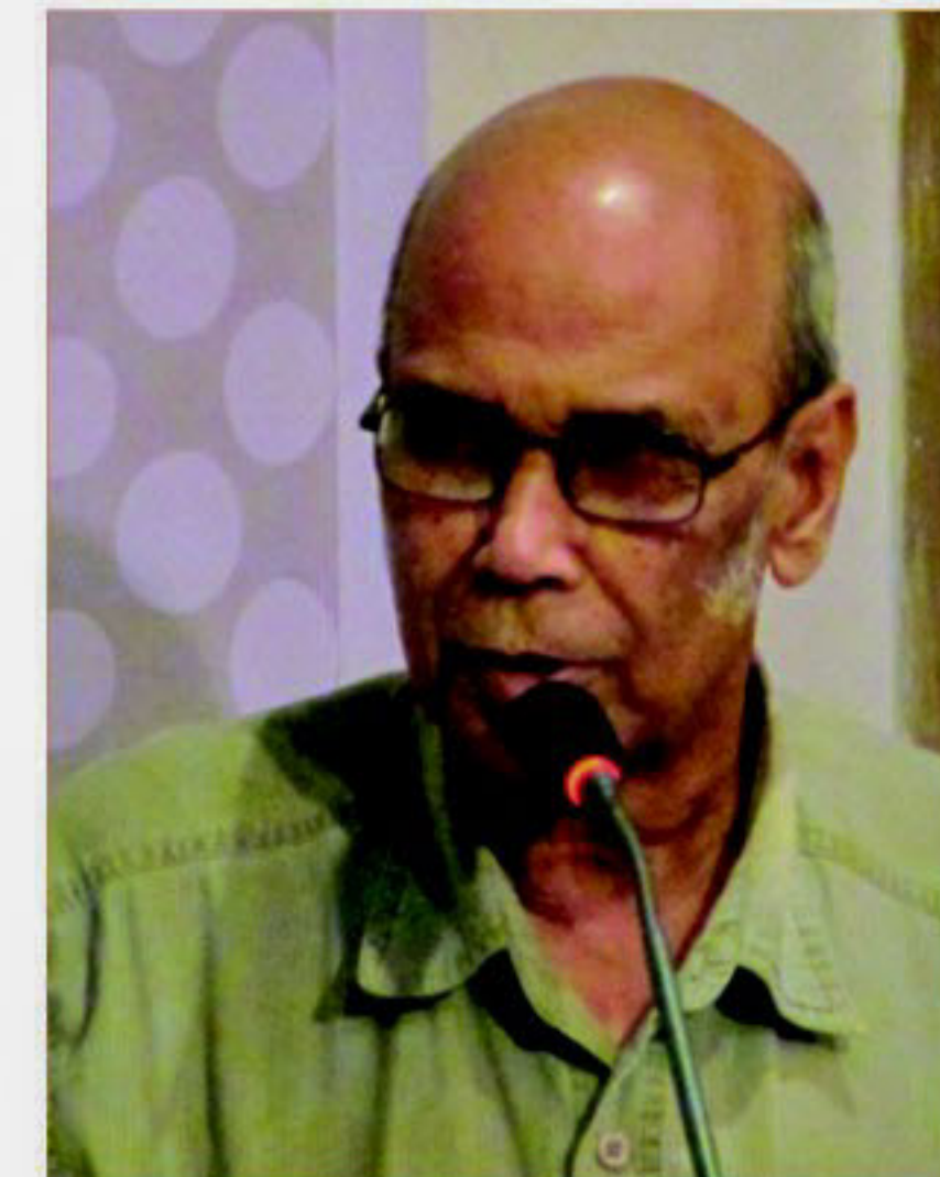
given newer dimensions to Bengali literature. The poet has received many prestigious awards.

Haq was born in Kurigram district on 27 December in 1935. He writes poetry, fiction, non-fiction, lyrical dance dramas and plays. He is recognised as a leading poet in Bangladesh. His experiments with forms and language have