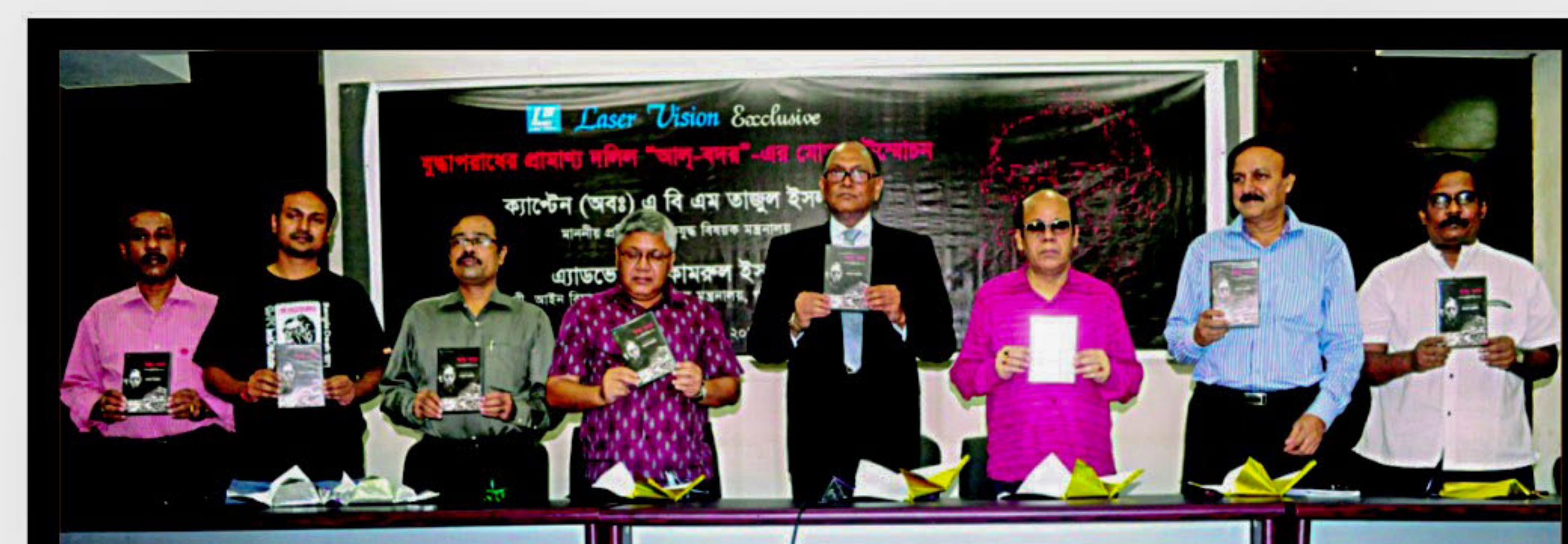
Label company Laser Vision on October 9 released a DVD of "Al Badar", a documentary based on atrocities committed during the Liberation War. The launching ceremony, held at the Press Club, was attended by eminent personalities. The documentary has been chosen as an authentic document on war crimes by the War Crimes Tribunal.