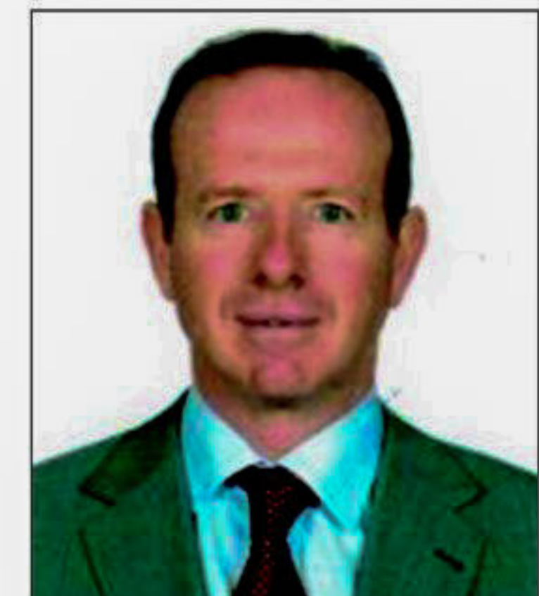
Luis Tejada Ambassador of Spain to Bangladesh

Culture, investment and trade, international cooperation and migration are the mainstays of our present relations and, at the same time, the seeds for a future expansion that our two governments should promote.