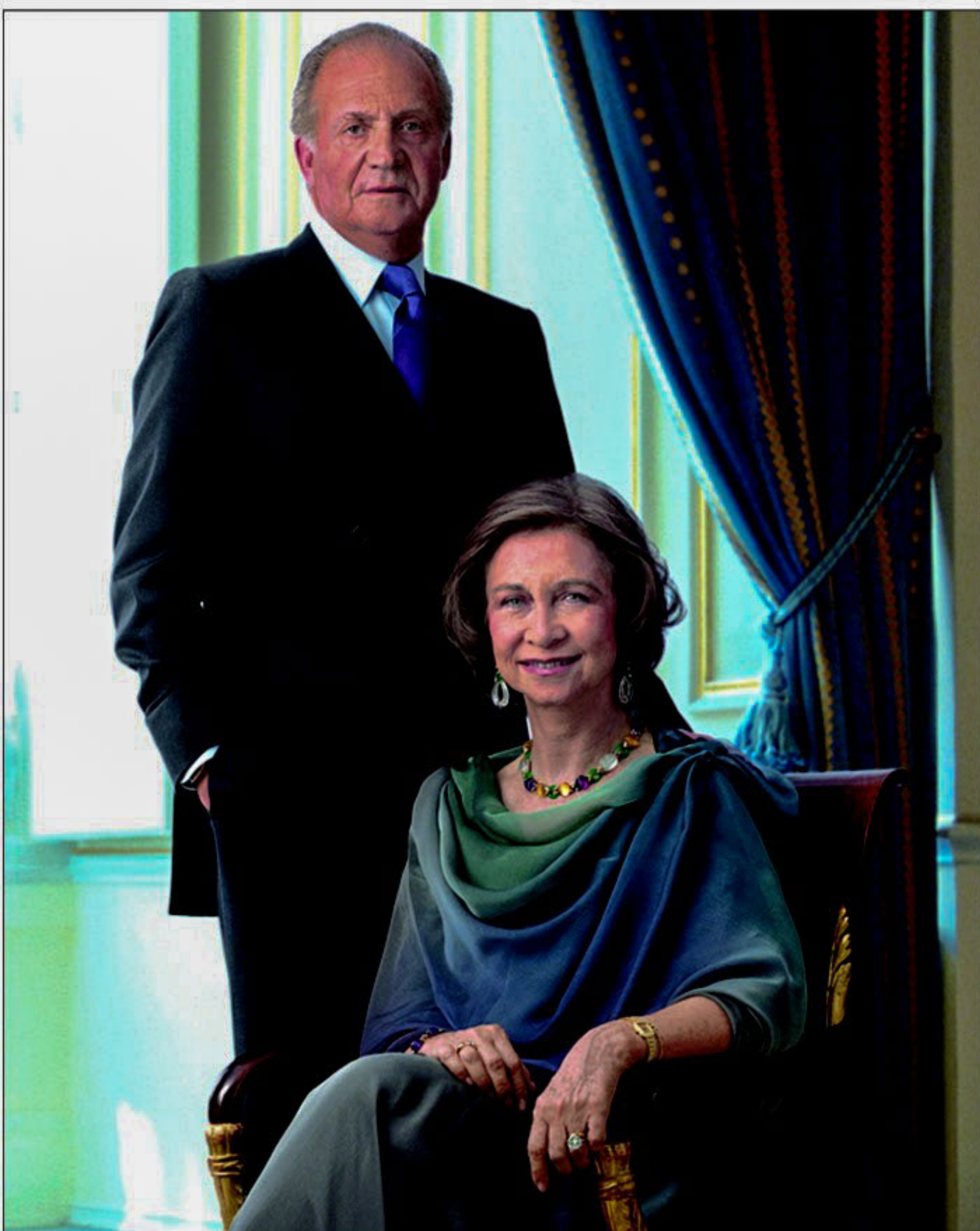
Their Majesties King Juan Carlos I and Queen Sofia of Spain