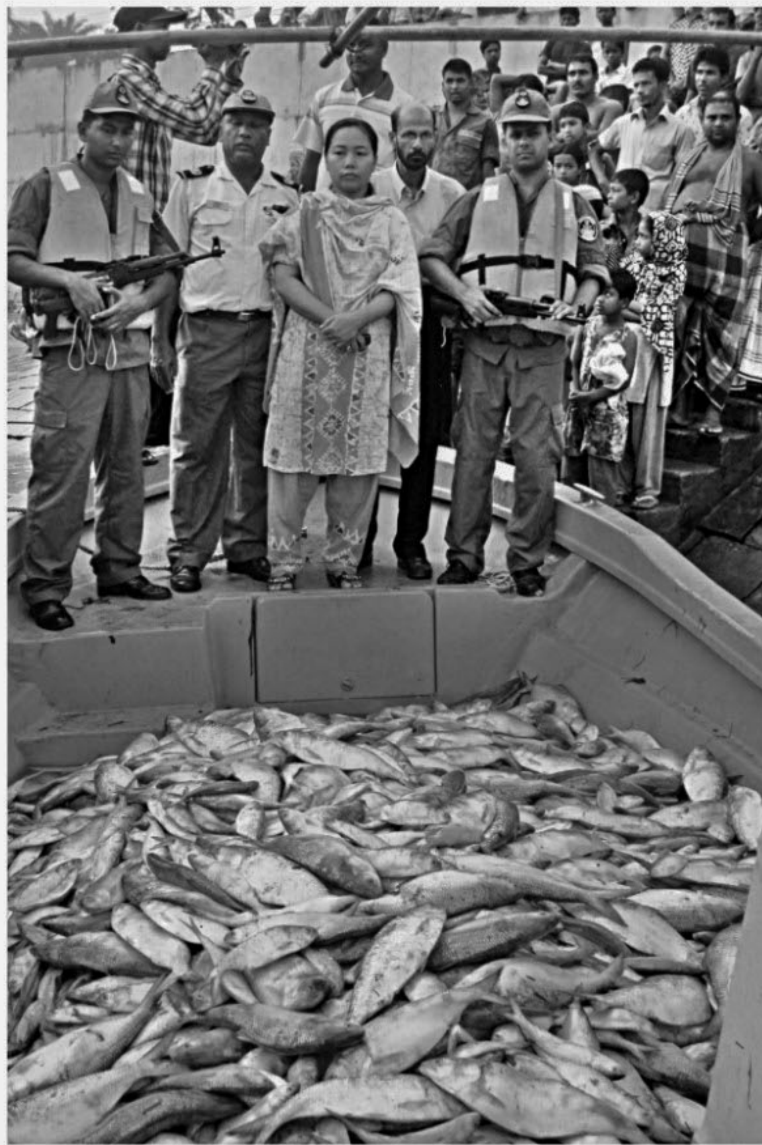
Fishermen continue to catch hilsa in Tetulia River in Patuakhali defying a ban; above, coastguards seize a trawler with four tonnes of mother hilsa on the Dhaleswari River while the boat was transporting the fish to the capital from Kaliganj area of Barisal yesterday.

A trawler from Kaliganj in Barisal were taking the fish to the capital city. However, none could be arrested as the boatman jumped into the Dhaleswari River sensing the presence of the law enforcers, coastguard sources told our correspondent.