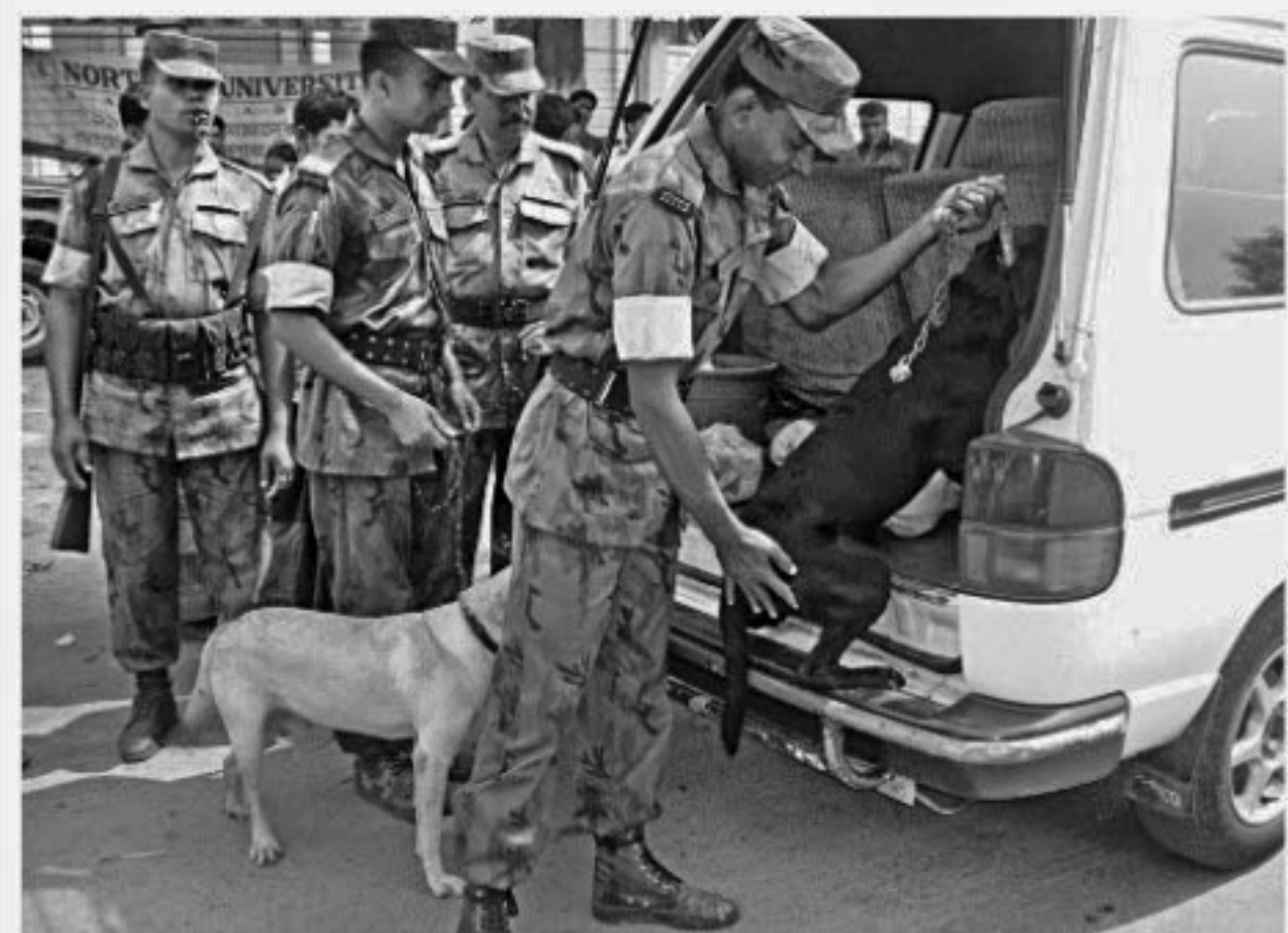
Members of Border Guard Bangladesh (BGB) yesterday launched a drive against smuggling, especially of drugs, in Chapainawabganj for the first time with a dog squad.

No case in connection with the incident was filed with Sadar Police Station as of filing of this report at 6:00pm yesterday.