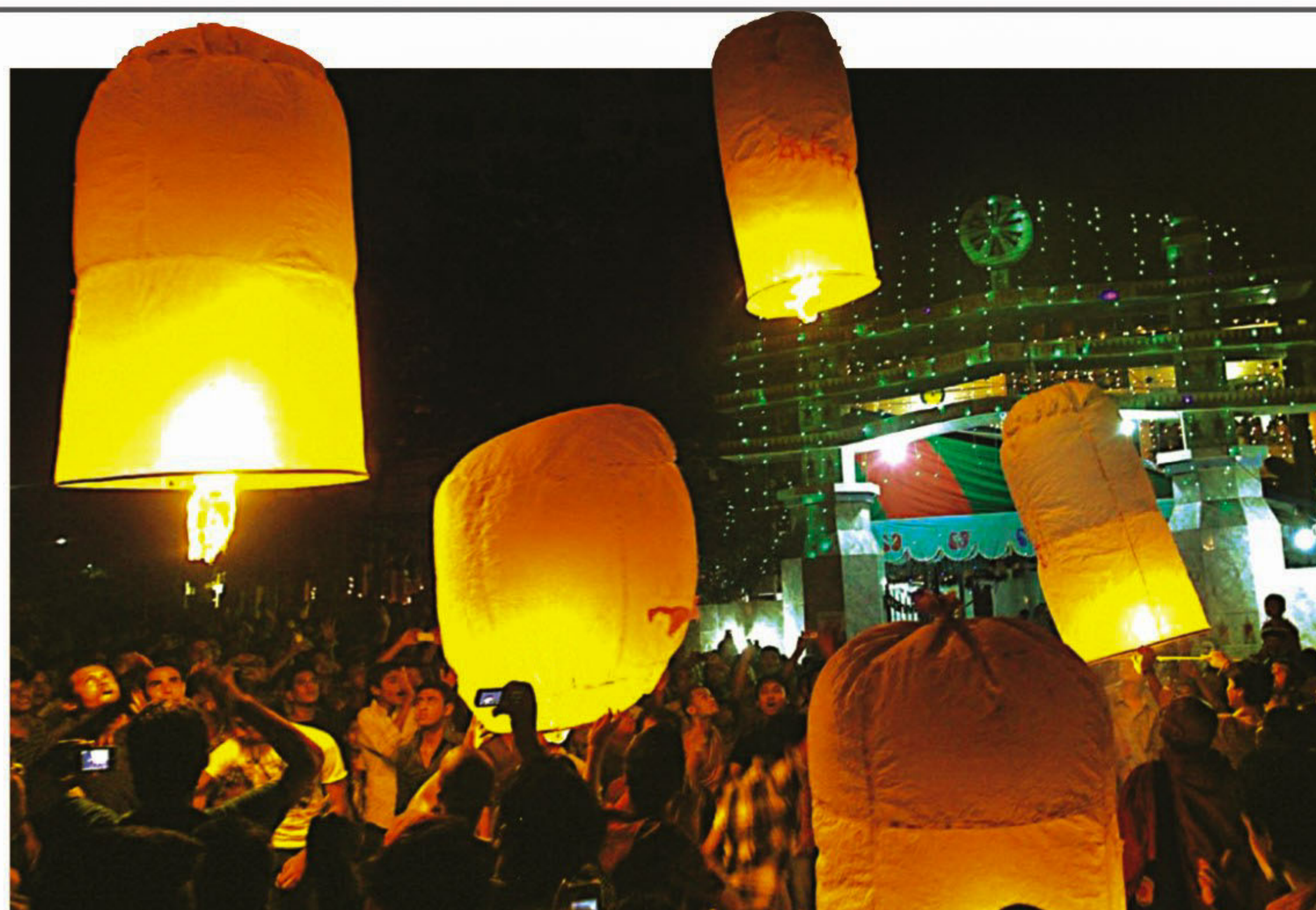
Buddhists people light balloons as they celebrate Prabarana Purnima, a religious festival, before Nanda Kanan Buddha Mandir in Chittagong yesterday.

Fugitive JMB men are trying to reorganise and carry out their mission in guise of garment workers, claimed Rab officials.