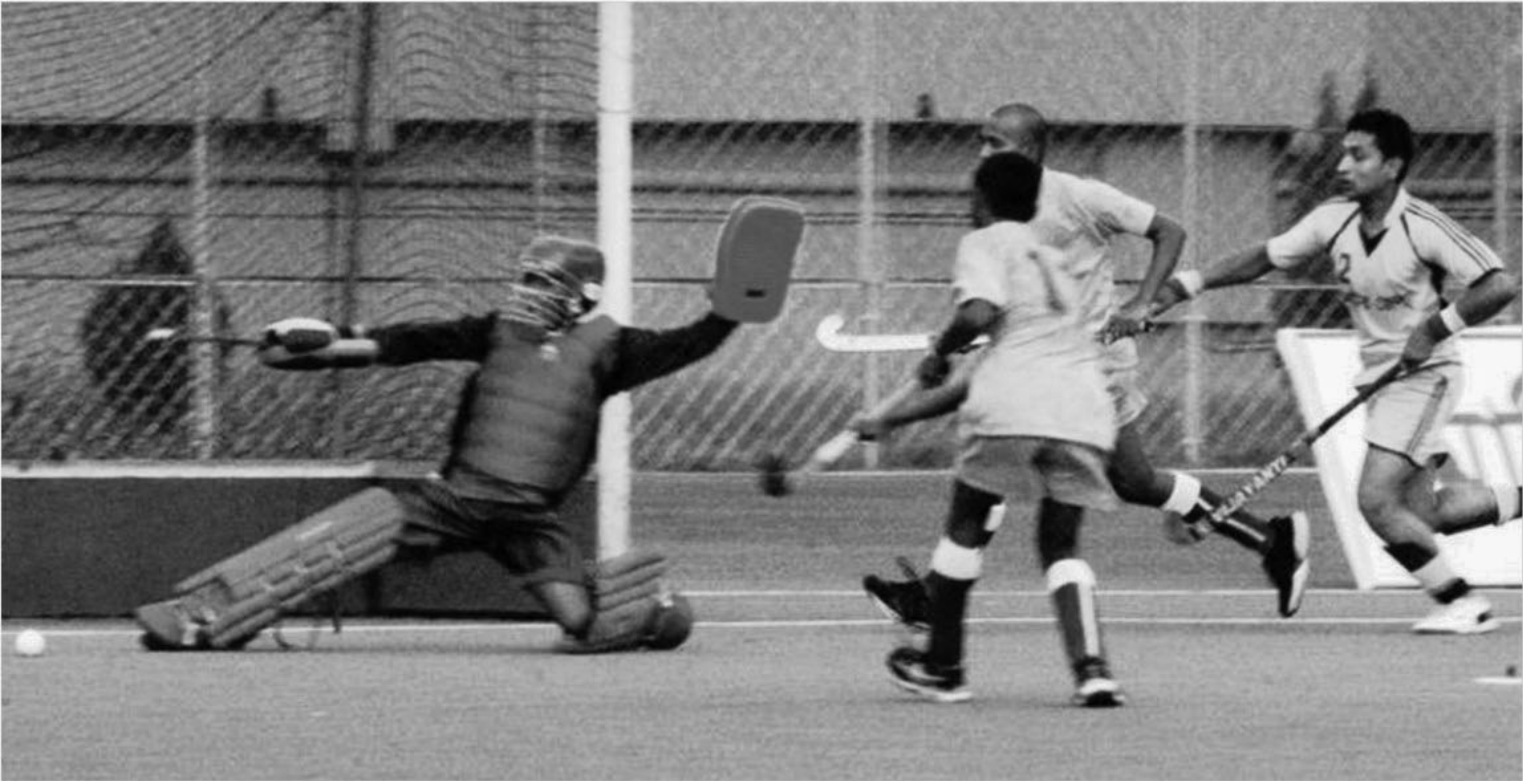
Action from yesterday's South East Bank 22nd National Youth Hockey Competition match between Dhaka and Natore at the Maulana Bhasani Hockey Stadium.