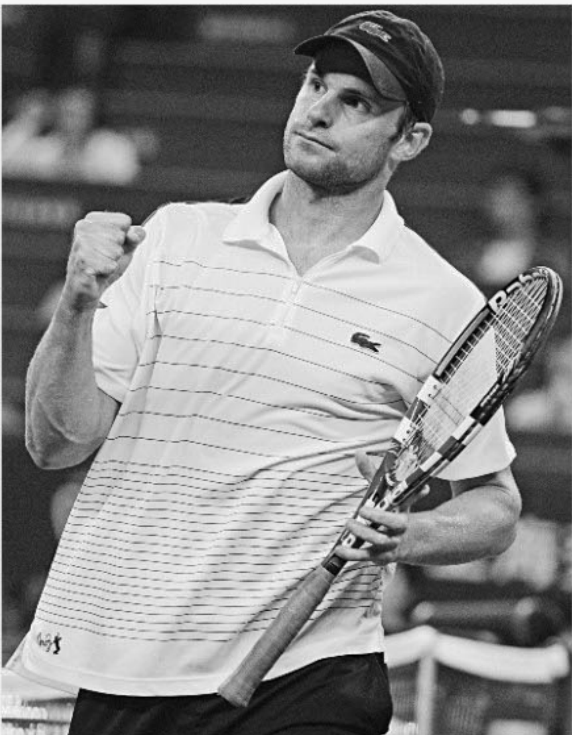
Andy Roddick of the US pumps his fist in celebration after beating Lu Yen-Hsun of Taiwan in the first round of the Shanghai Masters in Shanghai yesterday. Roddick won 6-2, 3-6, 6-2.

Wimbledon quarterfinalist Bernard Tomic beat Kevin Anderson 7-6 (7/5), 6-7 (4/7), 6-3 in a match dominated by serve, with Australia's Tomic forcing the only break of the contest in the decider.