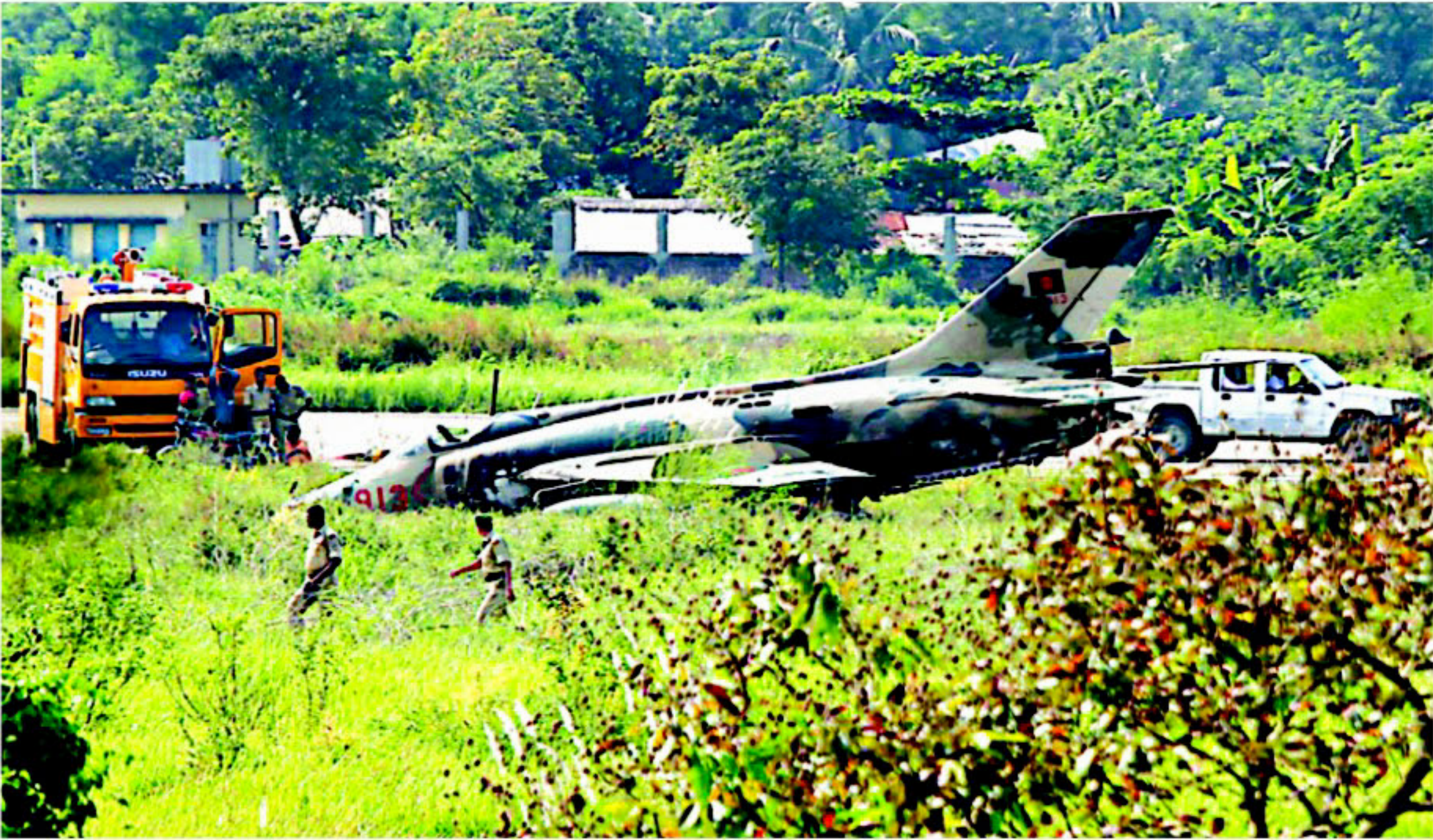
A fighter plane catches fire instants before it lands and skids off the runway at Shah Amanat International Airport in Chittagong yesterday.