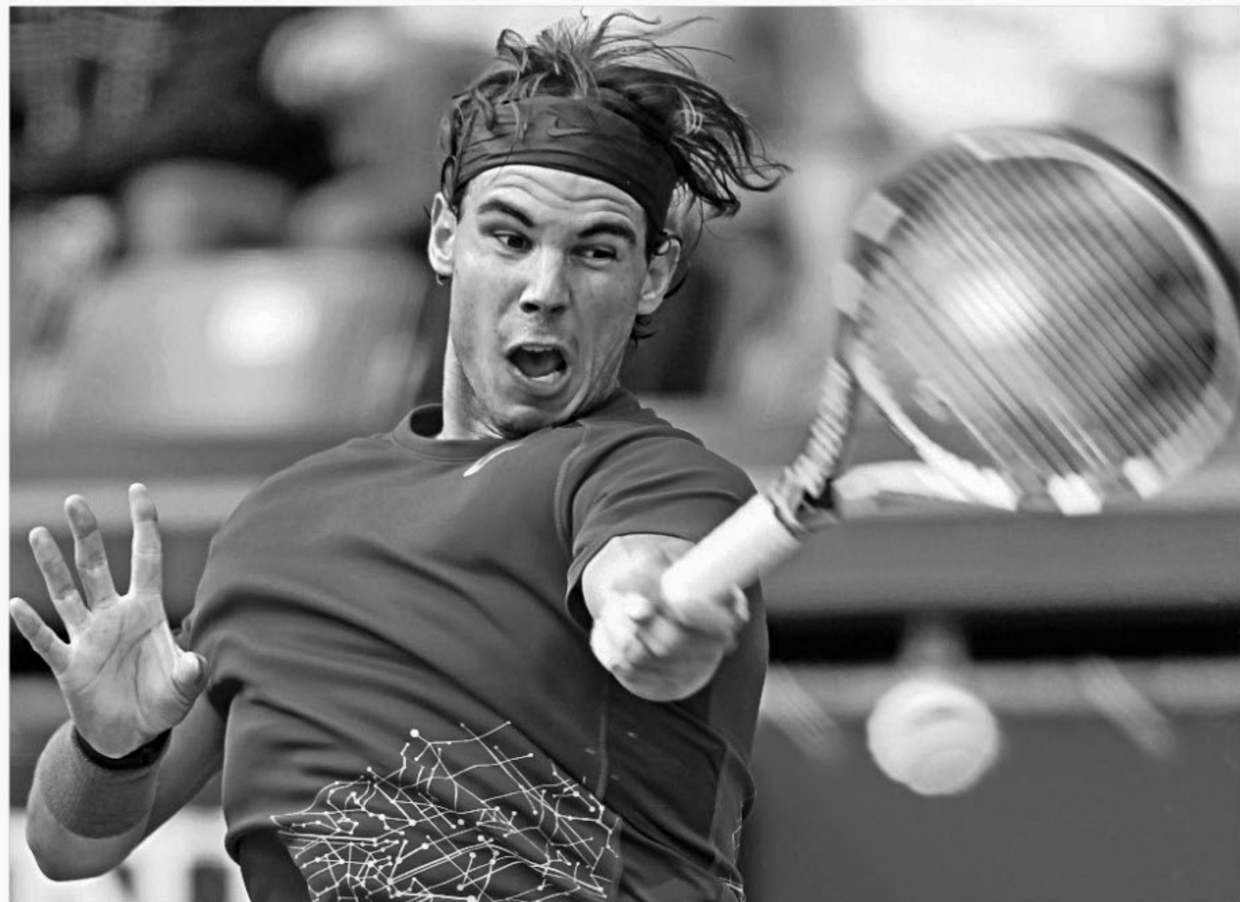
Rafael Nadal of Spain hits a forehand against Mardy Fish of USA during his semifinal victory at the Japan Open in Tokyo yesterday.