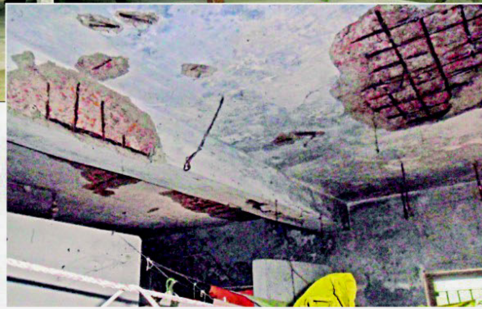
Staff work at two-storey Patuakhali fire service and civil defence office amid life risk as plasters from the roof and walls of the run-down building fall on and often while cracks have developed in the concrete structure.