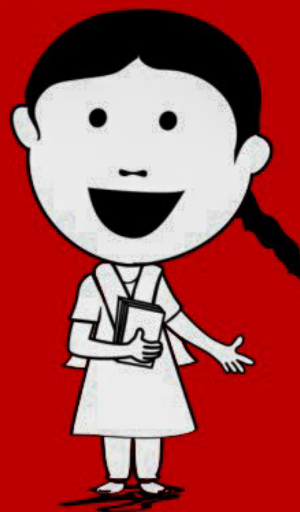
৯ম পাতায় দেখুন...