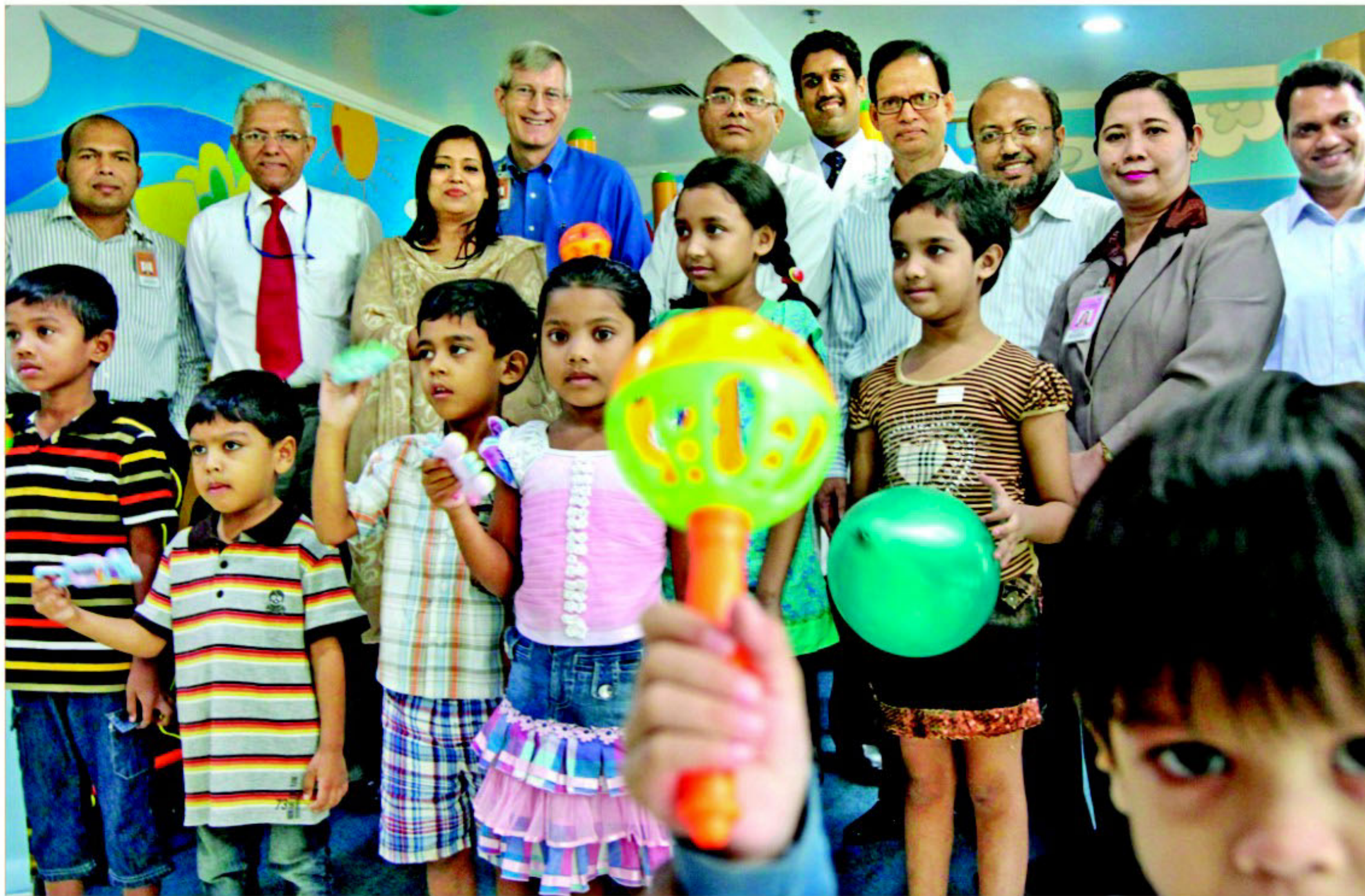
Consultants and senior management officials of Apollo Hospitals pose for a photo with children at the hospital in the city yesterday after launching a screening programme to detect hearing defects of newborns.

Besides, Bangabandhu Sanskritik Charcha Sammilan Parishad will arrange a commemorative meeting at Chittagong Press Club on October 15.