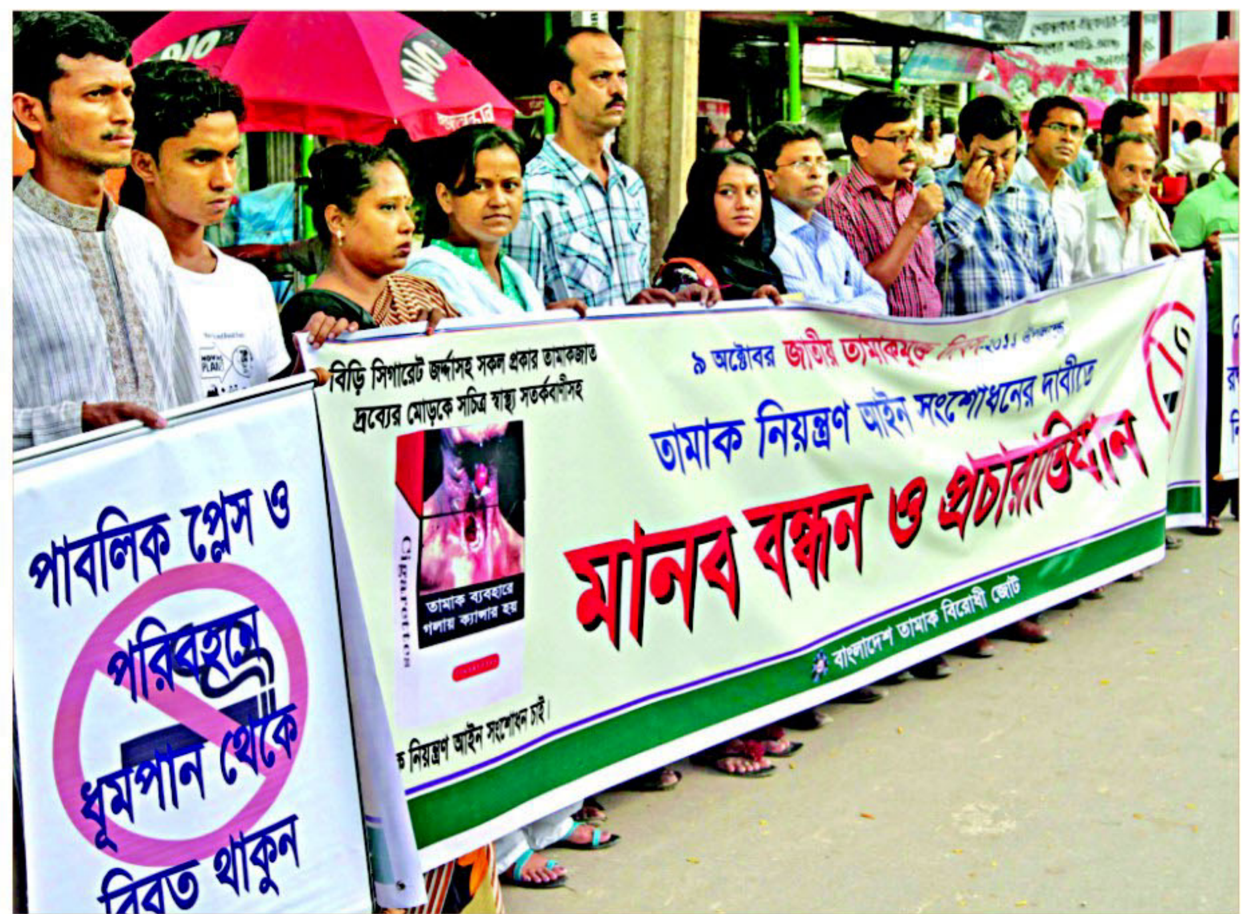
Bangladesh Tamak Birodhi Jote forms a human chain, marking World No Tobacco Day, in front of Jatiya Press Club in the city yesterday demanding reforms in the anti-tobacco act.