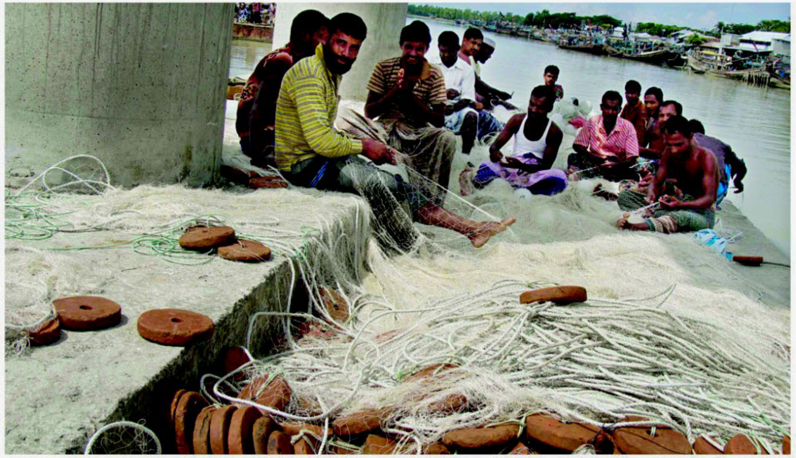
Fishermen mend their nets as an 11-day Hilsa fishing ban leaves them with not much else to do. The photo was taken at Mahipur near Kuakata of Patuakhali yesterday.