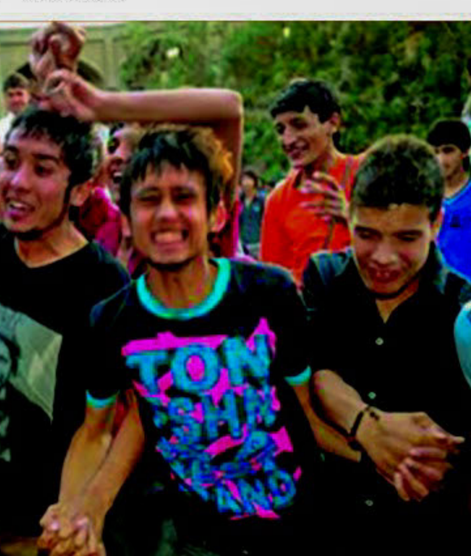
The event finished in the Central Sound Festival at Bagh-e Babor Gardens.