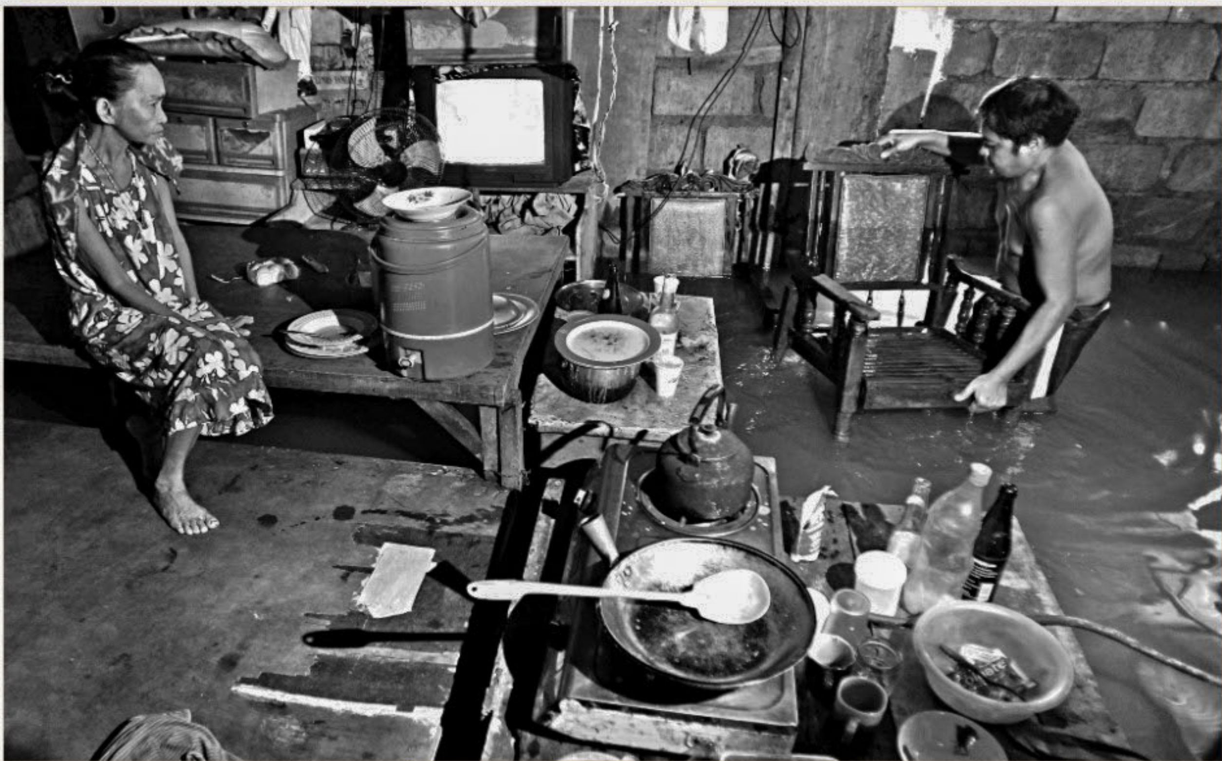
A man wades in floodwaters as he lifts a chair inside his house in Masantol town, Pampanga province, north of Manila yesterday. Rescue helicopters and boats distributed food, water and medicine to thousands of Filipinos marooned in flooded towns north of the capital on Monday and authorities said water levels were starting to recede, following Typhoons Nesat and Nalgae.