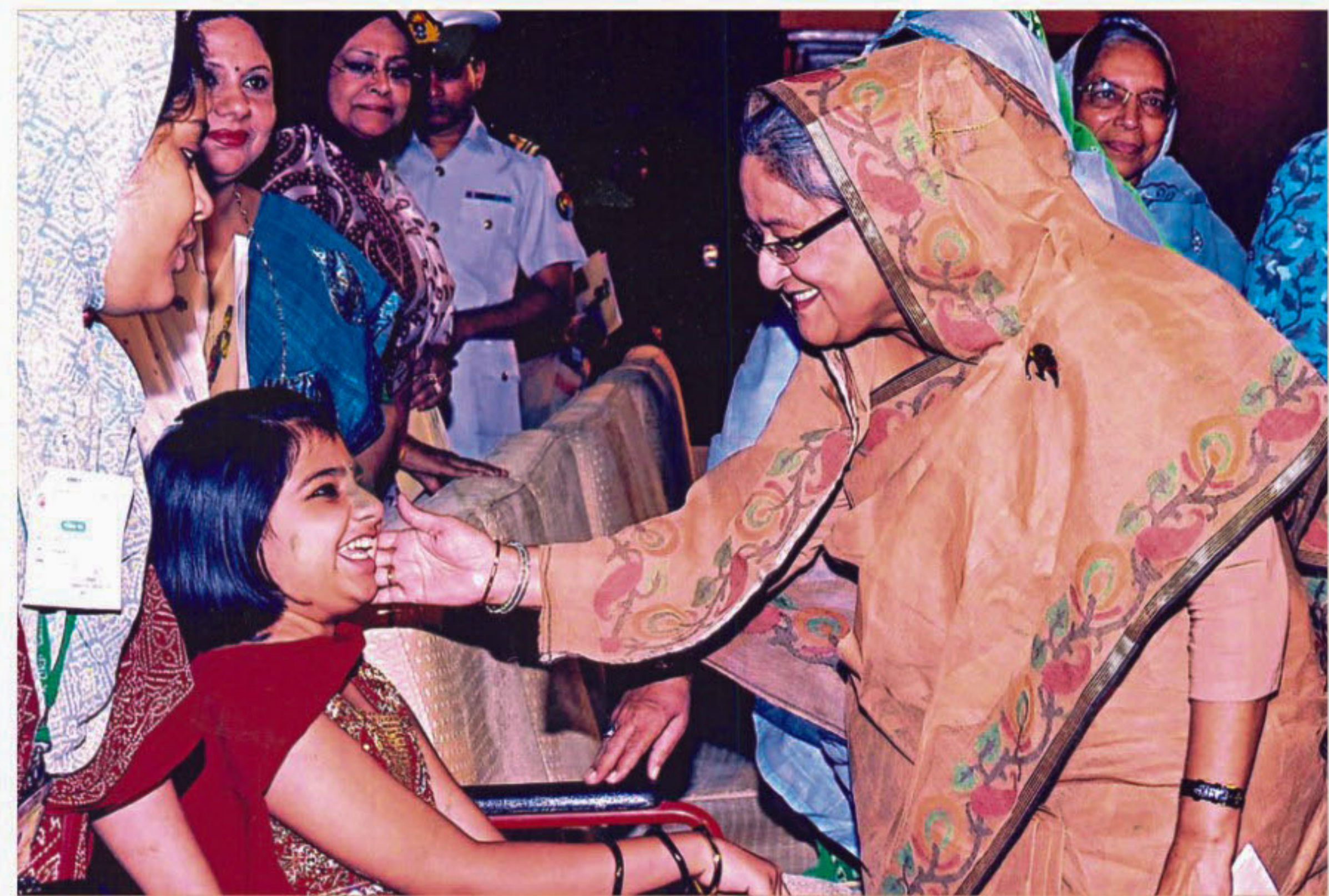
Prime Minister Sheikh Hasina affectionately pats a child on the cheek at Osmani Memorial Auditorium in the city yesterday at a programme marking World Children's Day.

In this regard, she mentioned that it is very hard to find any playground in the cities due to greed of the land developers. "We've to ensure safe places where children will be able to play. We are working to do this," she said. Hasina said Bangladesh is one of the countries which ratified the UN Child Rights Charter. In line with this charter and the country's constitution, she said her government has formulated the National Child Policy 2011. She said father of the nation Bangabandhu Sheikh Mujibur Rahman loved children and had formulated the child policy in 1974, 15 long years before the adoption of the UN Child Rights Charter. In order to spread Bangabandhu's love of children to the new generation, she said March 17, the birthday of Bangabandhu, is being observed as National Children's Day every year. She said every child has the right to have a name since its birth, to have vaccine from its 25th day, breastfeeding up to six months and right to go to school from five years. Hasina said to ensure good health of mother and child, her government has created three thousand midwives, strengthened Bangladesh Breastfeeding Foundation, established health and family welfare centre up to union level and increased maternity