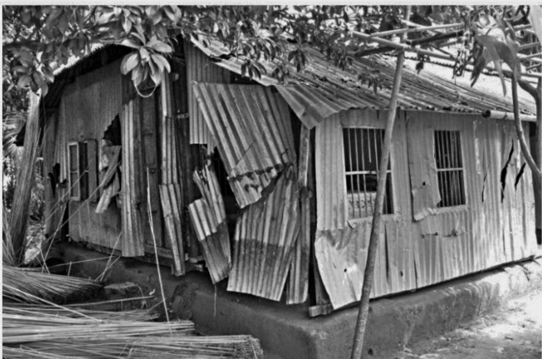
One of the 15 houses damaged during September 3 attack on 'opponents' by the gang led by Dulu Munshi at Kotakol village in Lohagara upazila of Narail district. The gang, backed allegedly by the local union parishad chairman, also injured 10 people on the day.

Locals, however, said Dulu Munshi is moving freely in the area.