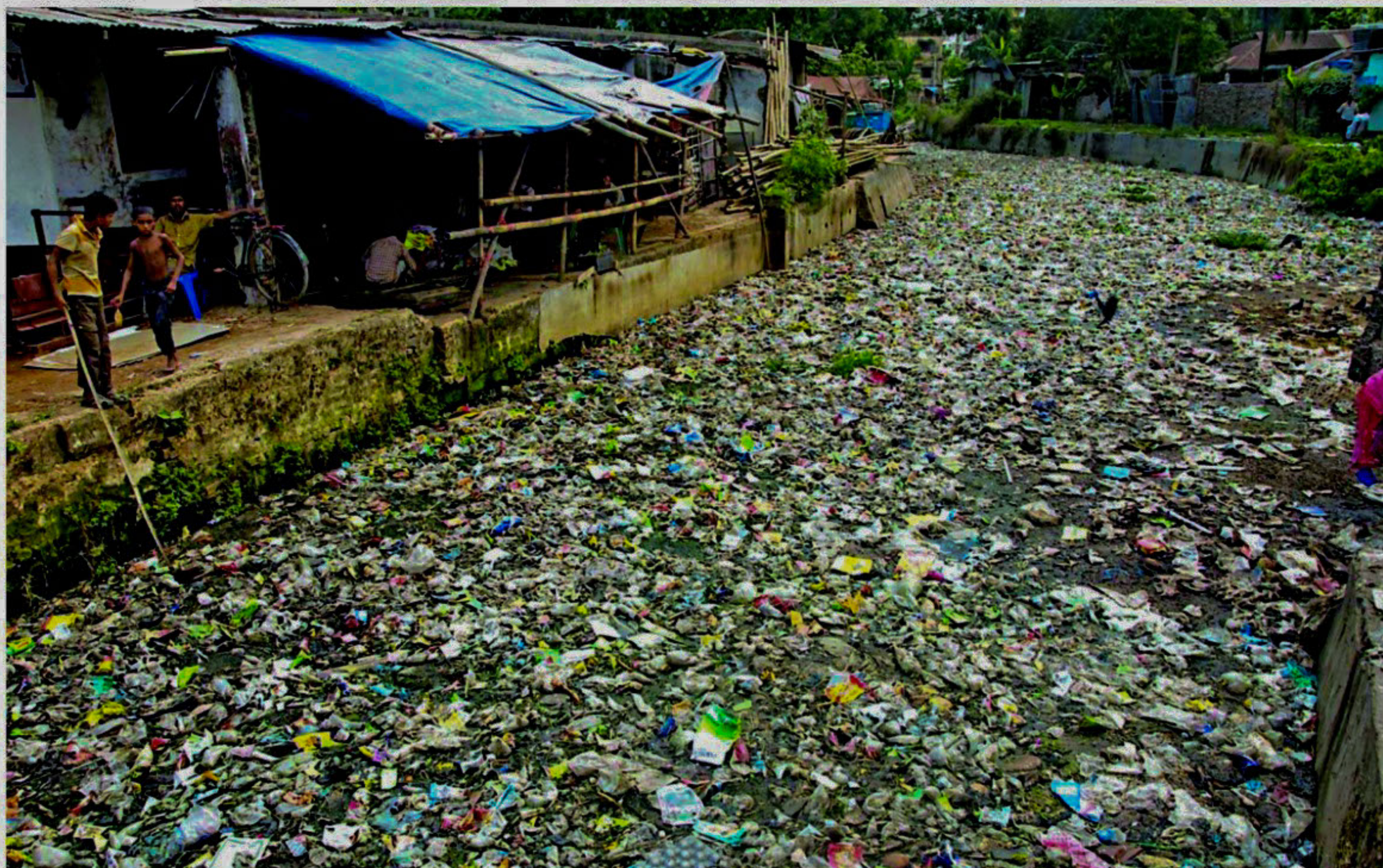
Hard to imagine this is actually the once-flowing Chaktai Canal, now clogged and choked by garbage. Nearby areas like Chawkbazar in Chittagong are dependent on this canal for storm-water drainage. But wholesale littering has left the canal in such an appalling state. The photo was taken recently.